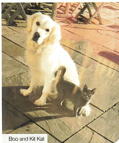
Boo and Kit Kat

Do you have a pet you'd like to feature in a future edition? Paws, claws & hooves considered! Email rollestonjunction@gmail.com entitling your message 'paws for thought'.