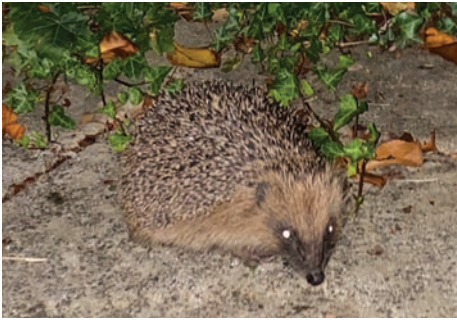
Hedgehog sightings on Holly Court

Hedgehogs roam between 1 - 2 km each night during their active season when they are finding a mate. By linking gardens, that really helps hedgehogs and all they need is a 13 x 13cm (5" x 5") hole in walls or fences; this will let hedgehogs through, but be too small for most pets. If you have made a hole in your garden wall or fence you can record it on the app. You can also buy 'Hedgehog Highway' signs (made from recycled plastic) to fasten above the hole to show how you are helping hedgehogs and encourage others to get involved.