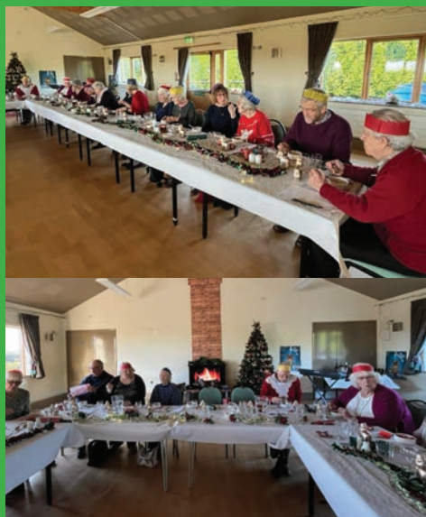
Seniors' Christmas Lunch