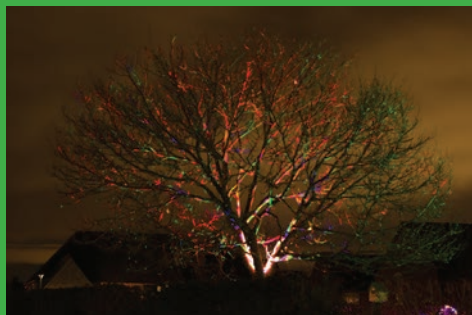
Christmas Lights in the Village