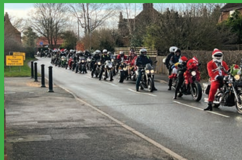
Motorbike Toy Run