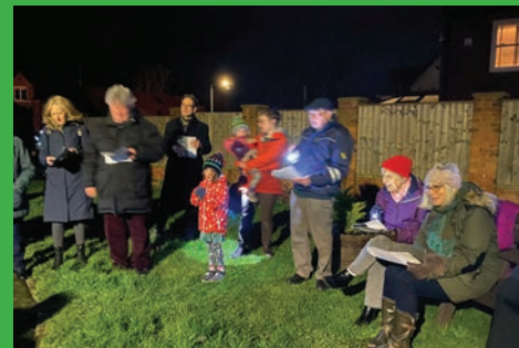
Carols Around the Tree