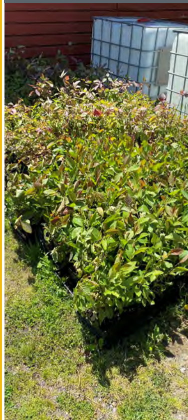
Various tree species planted at the Horn Farm

From April – May volunteers were busy planting at Horn Farm! A 6 acre Riparian Buffer was planted and the start of a 20 acre planting project began! We were happy to be able to fund 1 acre of the 6 acre Riparian Buffer with 2020 CAP funding. The 20 acre planting project is being supported by the Department of Conservation and Natural Resources, PennVest, and the Keystone 10 Million Trees Partnership. There is still opportunity to help with the 20 acre planting! Wednesdays and Sundays in June will be focused on the completion of that project. Head over to https://hornfarmcenter.org/riparian-volunteer/ to sign up for a day. It is great fun, as well as hard work, with amazing people!