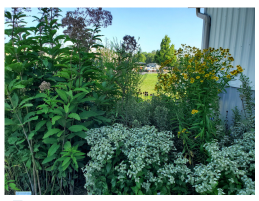
by Phyllis Koster at EAC's pollinator display garden at Flinchbaugh's. In full boom last summer