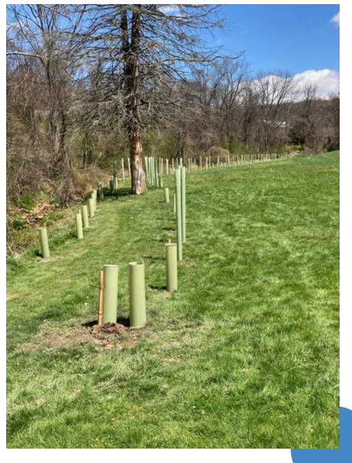
from April 2022 tree planting in Hellam Township with the EAC and Master Watershed Stewards

The EAC invites input and volunteers! What concerns do you have about the health of our water, air and land in the private landowners in Hellam Township to Township? Would you like to help? Contact jmueller@fandm.edu