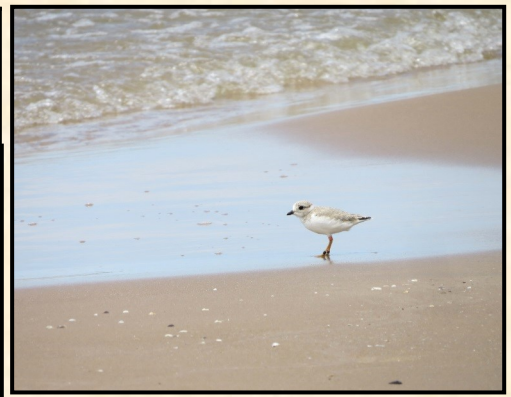
PIPING PLOVER South Colwell Pond, Lakeview WMA August 2022

To subscribe to e-mailed information from the DEC (select from over 100 topics), go to the subscription page on DEC's website at DEC Subscriptions