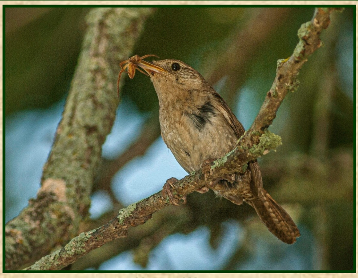
HOUSE WREN Antwerp - July 2022