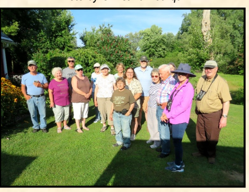
THE ANNUAL PICNIC Brouse Preserve - July 10, 2022