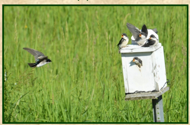
TREE SWALLOWS Three Mile Bay - August 2022