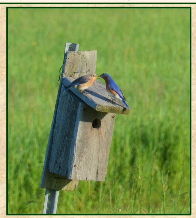
EASTERN BLUEBIRDS FEEDING Three Mile Bay - August 2022

The following three pages are included only with the electronic version of the Plover , as a thank-you to those who save the Club money by receiving the newsletter by e-mail. The pages include additional photos from our members and other materials of interest.