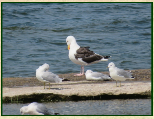
GREAT BLACK-BACKED GULL Point Salubrious - August 26, 2022