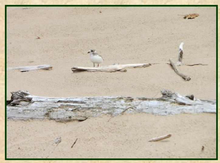
PIPING PLOVER South Colwell Pond, Lakeview WMA August 2022