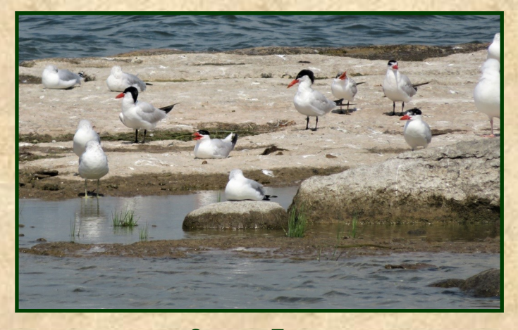
CASPIAN TERNS Point Salubrious - August 26, 2022