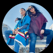
The Luna Blues Machine

Education Services Specialist, M.Ed, MBA, US Army