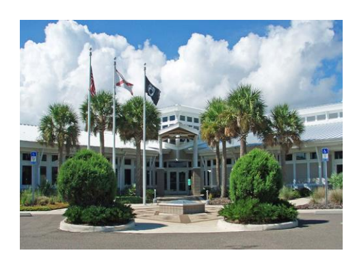
Beautiful indoor and outdoor venue!

GTM Environmental Education Center 505 Guana River Road Ponte Vedra Beach, Florida 32082