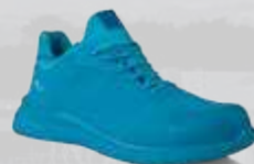
GLIDE LADIES AQUA

METAL-FREE | ESD | CARBON TOE CAP KEVLAR MIDSOLE | PU/PU SOLE