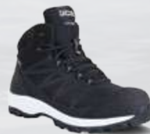
SUPREME HI TOP WHITE

METAL-FREE | ESD | CARBON TOE CAP KEVLAR MIDSOLE | EVA/RUBBER SOLE