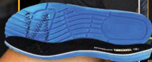
HIGH PERFORMANCE INNER SOLE