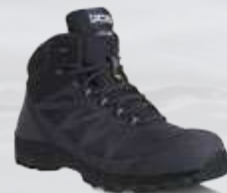
SUPREME HI TOP BLACK