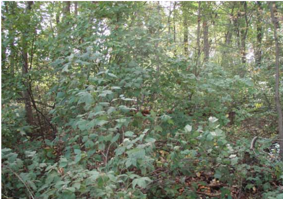
Native viburnum species in the red oak-mixed hardwood forest