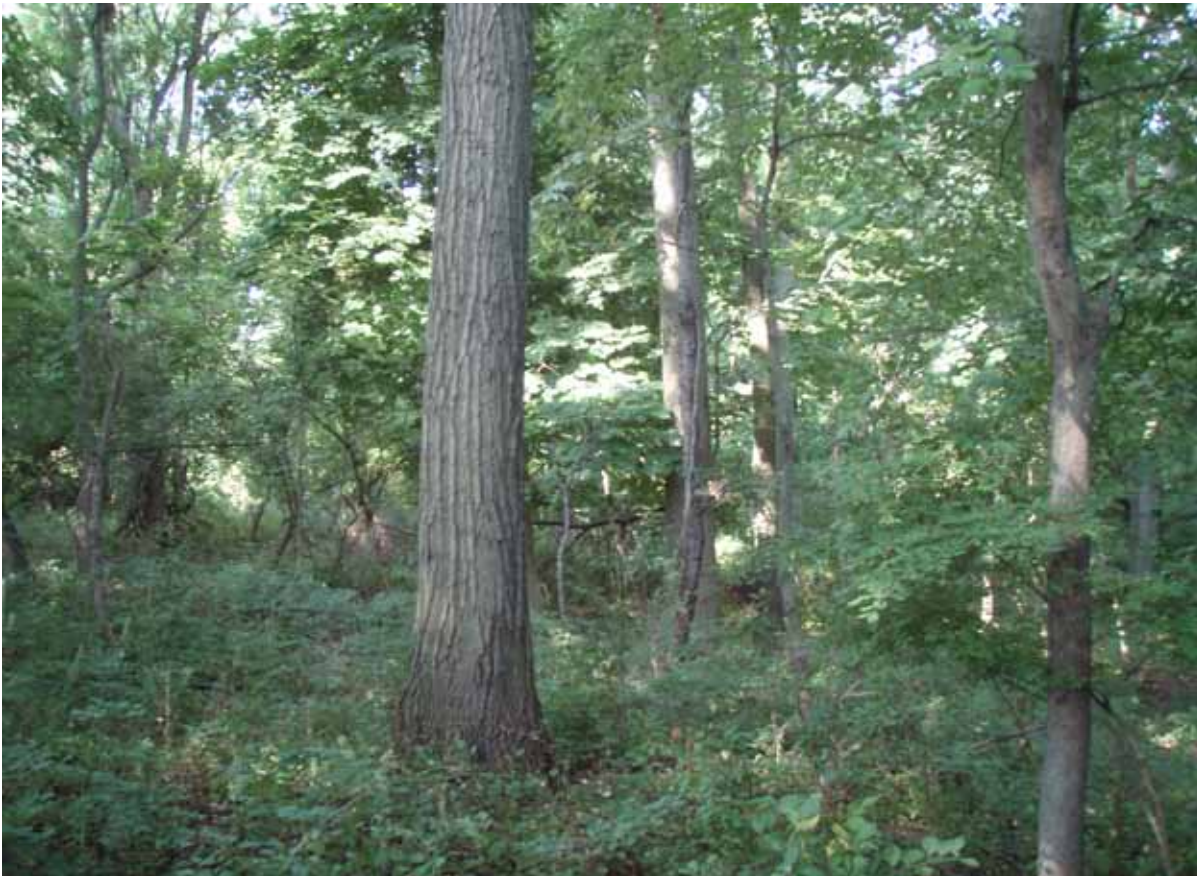
Red oak-mixed hardwood / tuliptree-beech-maple forest

A mature red oak – mixed hardwood forest occupies much of the western half of the Park and has existed since at least the early part of the 1900's (see Historical Aerial Photography 1937 ). The forest canopy is dominated by red oak ( Quercus rubra ), white oak ( Quercus alba ), and tuliptree ( Liriodendron tulipifera ), with red maple ( Acer rubrum ), black gum ( Nyssa sylvatica ), ash ( Fraxinus sp.), sassafras ( Sassafras albidum ), and Norway maple