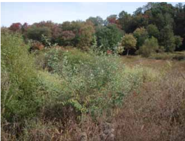
Autumn-olive at edge of wet meadow