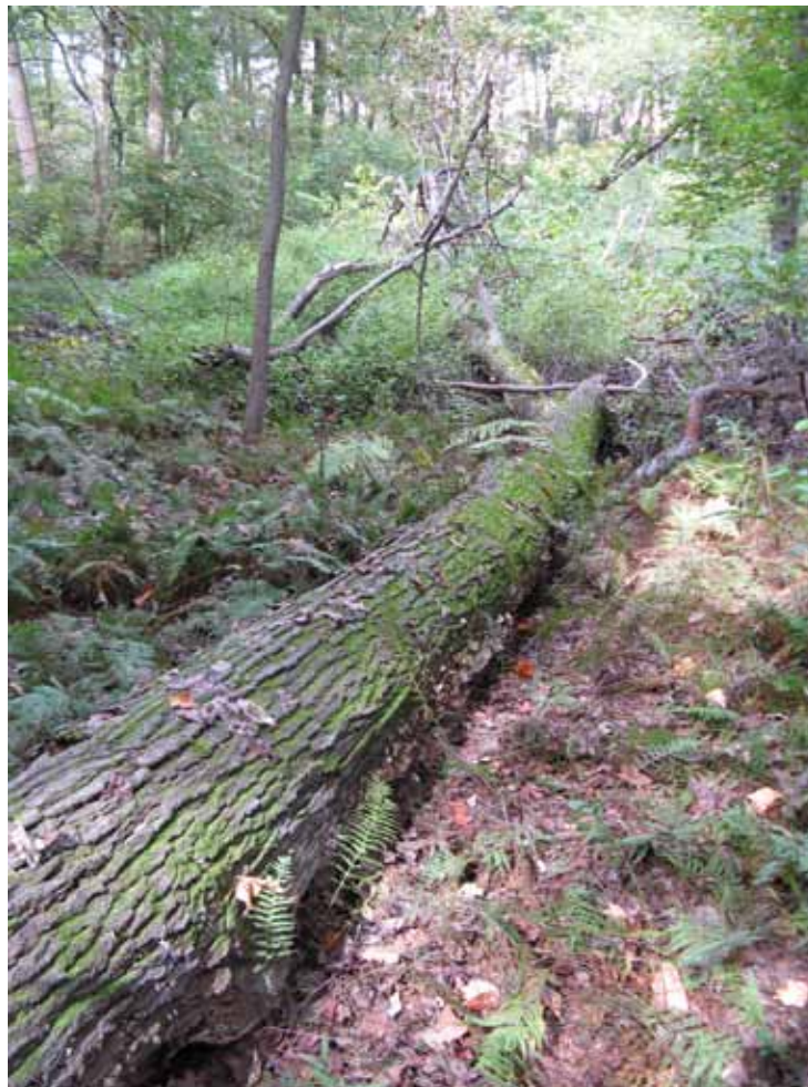
Down wood in mature forest

According to a Pennsylvania Natural Diversity Inventory (PNDI) Environmental Review of the