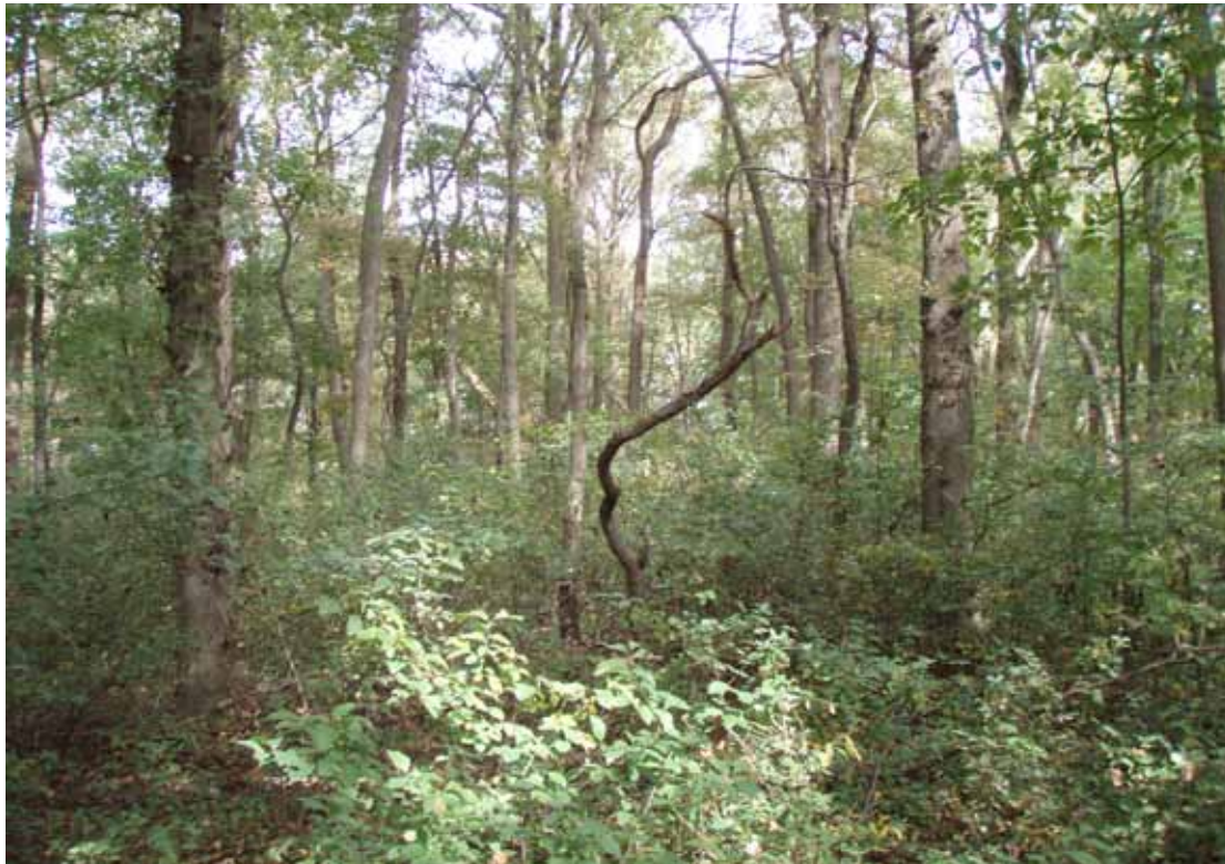
Red oak-mixed hardwood forest