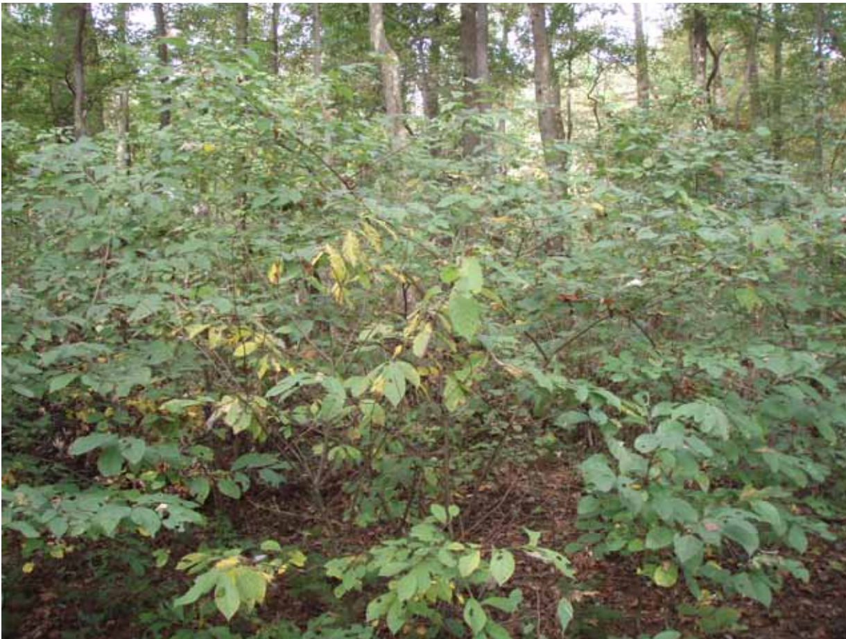
Dense spicebush in the mature forest