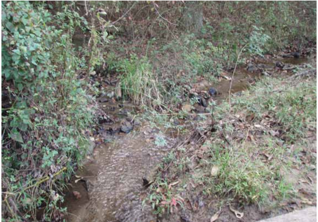
Confluence of two headwater streams