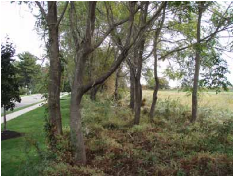
Grove of tree-of-heaven on neighboring property

The “Native Plant Materials” section of Natural Lands Trust’s Stewardship Handbook for Natural Lands in Southeastern Pennsylvania (2008) also provides a list of additional native species that are appropriate for the natural areas in the Park. Natural Landscapes Nursery in West Grove (Jim Plyler, phone: 610-869-3788, website: www.naturallandscapesnursery.com ) is a local wholesale supplier of native plant species.