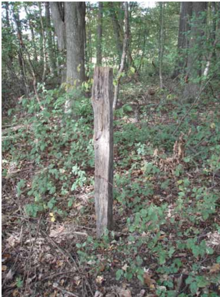
Old barbed-wire fencing