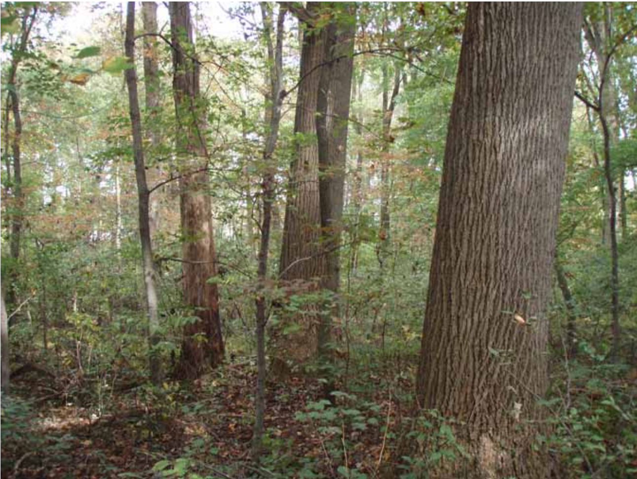
Tuliptrees and snag