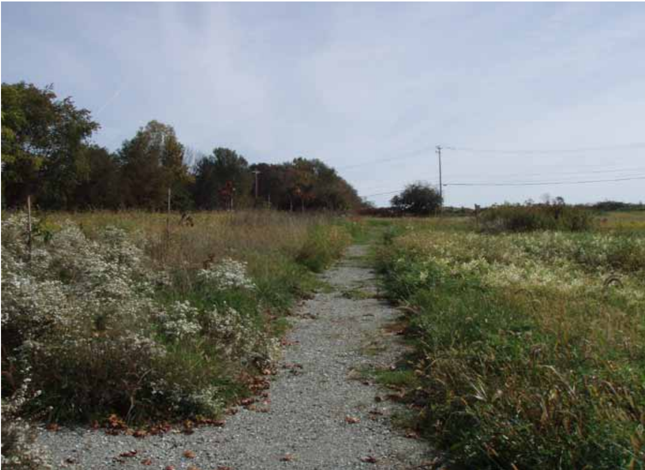
Public trail in New Daleville Park

A mature upland forest with numerous springs, a shrub swamp, wet meadow, and old fields characterize the scenic landscape of the New Daleville Park. The terrain slopes from higher elevations along Daleville-Jennersville Road down to the drainageway of a tributary of Doe Run in the western-northwestern part of the property. (see Environmental Features map ). The diversity of natural habitats in the Park offer many passive recreational and environmental educational opportunities for Township residents.