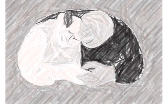
We ALL Matter.

Do not cast me off in the time of old age; forsake me not when my strength is spent.