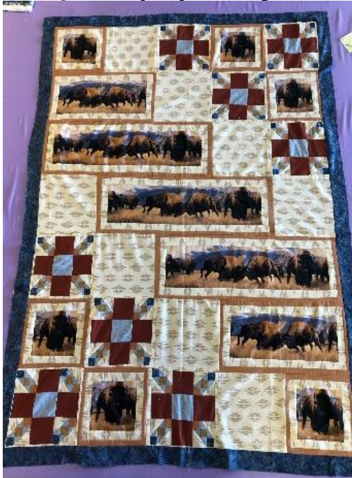
Fabric by Northcutt, Artist Al Agnew