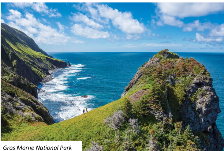
Gros Morne National Park

delicious farewell dinner. Today's breakfast, lunch and dinner are included