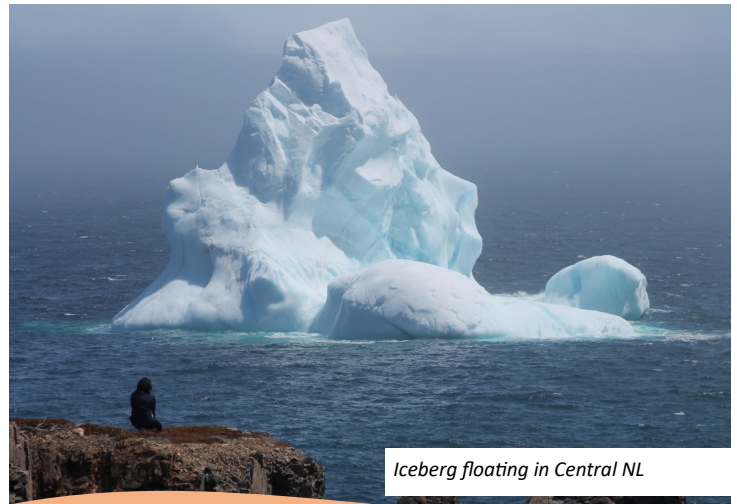
Iceberg floating in Central NL

Today's breakfast and dinner are included