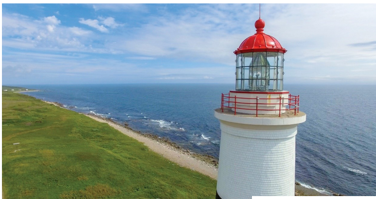
Point Amour Lighthouse

This morning we travel to L'Anse Aux Meadows. This famous location is believed to be the earliest European settlement in the New World. A reconstruction documents the Norse settlement inhabited by Vikings some 1,000 years earlier. Learn more of Newfoundland's Vikings and their way of life during your visit to this internationally acclaimed historic site. Later, visit the Grenfell Centre, a museum dedicated to famed local