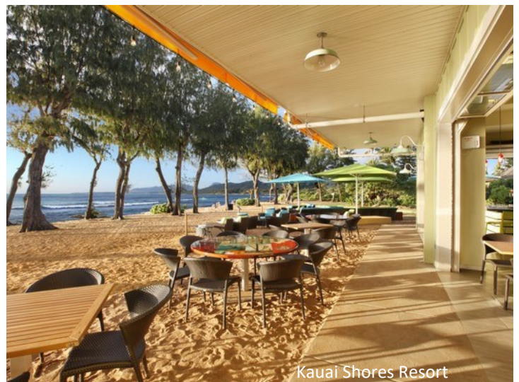
Kauai Shores Resort

Arrive home in true aloha spirit from the Garden Island of Kauai, Hawaii's most Hawaiian island.