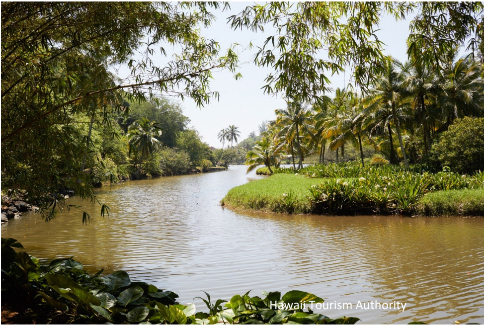
Hawaii Tourism Authority