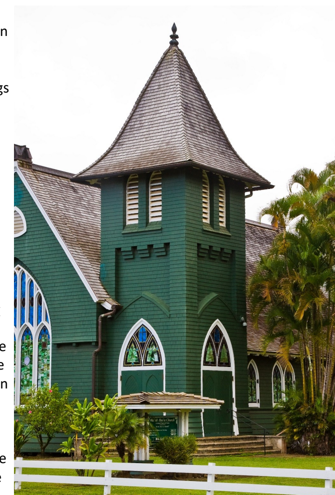
Hawaii Tourism Authority

After breakfast, your tropical journey expands with a day filled with nature, history, and culture. We drive through century-old eucalyptus trees. After a stop at the Hanapepe Valley lookout to see a historical tropical valley once a Hawaiian taro farm, we visit the Russian Fort Elizabeth State Historical Park, home to the last Russian fort in the Hawaiian Islands. The next historical monument in our day commemorates Captain James Cook, who landed at the mouth of the Waimea River in January 1778. Before returning to the hotel for a leisurely evening, we will marvel at the Grand Canyon of the Pacific, Waimea Canyon, from its jagged cliffs to the clear, bright blue ocean.