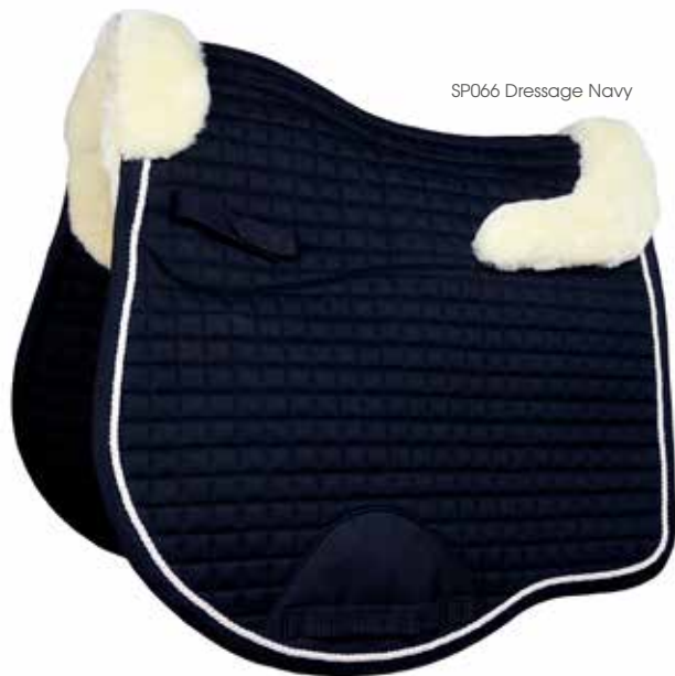
SP066 Dressage Navy

SIZES: PONY OR FULL COLOURS: RED OR NAVY