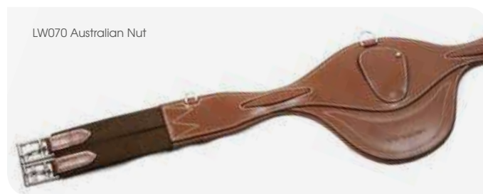
LW070 Australian Nut