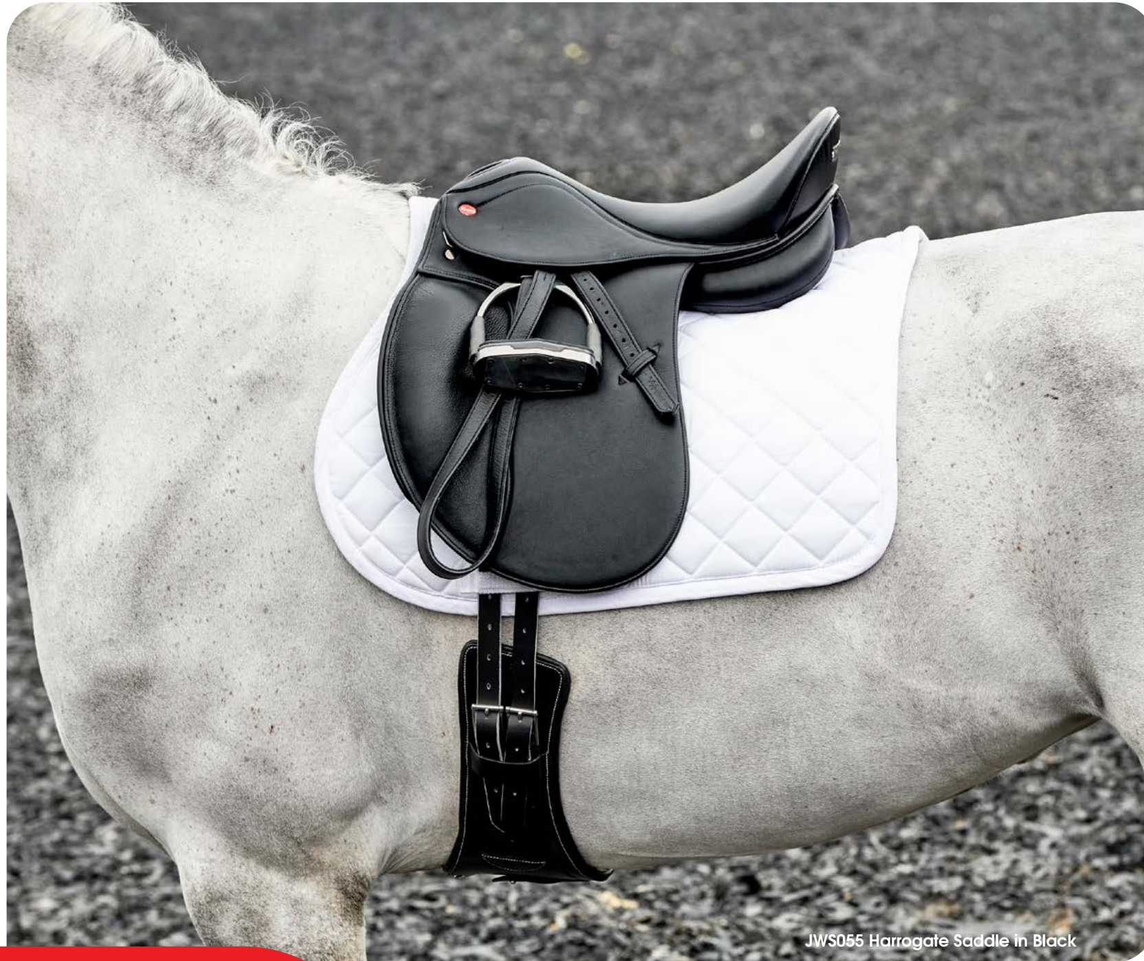
JWS055 Harrogate Saddle in Black