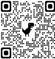
Click this QR code to visit Vanco, our online giving portal.