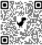
Click this QR code to visit Vanco, our online giving portal.