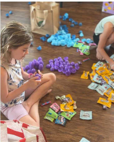
The girls loved helping, maybe because of all the candy...?!

week, the day of the hunt was sunny and perfect! We had around 25 kids show up, and around 10-12 parents. It was a great success! Every child went away with a bucket full of eggs, we got to meet and chat with many neighbors who some we'd never met before, and they were all blown away that we put it on. One neighbor even grabbed his Easter backdrop so that parents could take photos of their kids. We were thrilled with how it all went.