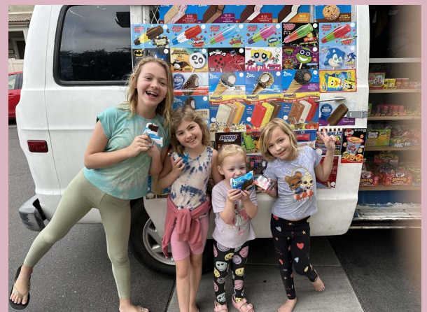
The girls had never seen an Ice-cream truck before so were very excited!