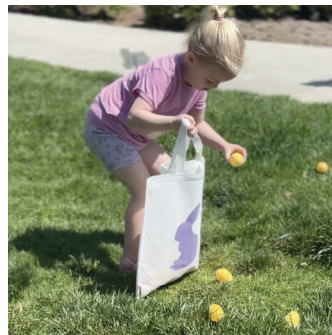
They also loved joining in with the egg hunt.