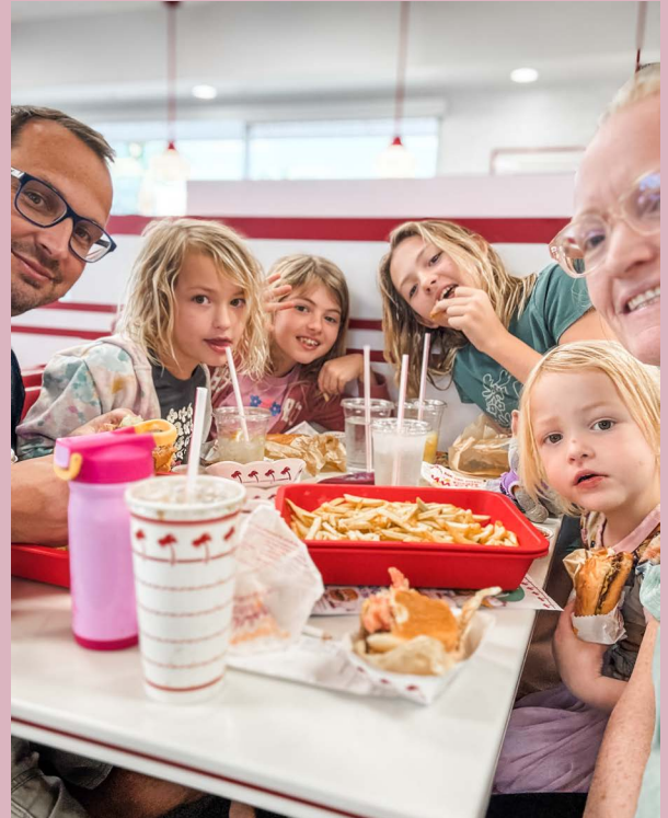
We took the girls to In N Out - a very California thing to do. They loved it!