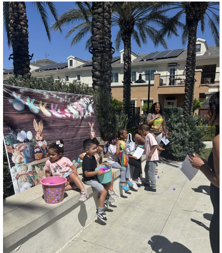
Some of the kids at the end of the event hanging around while the parents chatted.