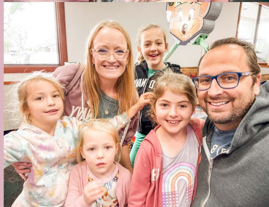
We went to Chuck-e-Cheese to celebrate of course!