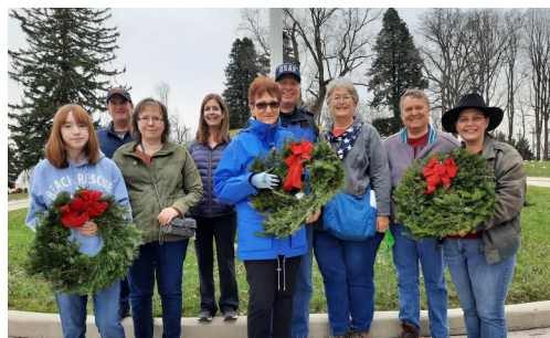
Wreaths Across America, Blue Star Family at Culpeper Cemetery on 18 December 2021.