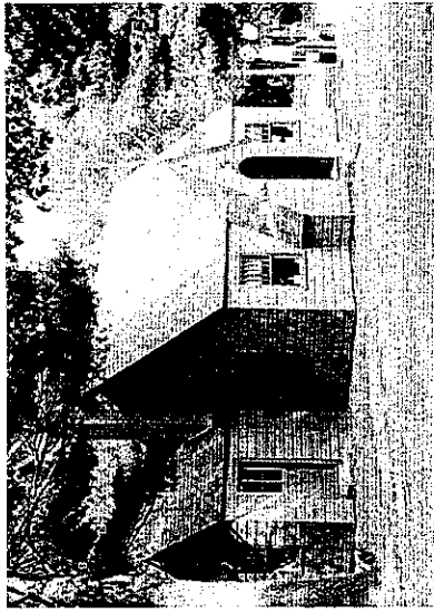
Rollins Store and Post Office West Alton, NH