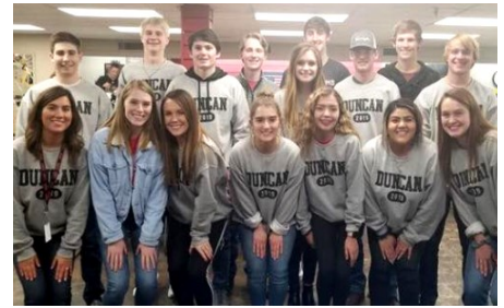
(Duncan High School Leadership Class at the J.O.H.N. 6:35 Free Dinner.)

CHURCH OFFICE CLOSED Monday, February 18 In Observance of Presidents' Day