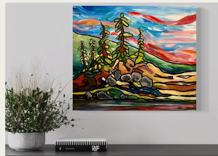
“REMEMBER TO GIVE THANKS”