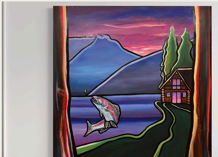
“THIS PLACE AT THIS HOUR”