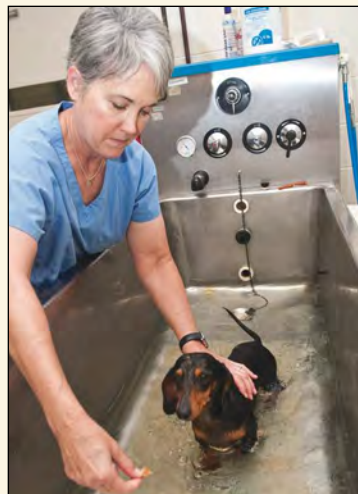
Figure 8. Hydrotherapy can be performed using a bathtub and food or toys to encourage the patient to walk in laps in the water.

Based on one study, when water levels are filled to the level of the hip and shoulder, the animal only bears 38% of its body weight on its limbs. 24 However, lowering the water level creates resistance and increases the amount of work the legs perform, building muscle strength.