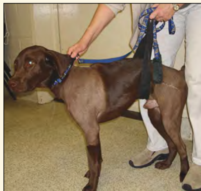
Figure 4. Sit-to-stands should be performed with a leash and a sling if patients need assistance with standing.