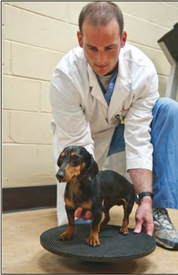
Figure 3. Wobble boards help support the patient as it maintains its balance.

limb. The patient must correct its balance by shifting weight to the affected limb. 3,11,16