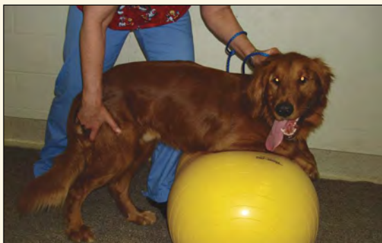
Figure 2. Therapy balls can help support weak animals or shift more body weight to an isolated leg