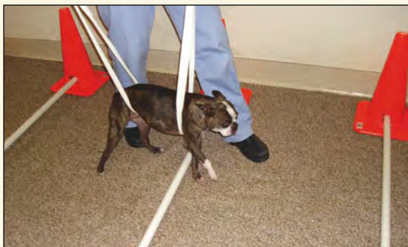
Figure 6. Cavalletti rails can be made from PVC poles and cones with slits cut in them at different heights.

Cavalletti rails are specifically indicated for: