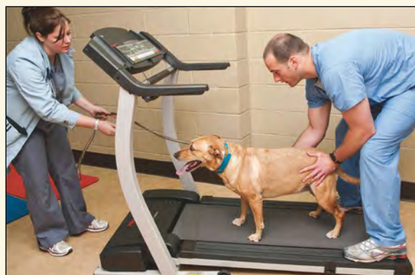
Figure 7. Land treadmills should be used with at least 2 handlers.

Treadmills should be used carefully, with at least 2 handlers and a leash (Figure 7). The handlers may position themselves in front of the patient to encourage forward motion and behind, above, or beside the patient to provide support, and possibly aid in gait and range of motion. 3,16