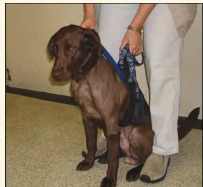
Figure 5. Sit-to-stands should be performed with the animal between the therapist's legs or in a corner to assure both legs flex underneath the body.