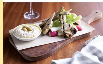
GRILLED ARTICHOKE WITH PRESERVED ...