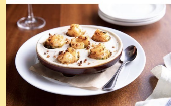
LUMP CRAB AND