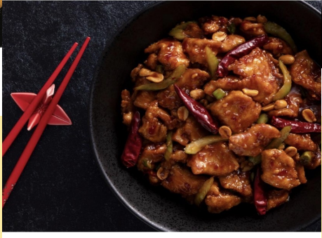
Kung Pao Chicken Lunch Special