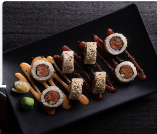
Spicy Tuna Roll