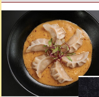
Miso Lobster Dumplings