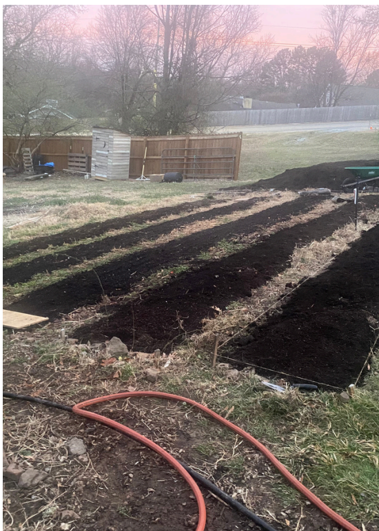
Springtime at the farm!

Nora- "Playing outside and flowers and trees blooming . I like seeing dragonflies!"