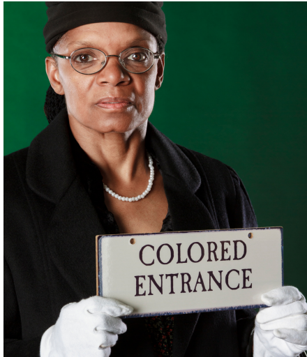
Rosa Parks holding a sign that reads "Colored Entrance"

Rosa Parks was an American civil rights activist who sparked the Montgomery Bus Boycott in 1955 by refusing to give up her bus seat to a white passenger. This event led to the desegregation of Montgomery's public transportation system. Parks continued her advocacy for civil rights, worked alongside Martin Luther King Jr., and was a board member of the NAACP. She is known for resisting racial discrimination and injustice and is considered a symbol of resistance.