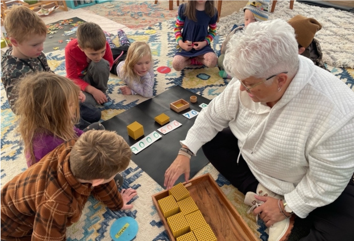
The Turtles' classroom got a Montessori makeover during the break and the children are responding wonderfully to it!