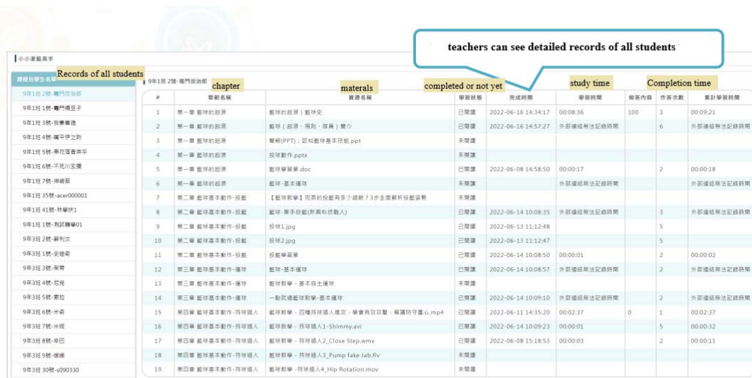
Figure 2. The main interface of the “Learning Process”.