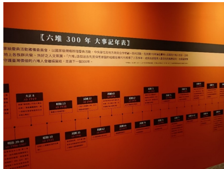
Figure 11. Video and Audio Recordings Displaying Significant Historical Events in the Liudui Region.

language teaching, and cultural revival (Figure 11). These displays not only highlight the historical context of the Liudui Hakka but also encourage visitors to emulate the spirit of their ancestors and carry forward Hakka culture (Pingtung Hakka Museum Service Plan, 2021).