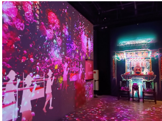
Figure 4. Traditional Hakka Cultural Symbols for Marriage and Ancestor Worship.