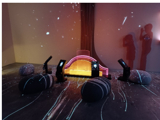
Figure 7. Tumulus-style Shrine of Kaiji Land Deity Art Installation Design.