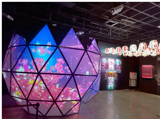
Figure 3. Projection Art Installation Symbolizing the Mother's Womb.