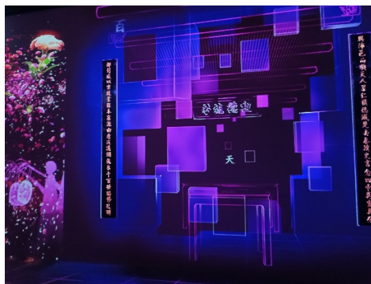
Figure 6. Interactive Projection Design of Roofbeam Couplets.