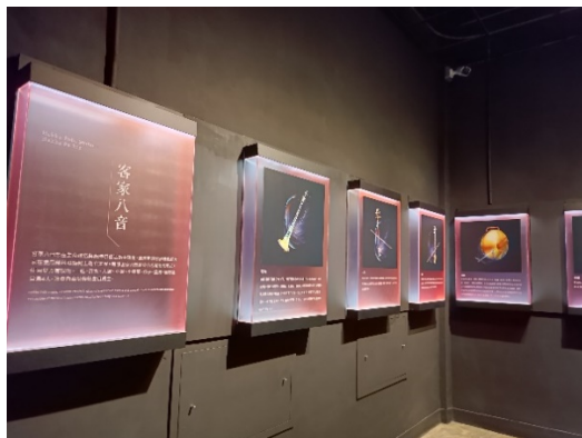
Figure 8. Introduction to The Eight Notes Traditional Hakka Music Folk.