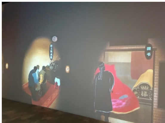
Figure 5. Funerary Rites and Honoring the Deceased.