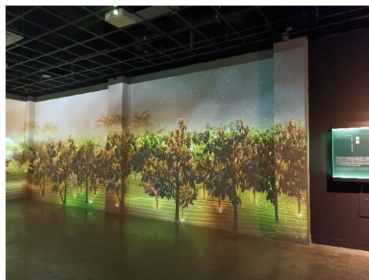
Figure 10. Interactive Wall Projection Device Showcasing Cocoa Tree Plantations.