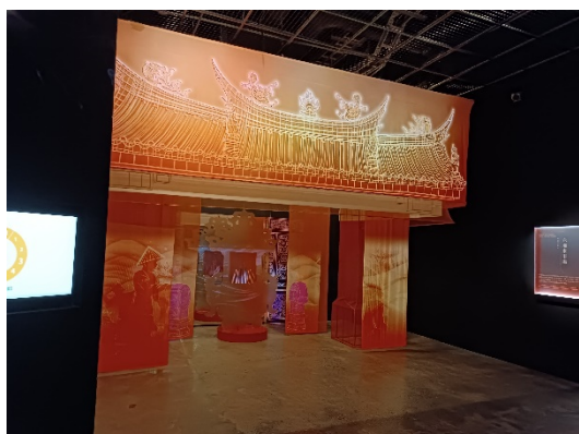
Figure 9. Light Sculpture Art Display of Neipu Tianhou Temple Showing the Bustling Rice Trade.

This exhibition area, through physical models, interactive projection devices, and videos, demonstrates the pioneering spirit of the Liudui ancestors and the process of regional industrial transformation. The transformation of the Liudui landscape from rice fields, banana plantations, and betel nut trees to cocoa trees showcases the development and metamorphosis of Liudui agriculture. This method and technology of presentation differ from traditional picture and text displays, making it simple and easy for the audience to understand and remember the evolution of industries in the Liudui region.