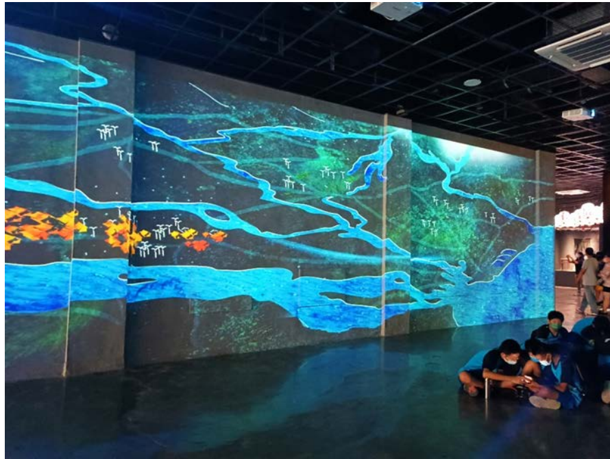
Figure 2. Immersive Digital Projection Entrance Corridor of Liudui Impressions.