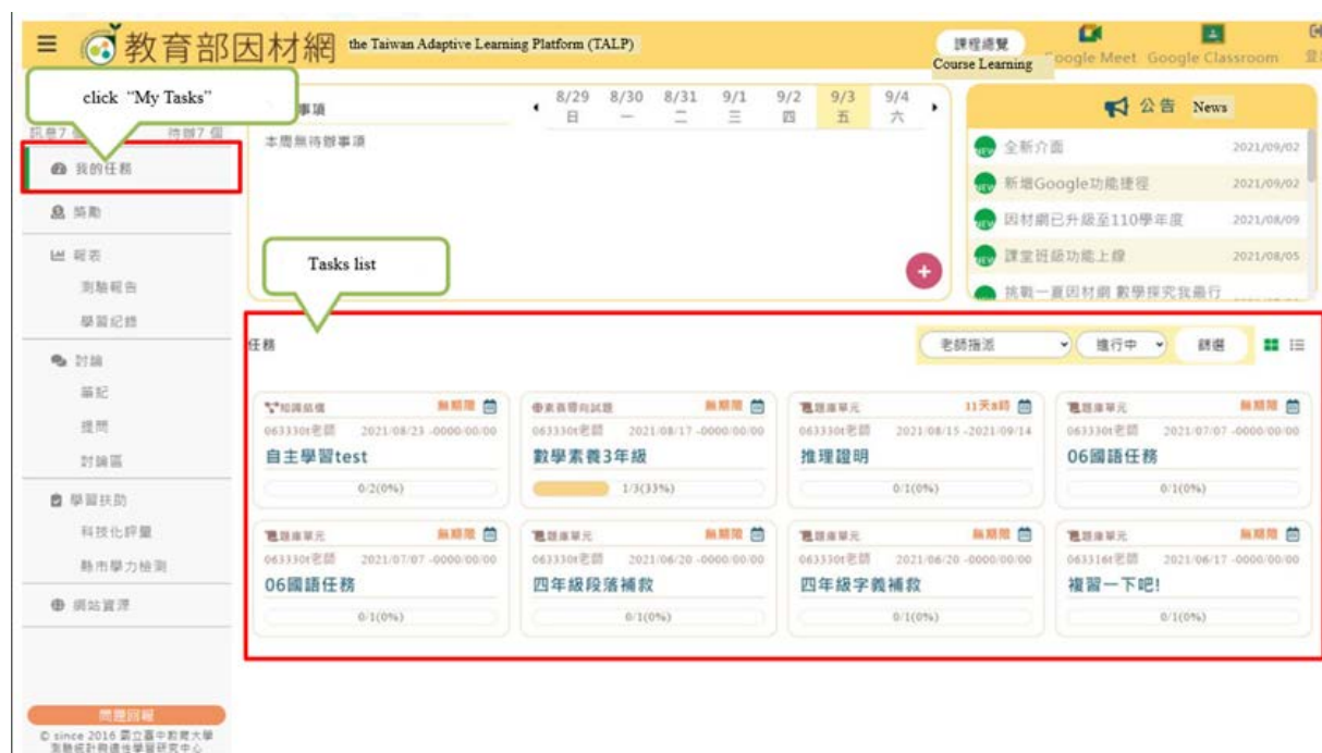
Figure 1. The main interface of the “My Tasks”.

On the other hand, teachers can use the relevant statistical reports to understand whether students have completed the learning content, progress of learning, and answer the questions, etc., to grasp students' learning situation and provide feedback accordingly to help students correct any possible misunderstanding, as shown in Figure 2.