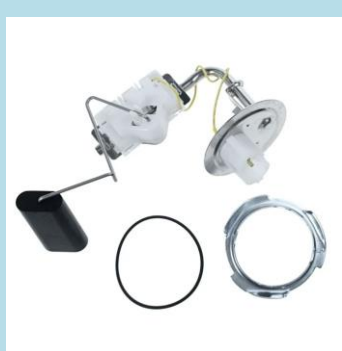
87-97 Fuel Sending Unit 22 ohm Empty – 145 ohm Full