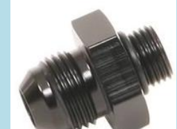
Aeromotive Universal Bypass Regulators 13130