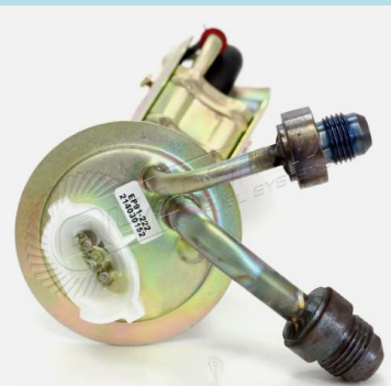
Hanger brand unknown. Came with tank purchased used/new. Closest found was on Ebay. - QFS Stainless 8AN/6AN Fitting Fuel Pump *Hanger Only* Fox/SN95 Mustang E85 Safe