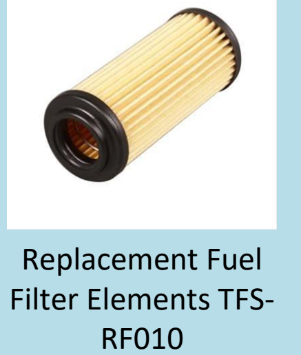
Replacement Fuel Filter Elements TFS- RF010