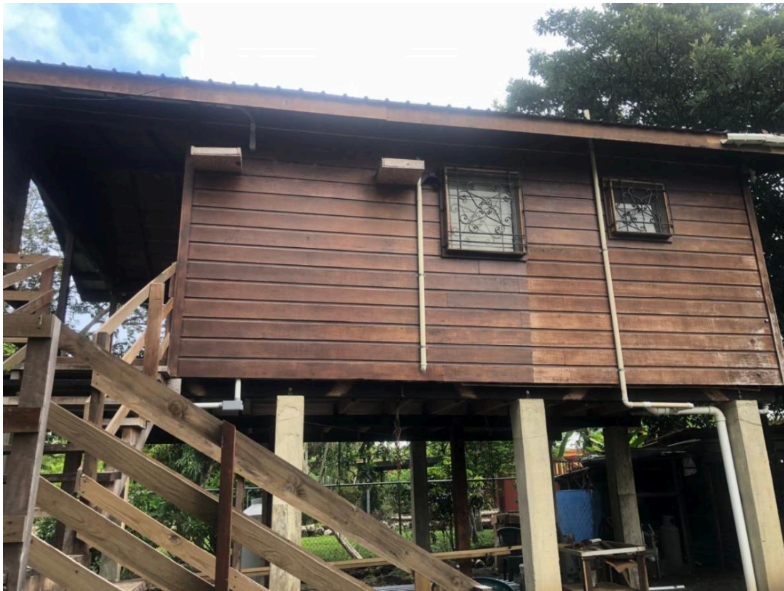
House in Bullet Tree

Possible Volunteers: I will be staying in a home near the property, I will have a room for one person to stay with me at no charge. The primary expenses to a volunteer will be airfare. I have a rental car and will pay for most meals. Please let me know when you are interested in staying. It is hot and physical work! (See pictures below.)