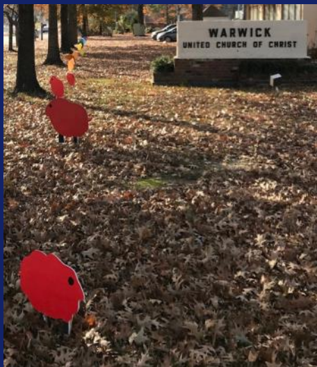
Our Parade of Rainbow Sheep attracting attention on J. Clyde Morris Boulevard.