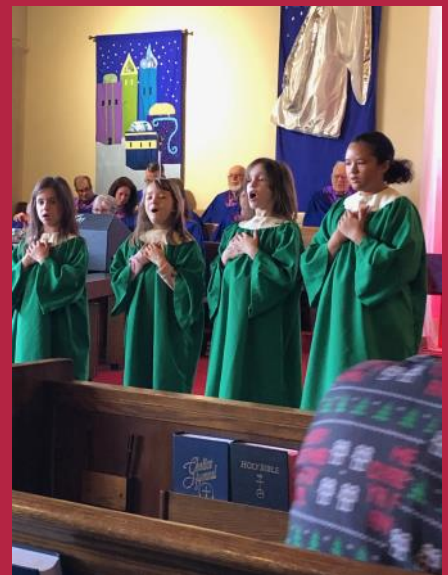
The Warwick UCC Chancel Choir and The Angel Choir performing on December 8, 2019