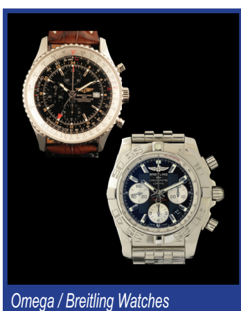
Omega / Breitling Watches