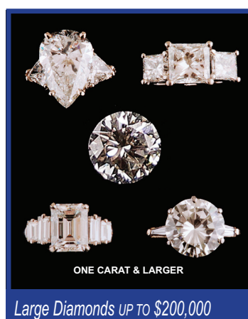
ONE CARAT & LARGER Large Diamonds UP TO $200,000