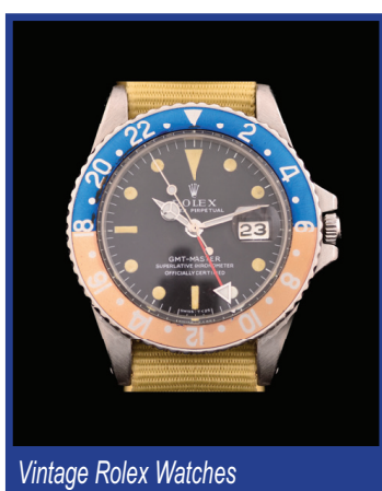
Vintage Rolex Watches

All Prices Based On Rarity And Condition.