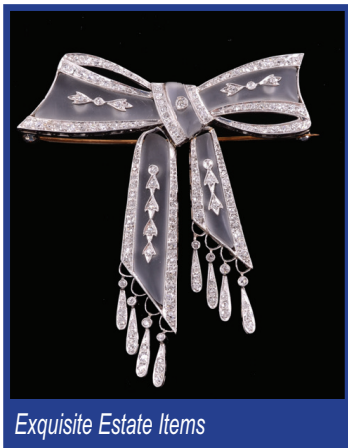
Exquisite Estate Items