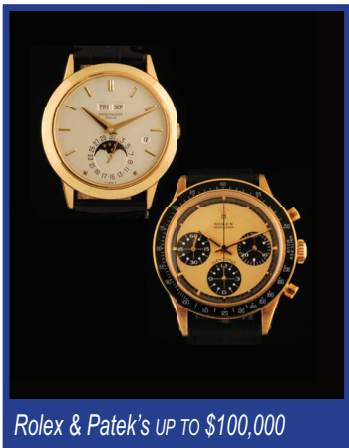
Rolex & Patek's UP TO $100,000