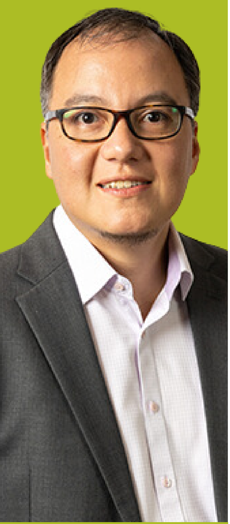
*The KLIKme Global Learning Exchange (GLX) is a program that facilitates meaningful connectios between Learners from disadvantaged communities in the Philippines with KAPATID Mentors and KAAKBAY Tutors from around the world.

I was born and raised in the Philippines but currently live in Singapore with my wife of 19 years and three kids. I currently work as a Management Consultant, supporting founder-led businesses in their entrepreneurial journey.