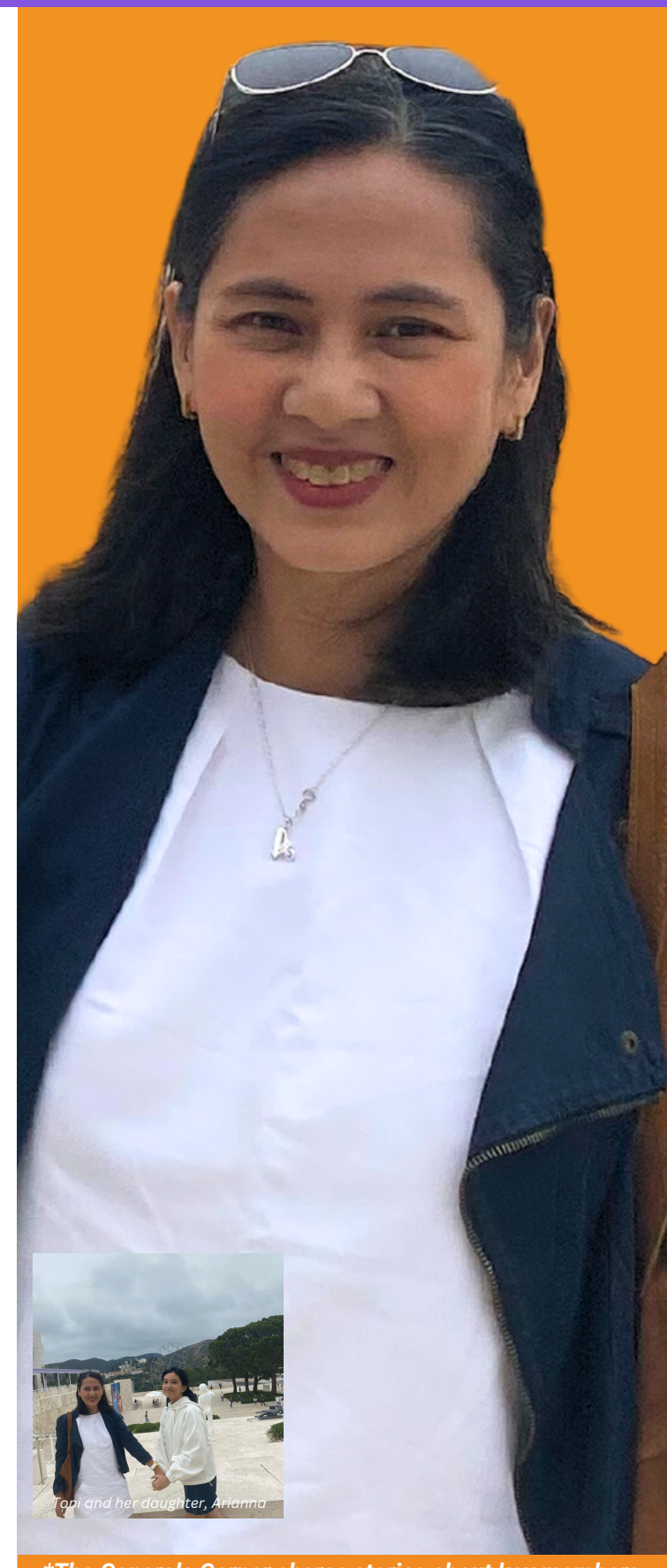
*The Generals Corner shares stories about key members of the KLIKme Team as leaders of the KLIKme Army of poverty warriors.

By being a KLIKme volunteer and giving my time and talent to others, something tells me that there's more for me to gain. For one, I know I'll come out a better person just by bravely being part of this greater cause. For now, it is more of my heart talking but, as experience has taught me, where my heart is, the rest of me follows.