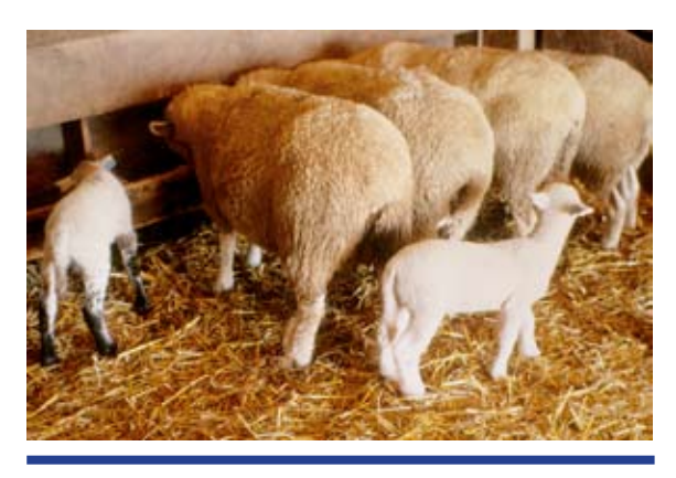
Table 2. Suggested daily rations for ewes (late pregnancy).

Consider using a marking system to check ram performance and to determine when ewes are bred so that you can predict lambing dates. A marking system can consist of a harness containing a crayon. Another method is to mix a coloring