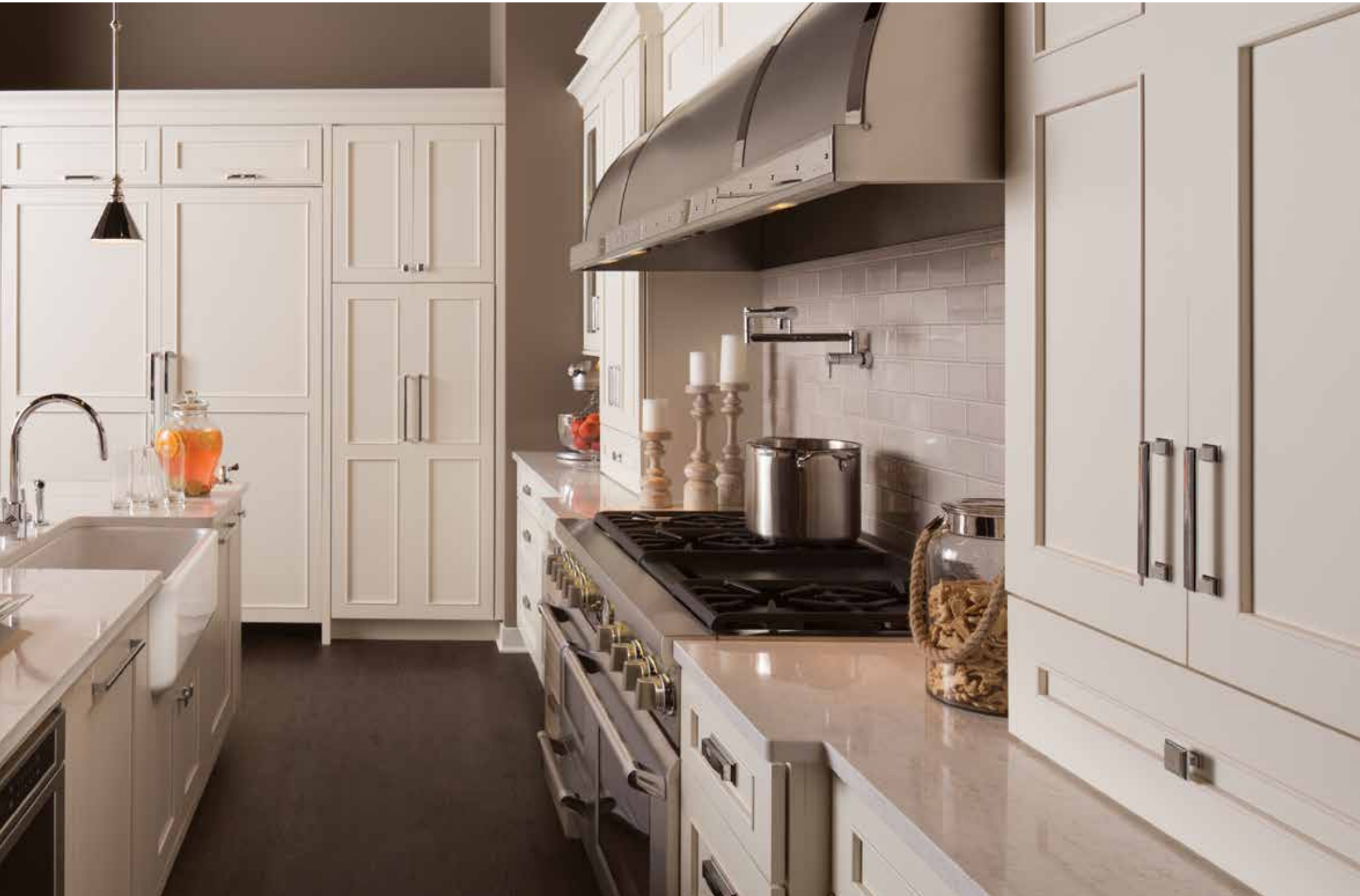
Crestwood Cabinetry shown with "Silverton" door style with Classic White paint.