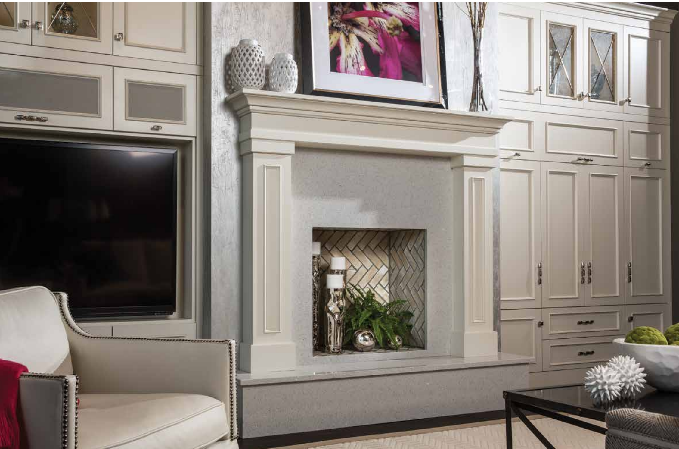
Bria Cabinetry shown with "St. Augustine" door style in Antique White/Pewter Accent painted finish with matching fireplace mantel.