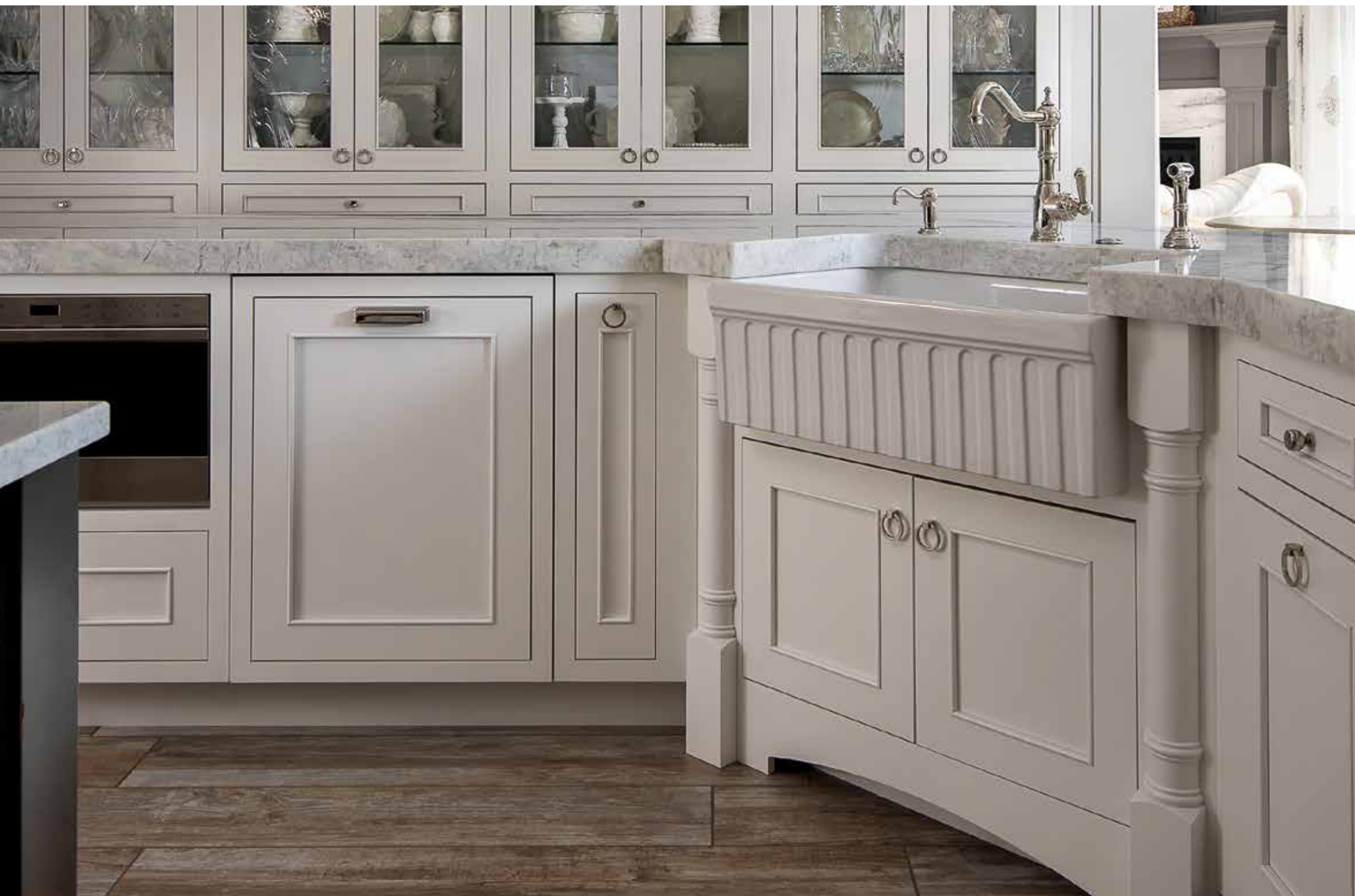
Crestwood Cabinetry shown in Inset Styling (non-beaded frame) with "Silverton" door style in White Paint.