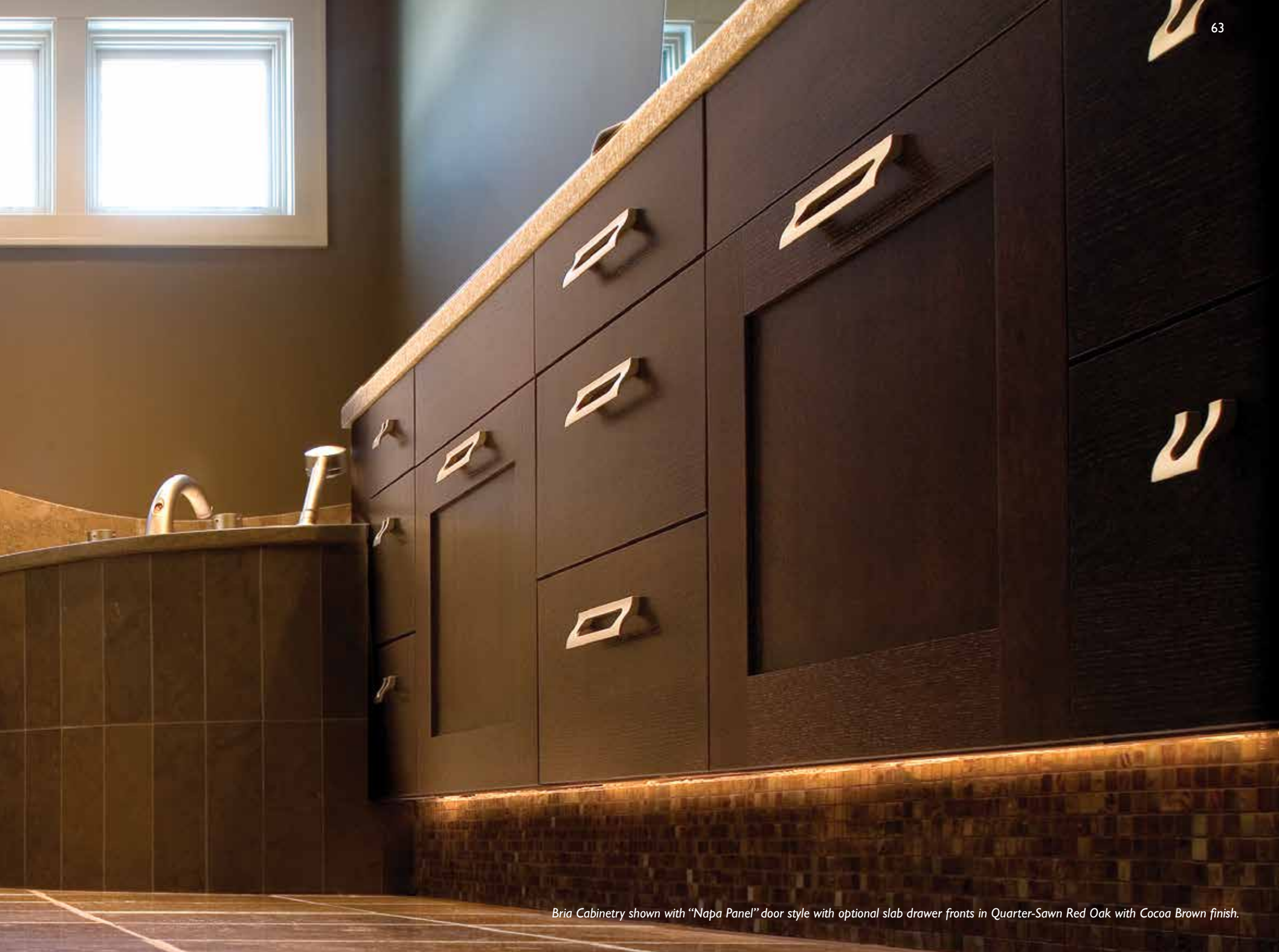
Bria Cabinetry shown with "Napa Panel" door style with optional slab drawer fronts in Quarter-Sawn Red Oak with Cocoa Brown finish.