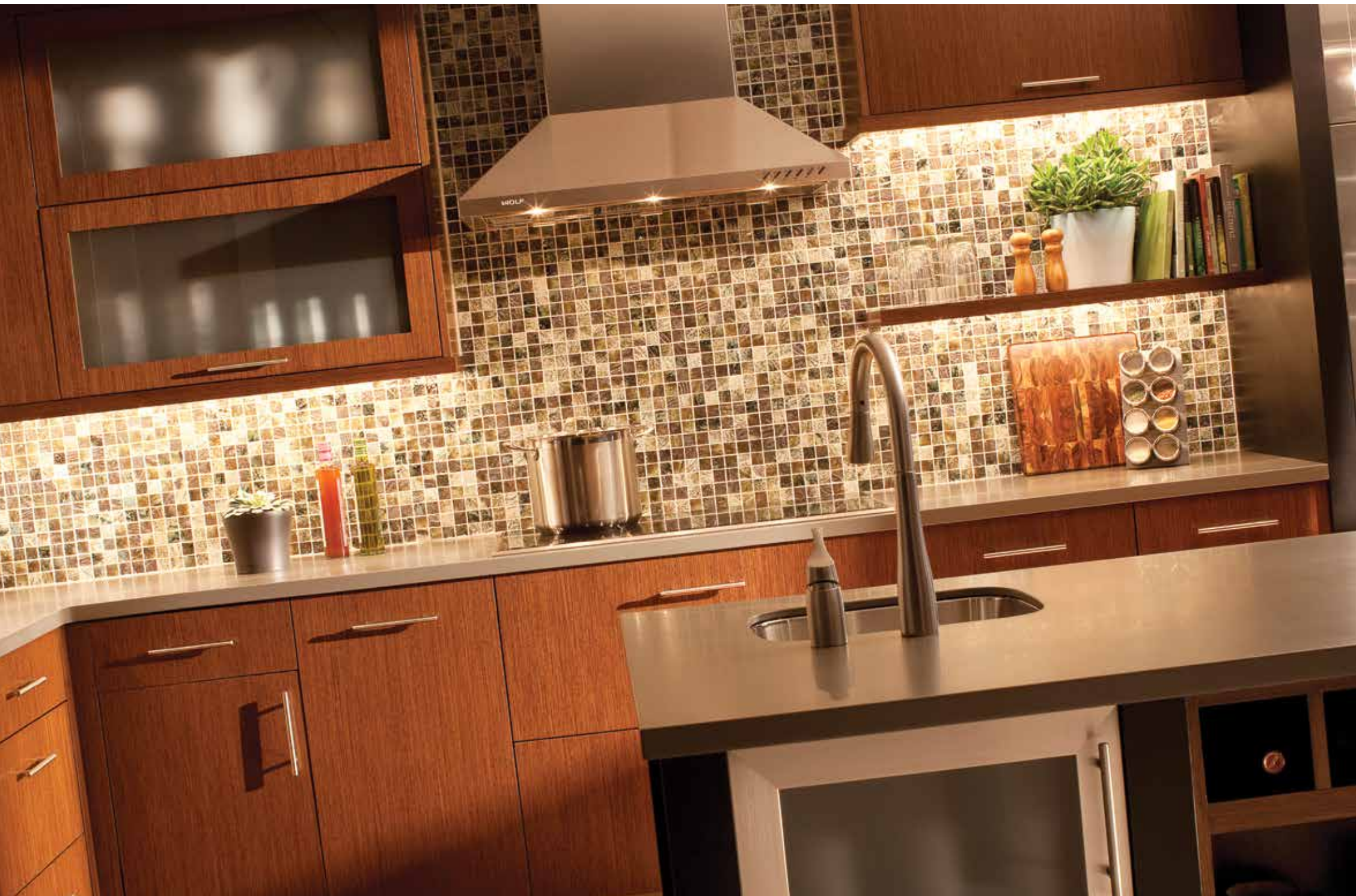
Bria Cabinetry shown with "Moda" door style in Quarter Sawn Red Oak with Mission finish. Aluminum Frame and Stainless Steel doors also shown.