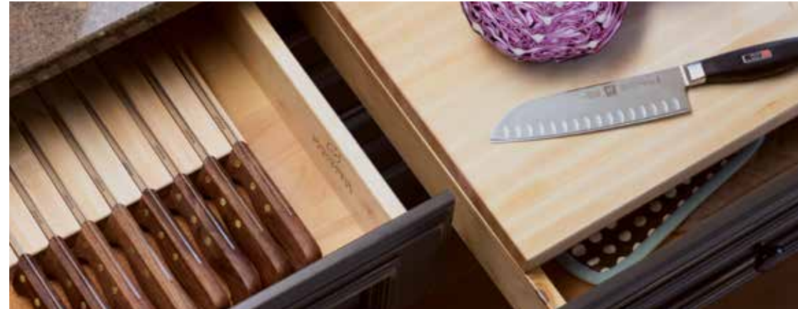
Drawer Knife Holder and Chop Block