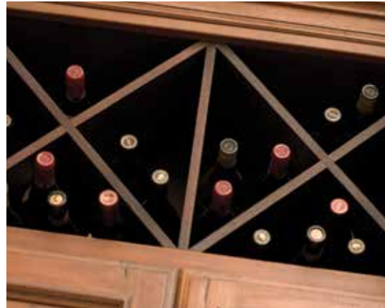
Divided Wine Rack