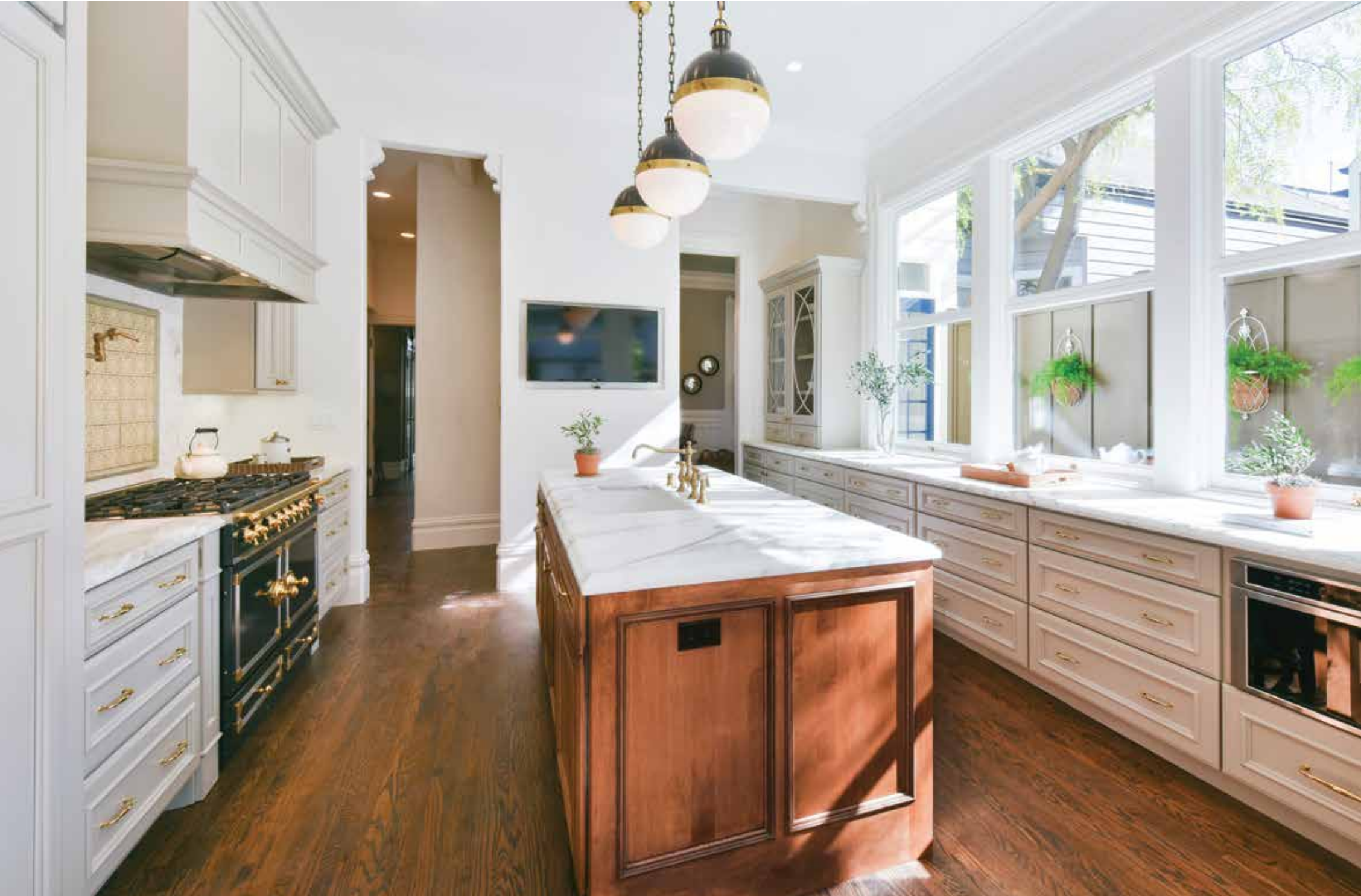
Crestwood Cabinetry shown in "St. Augustine" door style with Moonstone paint. Island cabinetry in Cherry Clove with Black Accent glaze.