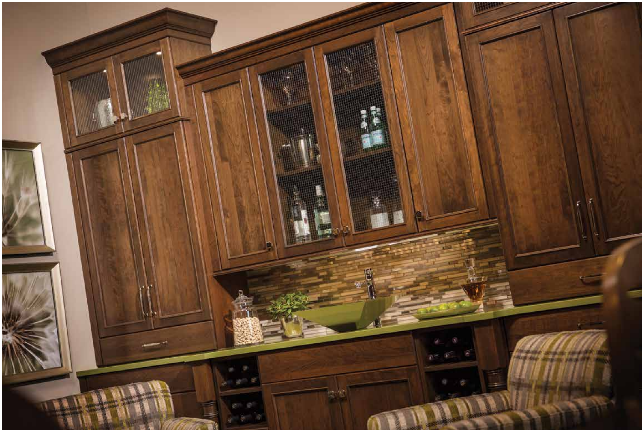
Bria Cabinetry shown with "Chapel Hill Panel" door style in Cherry with Praline finish.