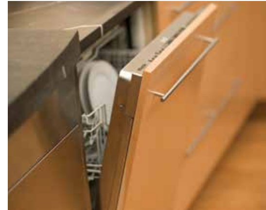
Integrated Dishwasher Panel