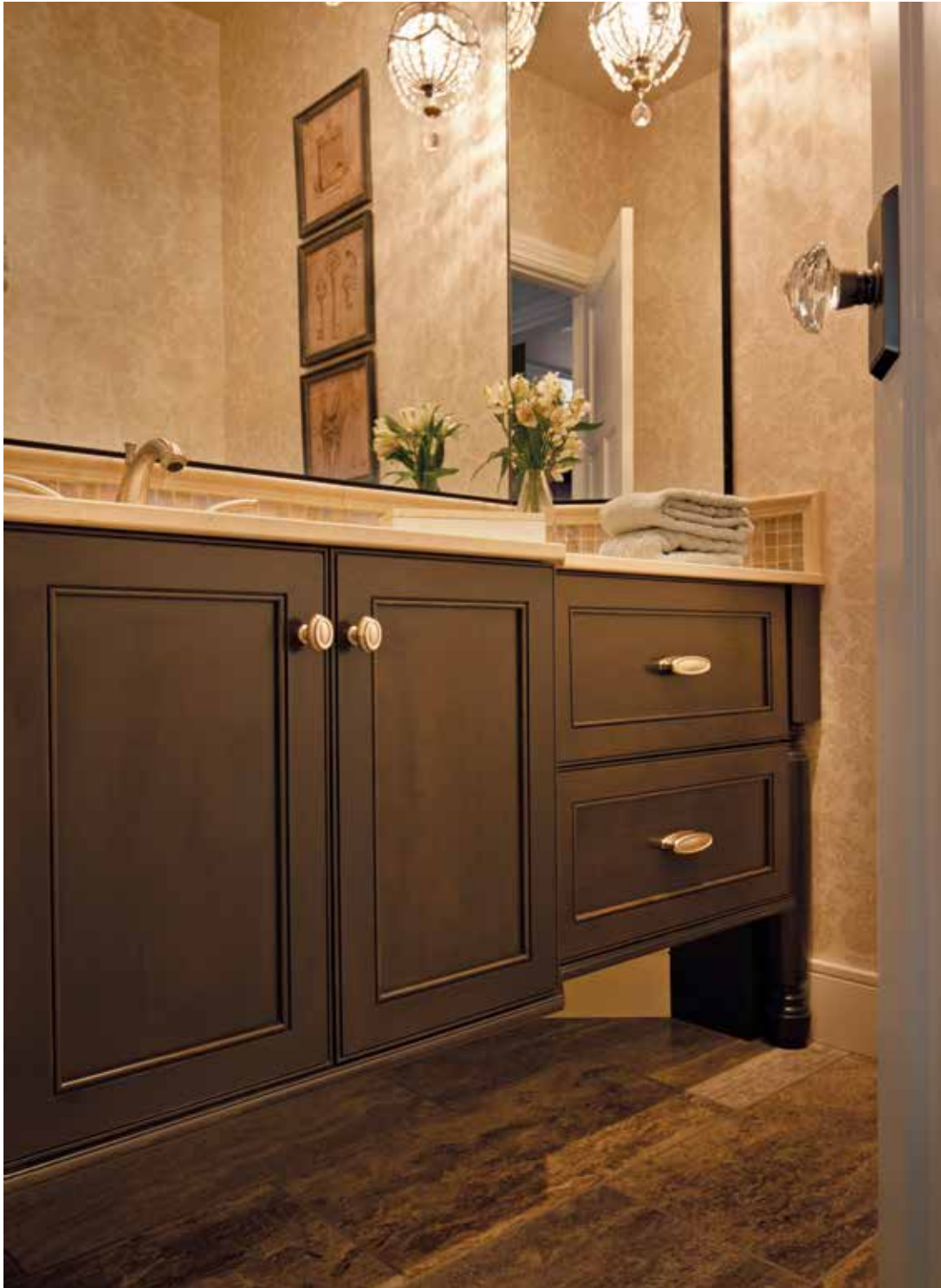
Shown with "Madison" door style in Cherry with Peppercorn finish.