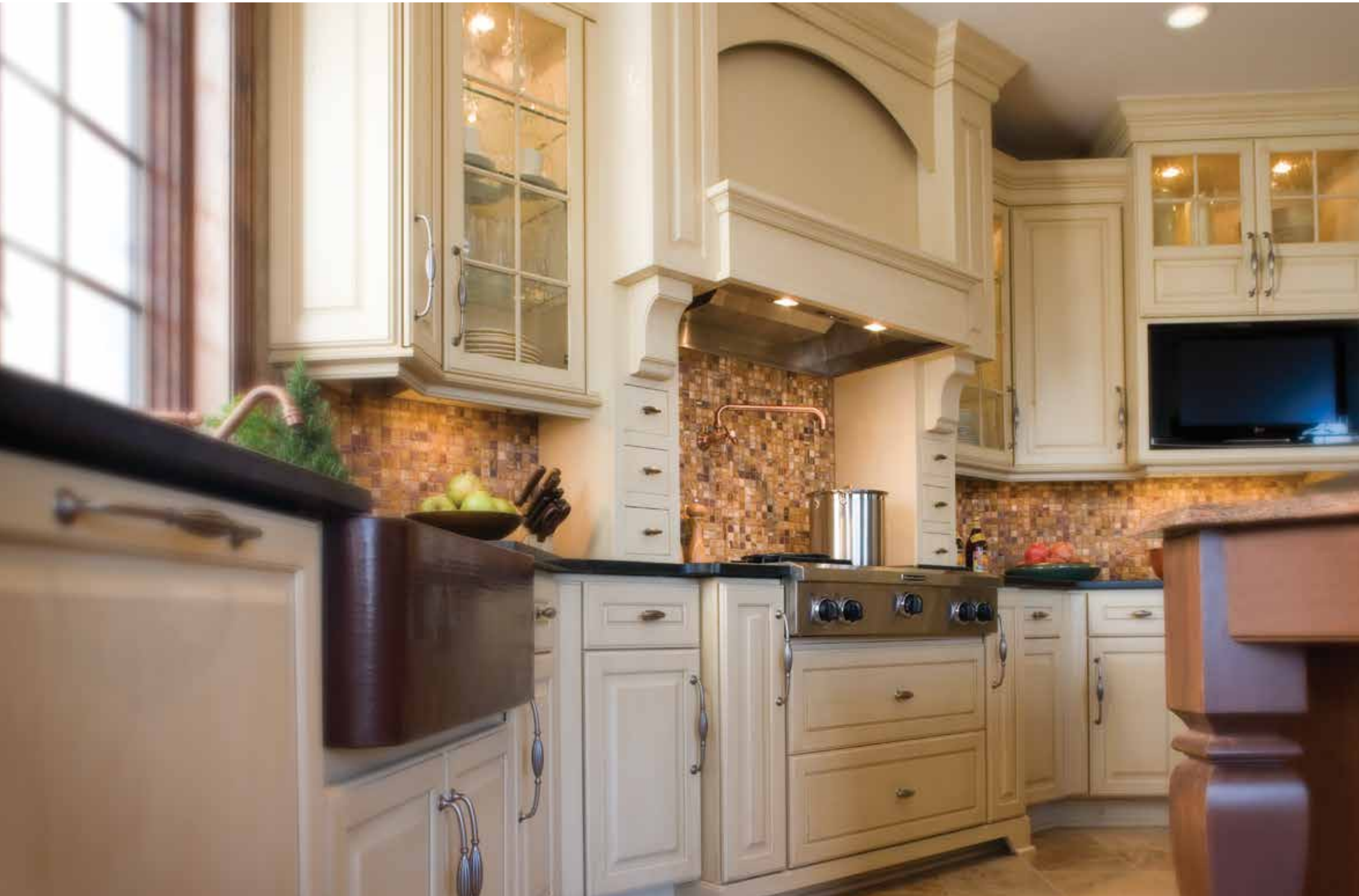
Crestwood Cabinetry shown in "Arcadia Classic" door style with Antique White/Espresso Glaze painted finish.