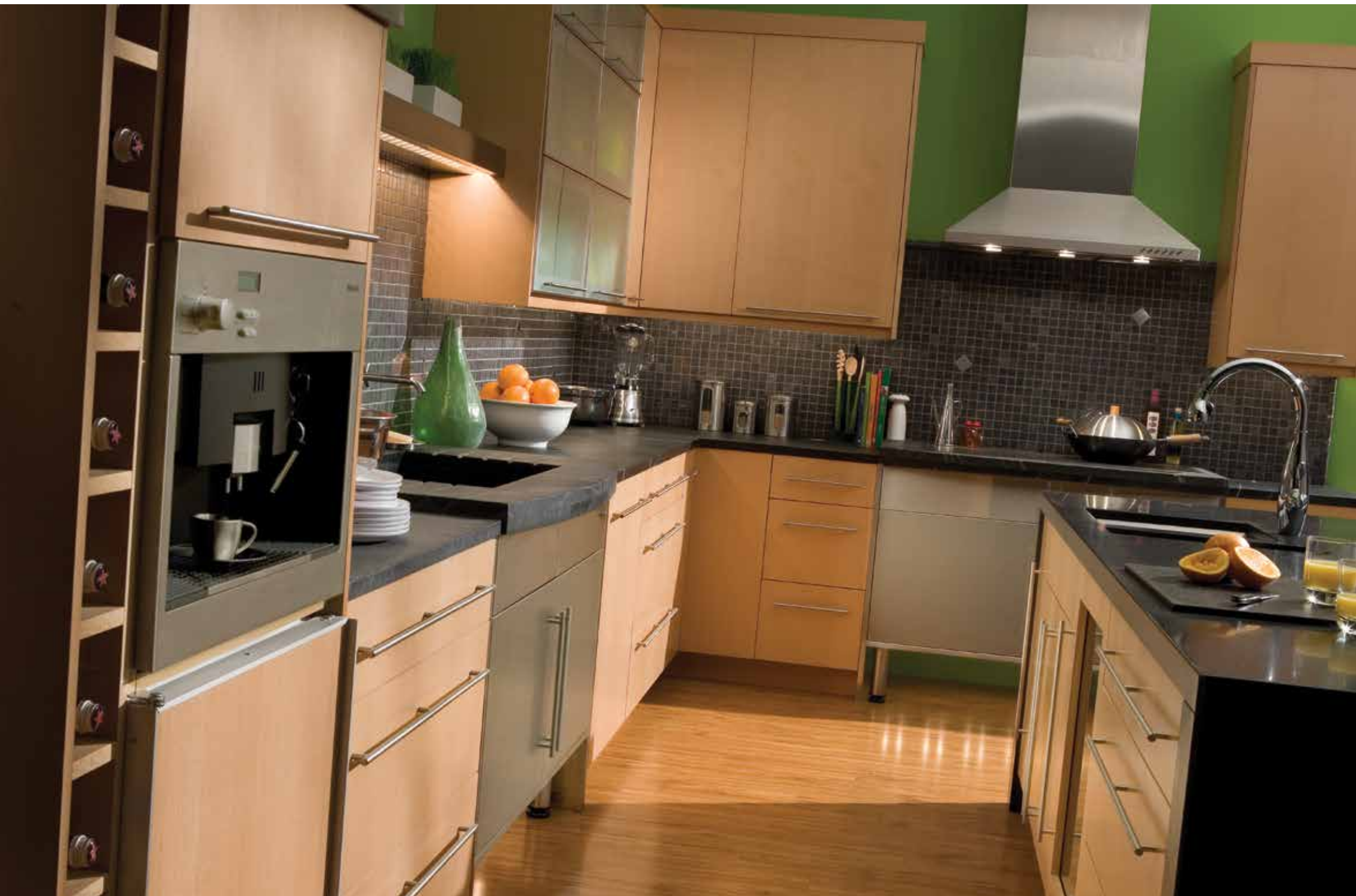
Bria Cabinetry shown with "Moda" door style in Maple with a Butternut finish. Stainless Steel and Aluminum Framed doors are also shown.