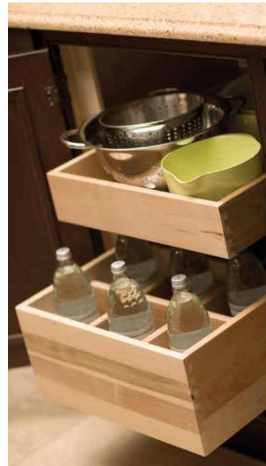
Deep Roll-Out Shelf & Bottle Rack