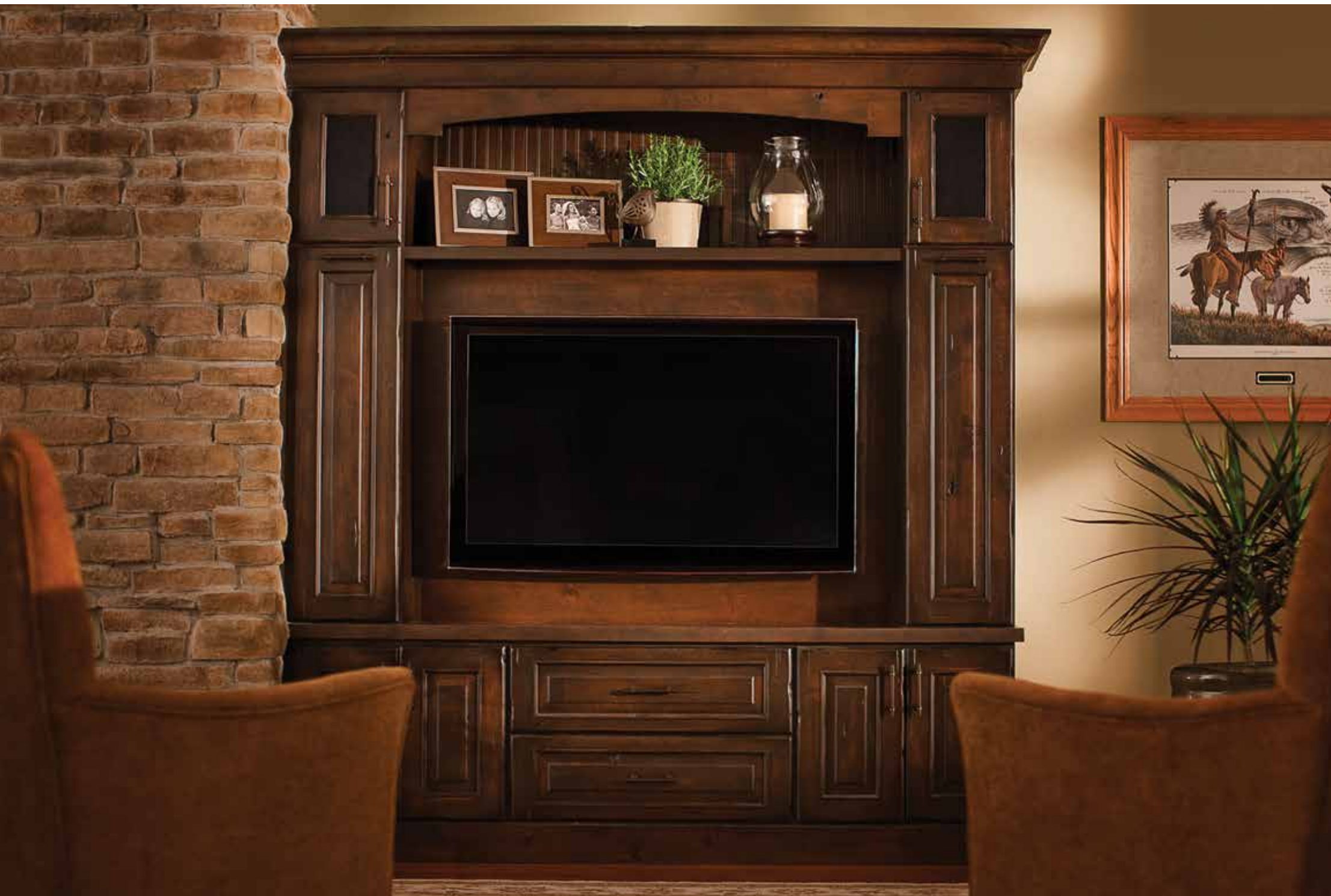
Entertainment cabinetry from Dura Supreme can be designed to integrate seamlessly with furniture and other cabinetry within the home. Shown with "Montego" door style, in Knotty Alder with Heavy Patina "D" finish.