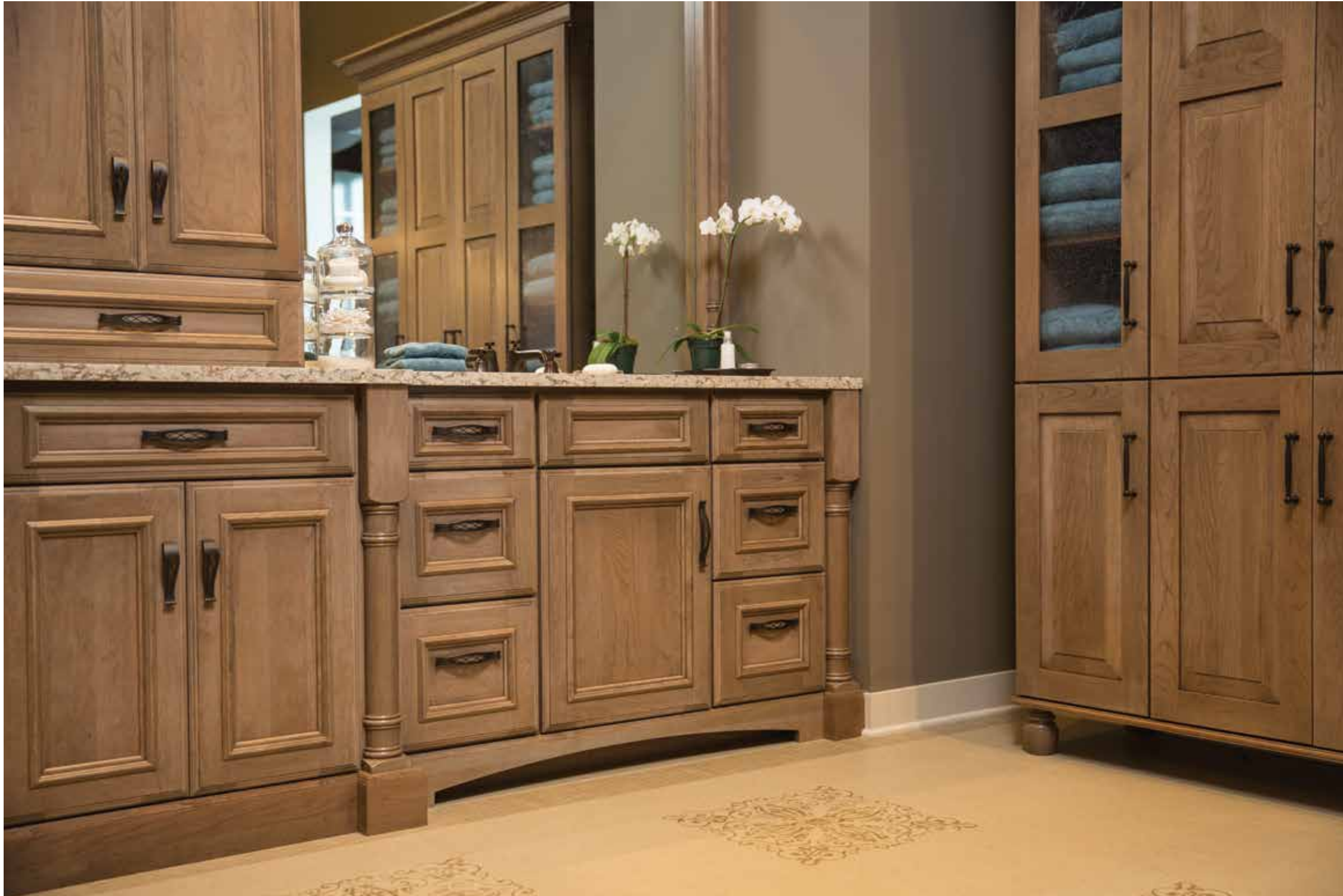
Crestwood Cabinetry shown with "St. Augustine" door style in Cherry with Cashew finish. Linen cabinetry shown with "Lancaster" door style.