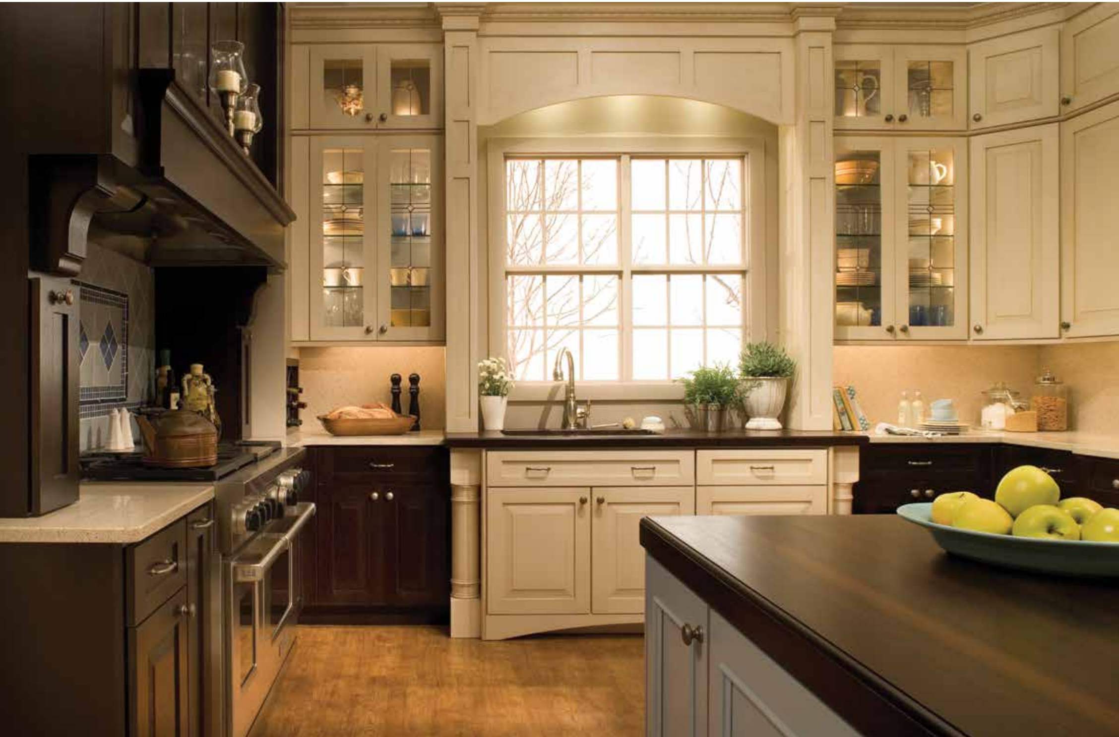
Crestwood Cabinetry shown with "Lancaster" door style with Antique White/Espresso Glaze finish and Quarter-Sawn Oak with Cocoa Brown finish. Island has "Chapel Hill Panel" door style with custom blue paint.