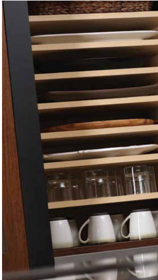
Wall Counter Cabinet with extra shelves