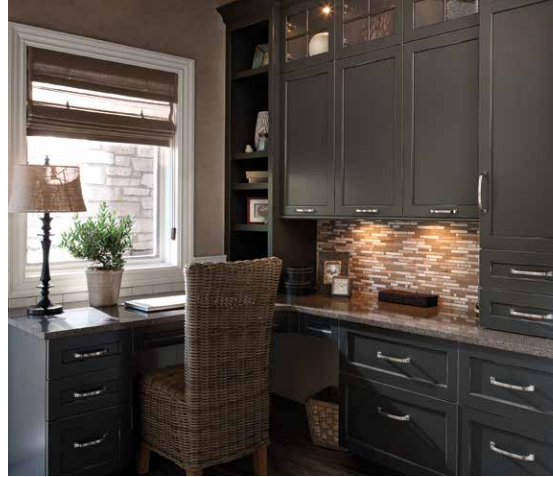
Bria Cabinetry shown in "Arcadia Panel" door style with Graphite paint finish.

WHY CONFINE CABINETS TO THE KITCHEN? Dura Supreme cabinetry is an intelligent choice for built-in and freestanding furniture pieces throughout your home. As open floor plans gain popularity and kitchen space merges seamlessly with living spaces, it's only natural to extend cabinetry into other areas of the home to create architectural and design consistency. Dura Supreme cabinetry offers an amazing array of door styles, finishes and decorative elements along with superior construction, joinery, quality and custom sizing. Your Dura Supreme dealer can introduce you to a host of intriguing design venues and furniture applications for your entire home.