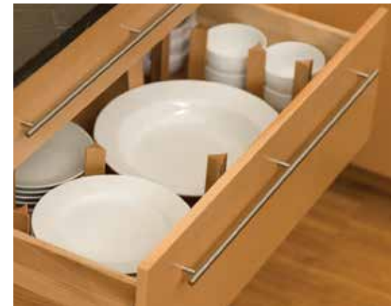
Dish Storage Drawer