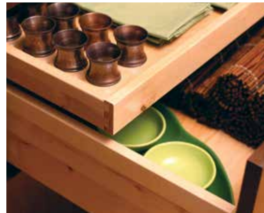
Shallow Roll-Out Above Drawer