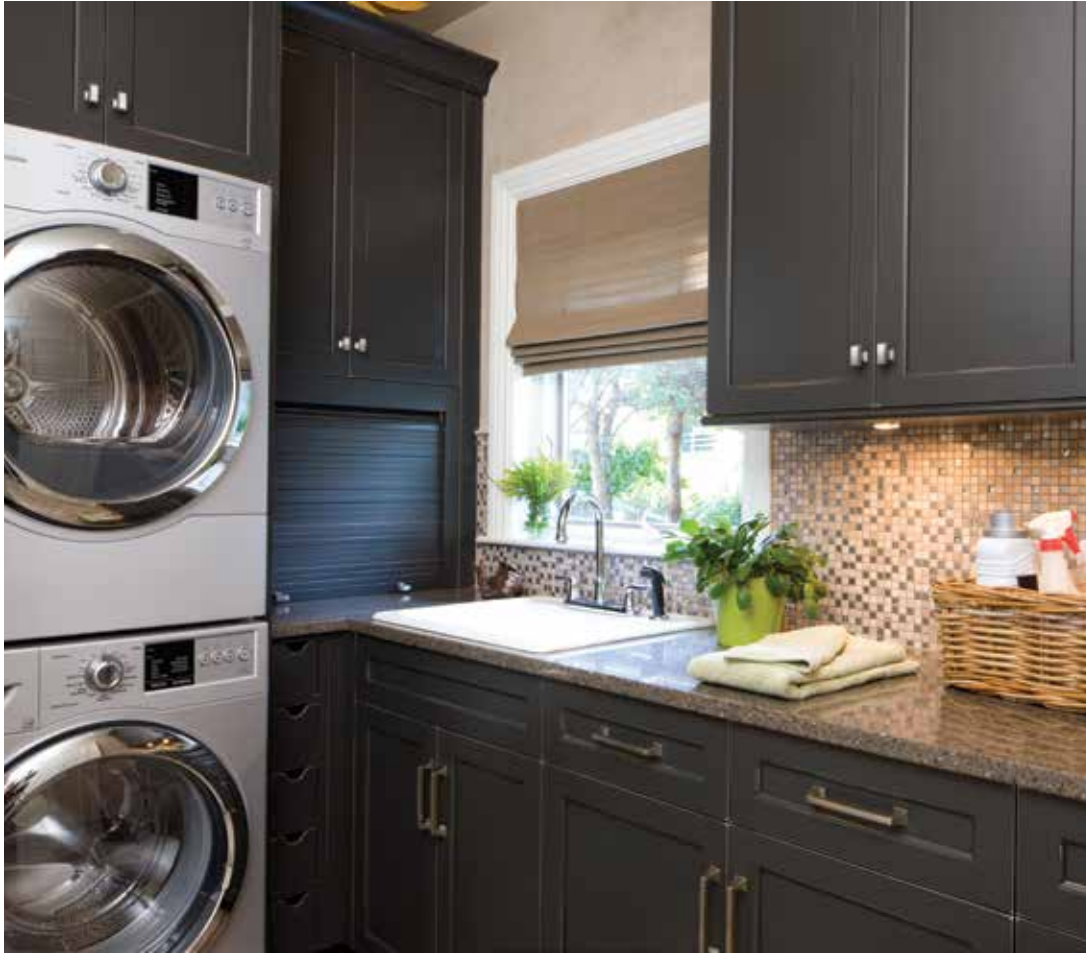
Bria Cabinetry shown in "Arcadia Panel" door style with Graphite paint finish.