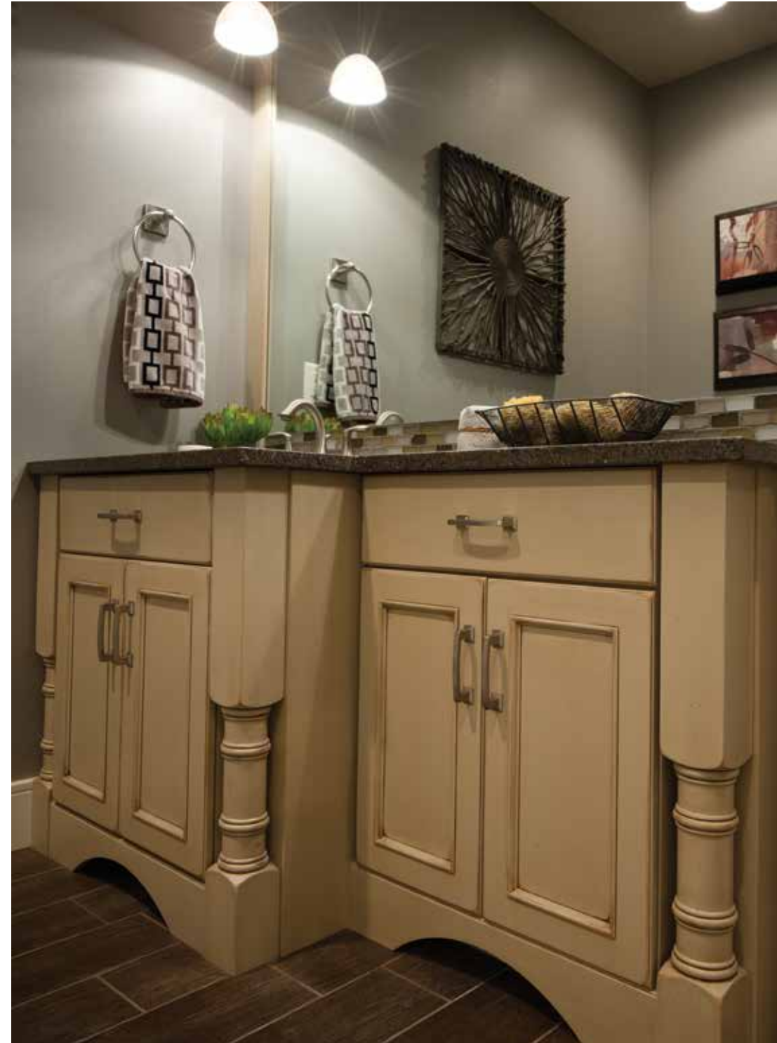
Shown with "Chapel Hill Panel" door style in Maple with Cashmere/Espresso Glaze and Rub-Thru.