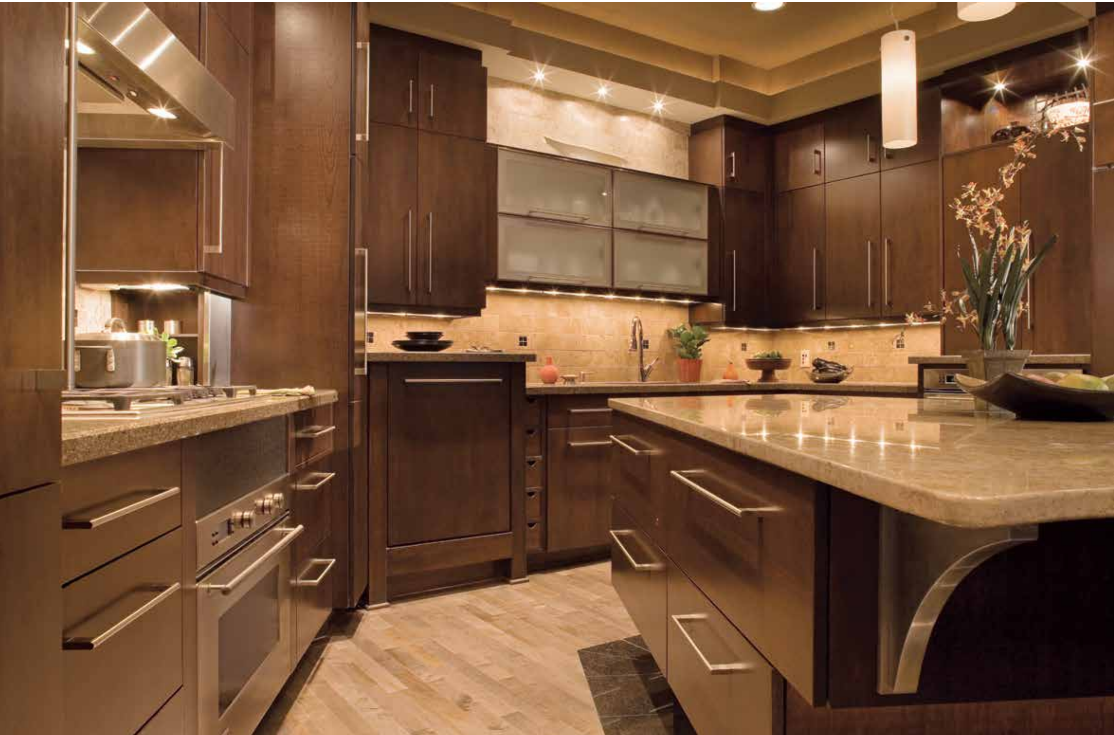
Bria Cabinetry shown with "Camden" door style in Cherry with Mocha finish and Aluminum Frame doors.