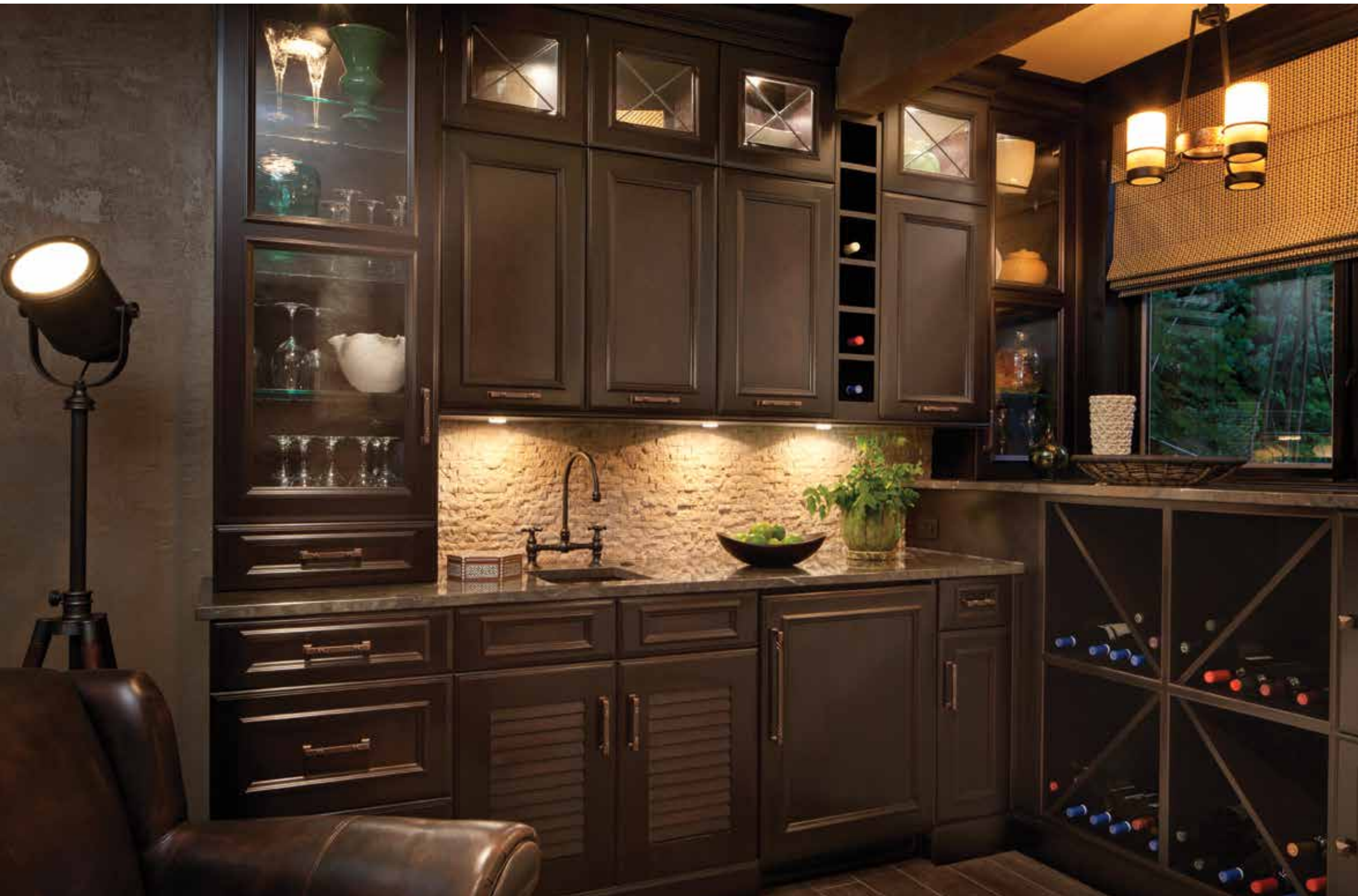
Bria Cabinetry shown with "St. Augustine" door style in Cherry with Cocoa Brown finish. Also shown with Louvered Doors.