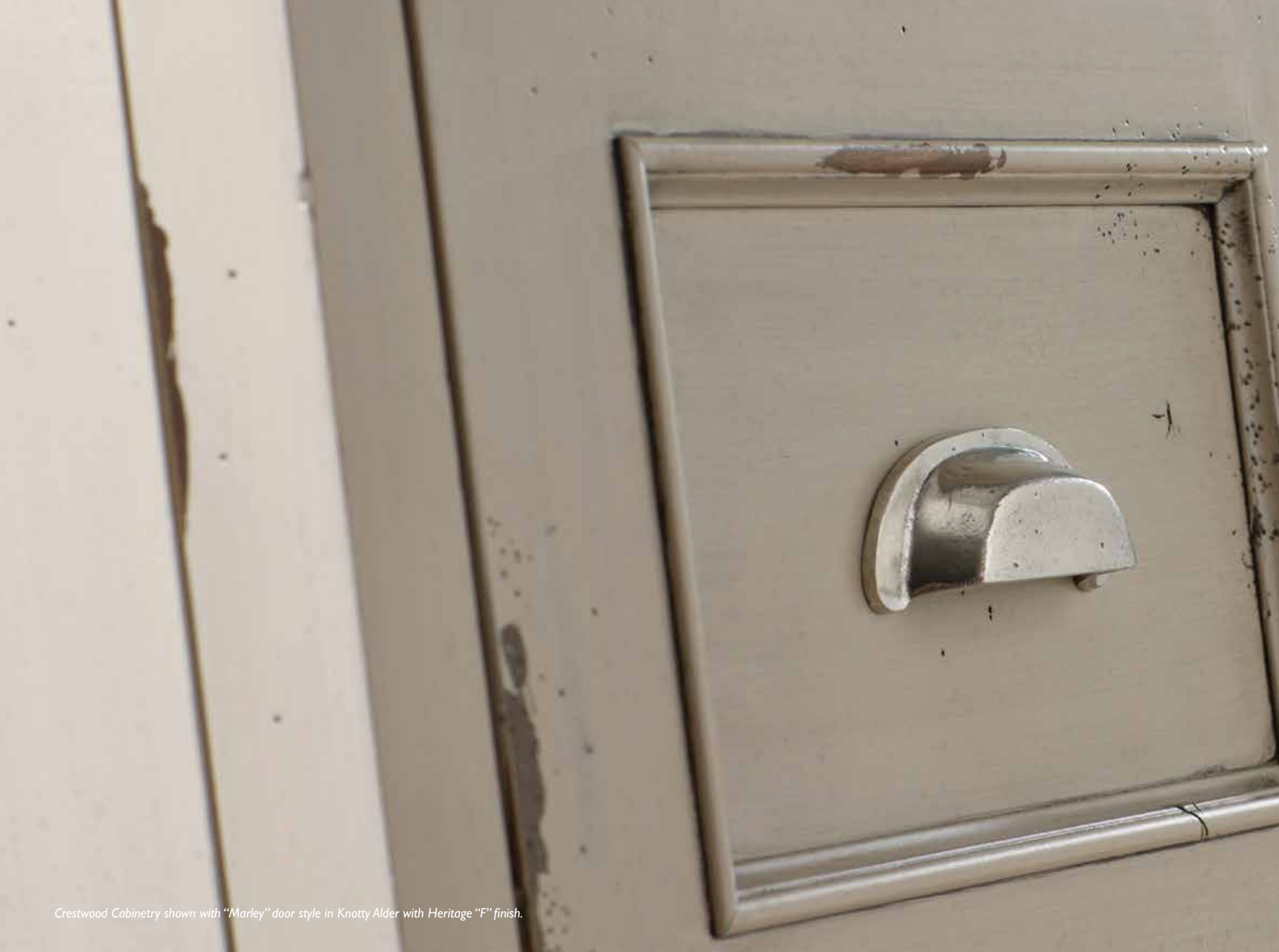
Crestwood Cabinetry shown with "Marley" door style in Knotty Alder with Heritage "F" finish.