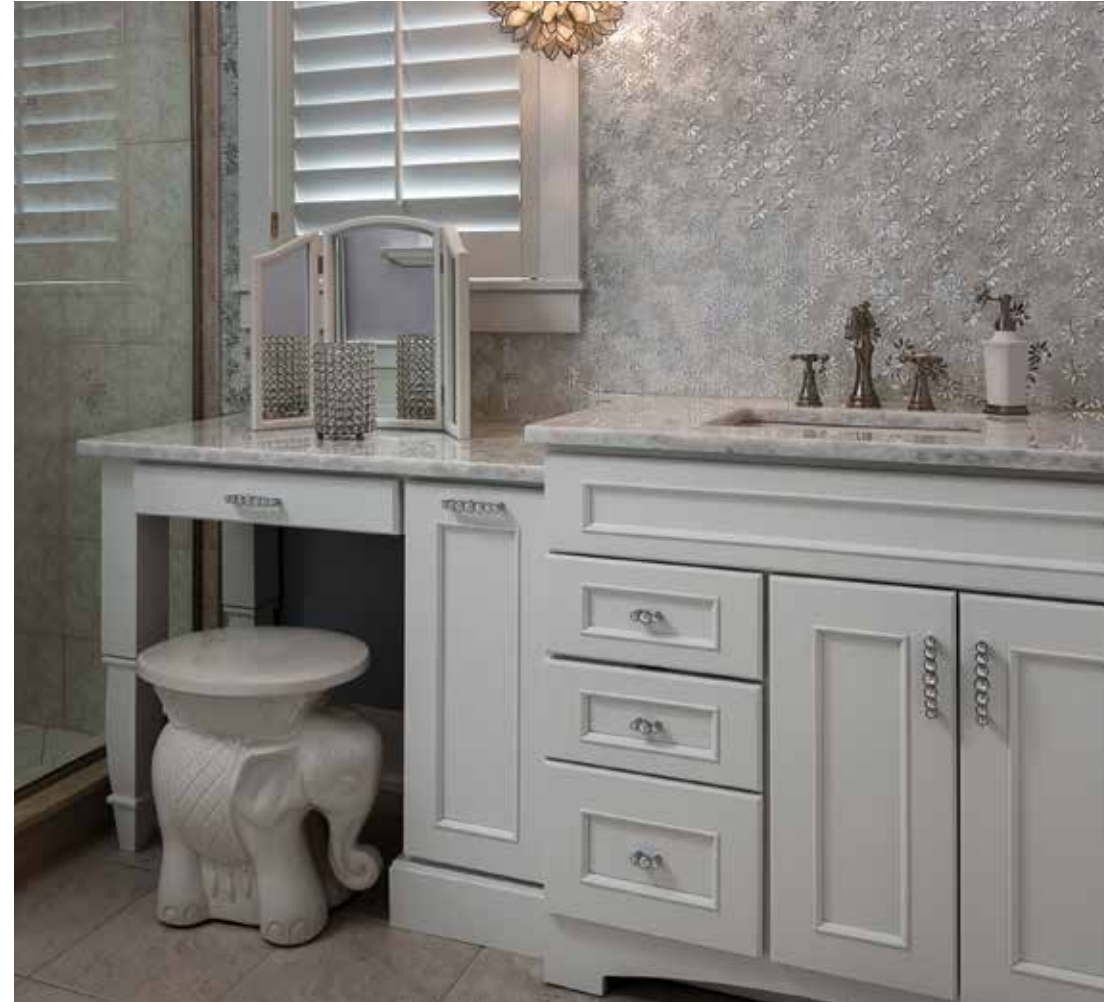
Crestwood Cabinetry shown in "Silverton" door style with Pearl paint finish.

THE BATH HAS EVOLVED from its purist utilitarian roots to a more intimate and reflective sanctuary in which to relax and reconnect. A refreshing spa-like environment offers a brisk welcome at the dawning of a new day or a soothing interlude as your day concludes. Bath cabinetry from Dura Supreme offers myriad design directions to create the personal harmony and beauty that are the hallmark of the bath sanctuary. Immerse yourself in our expansive palette of finishes and wood species to discover the look that calms your senses and soothes your soul.