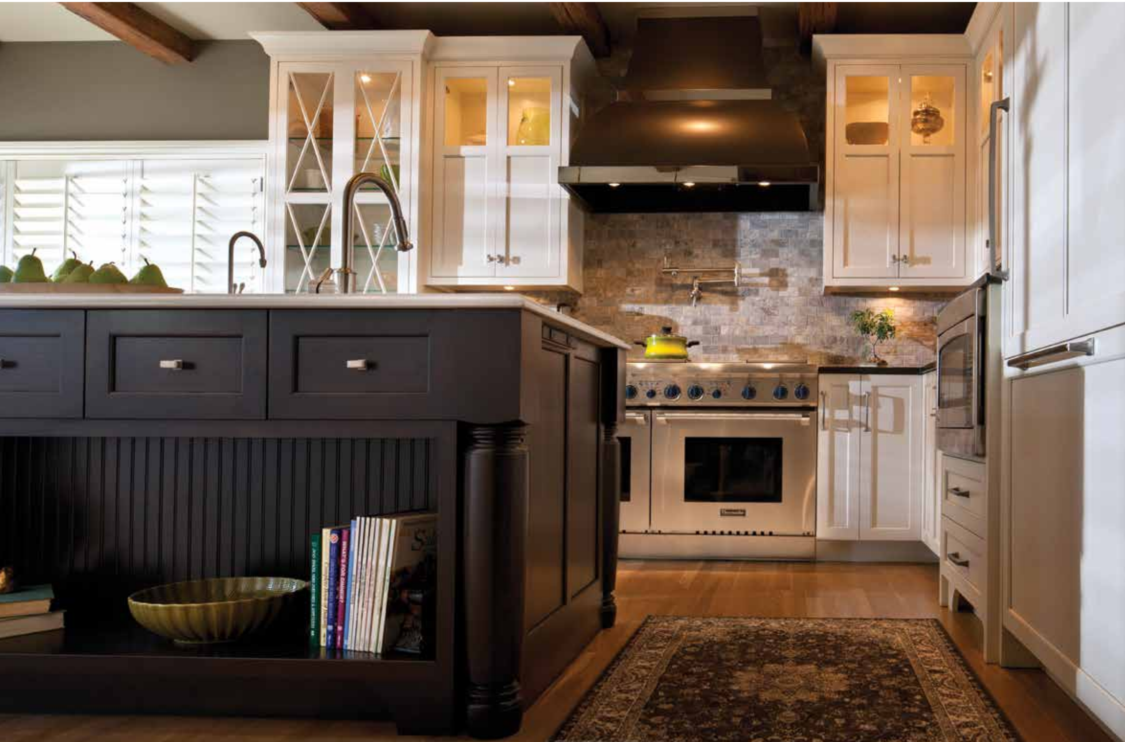
Bria Cabinetry shown with "Arcadia Panel" door style in Classic White/Pewter Accent paint finish. Island cabinetry shown in Cherry with Peppercorn finish.