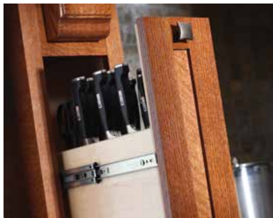
Pull-Out Knife Block

YOU'LL APPRECIATE THEIR HARD WORK! The accessories you select for your Dura Supreme kitchen are as important to the cabinet interior as the door, wood and finish are to the exterior. These hardworking, organizational tools transform your kitchen into an efficient workroom with their ingenious compartments and pull-out mechanisms. Optimize, maximize and organize every valuable inch of your storage space and then sit back, relax and enjoy your hardworking kitchen.