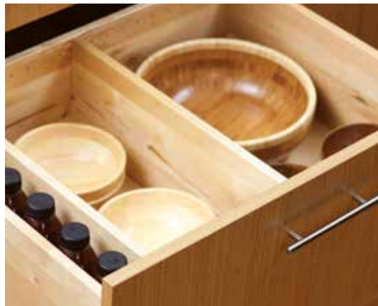
Adjustable Drawer Partitions