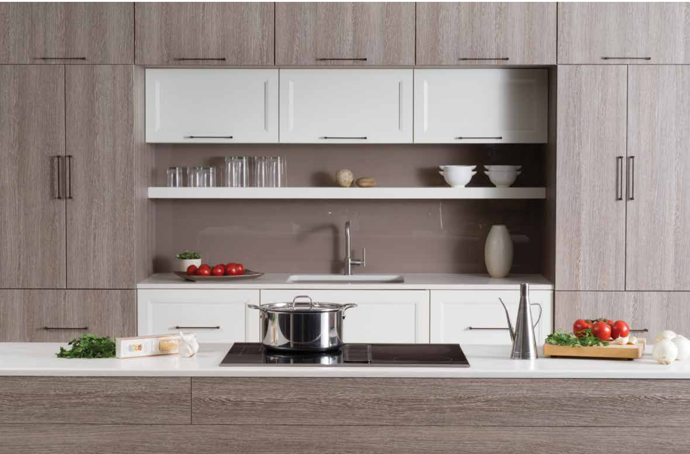
Bria Cabinetry shown with “Urbana” door style in Nutshell (Textured Foil) and “Lauren” door style in Classic White Paint.