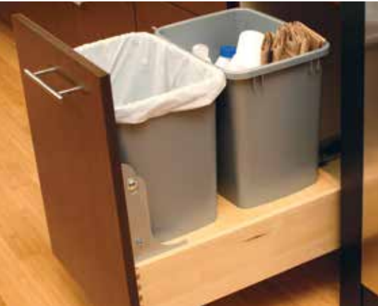
Base Recycling Center Full Door