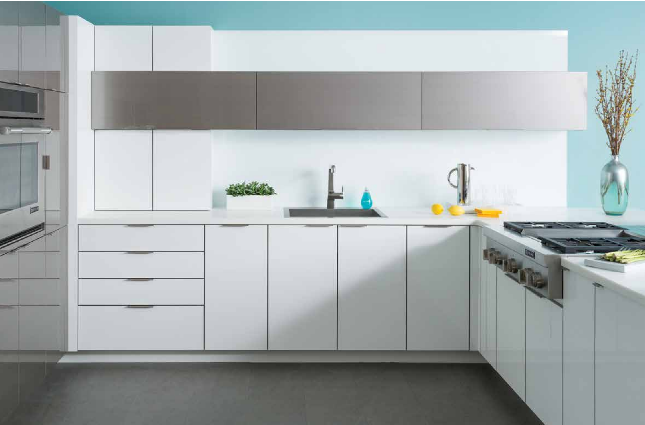
Bria Cabinetry shown with "Ava-2T" door style in White Acrylic and "Talia-Horizontal" door style in Wired Mercury.