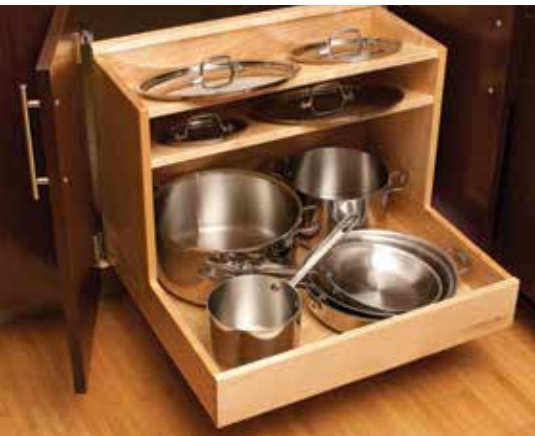
Base Pot and Pan Roll-Out