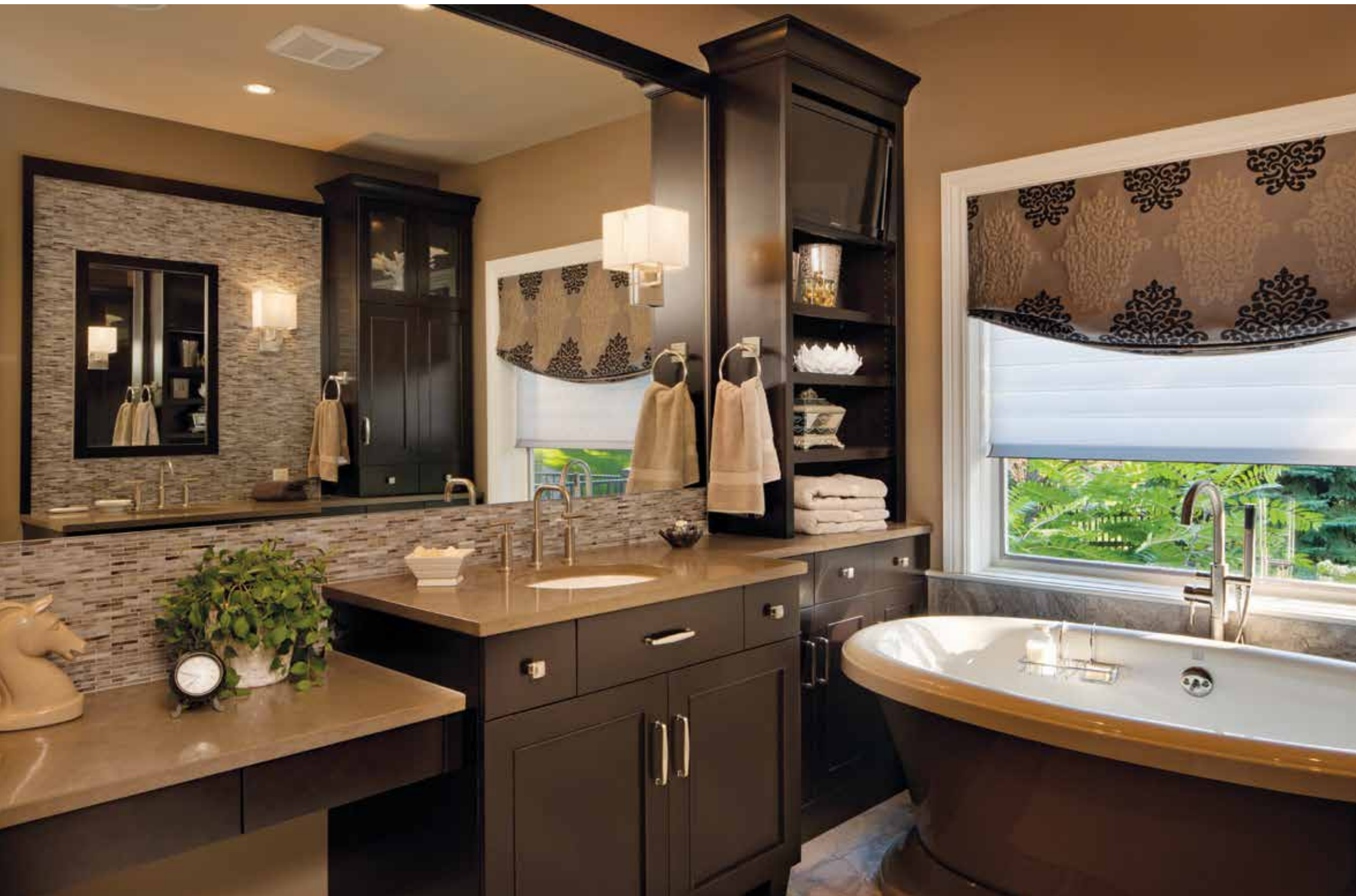
Bath cabinetry shown with "Silverton" door style in Cherry with Cocoa Brown finish.