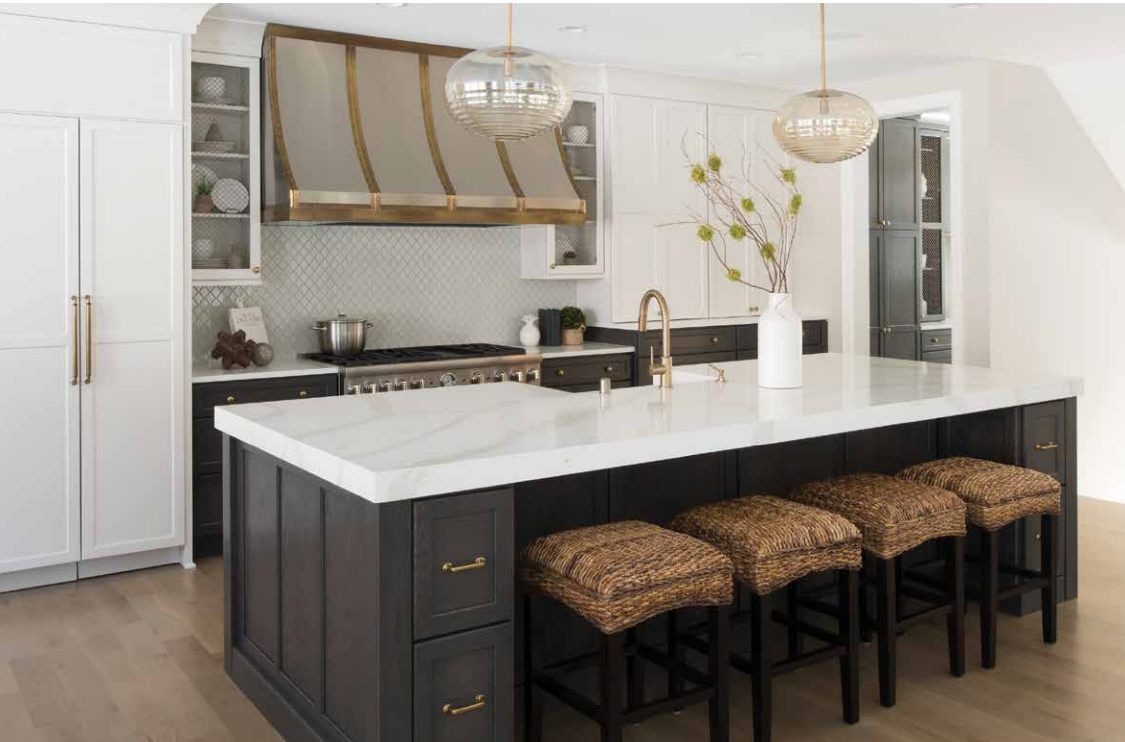
"Kendall Panel" door style featured in Linen White paint and Smoke stain on Oak.