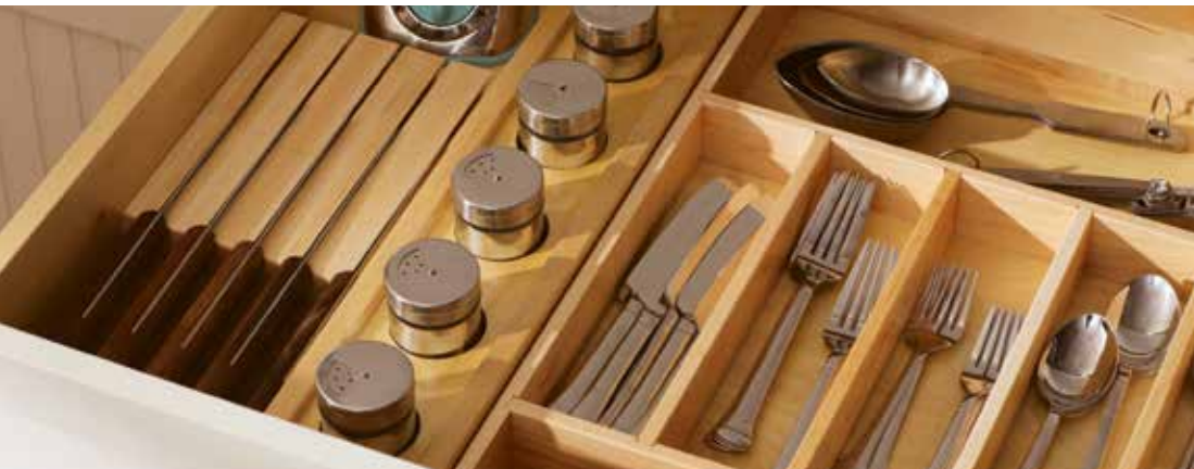
Deluxe Drawer Organizer