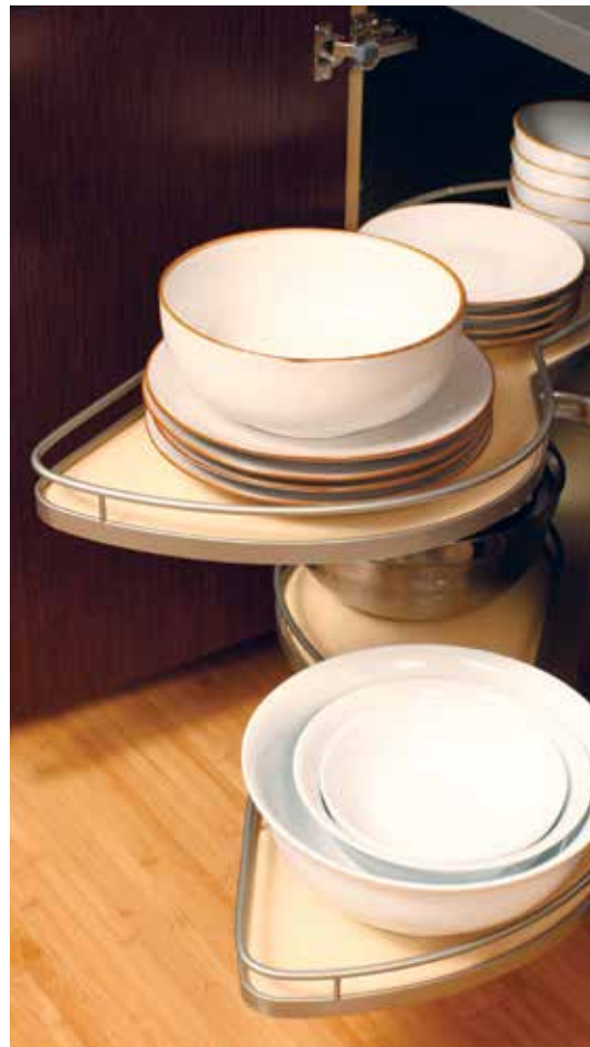
Blind Corner Swing-Out