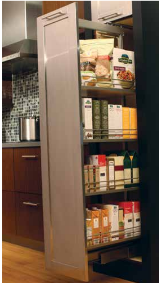
Tall Pull-Out Pantry