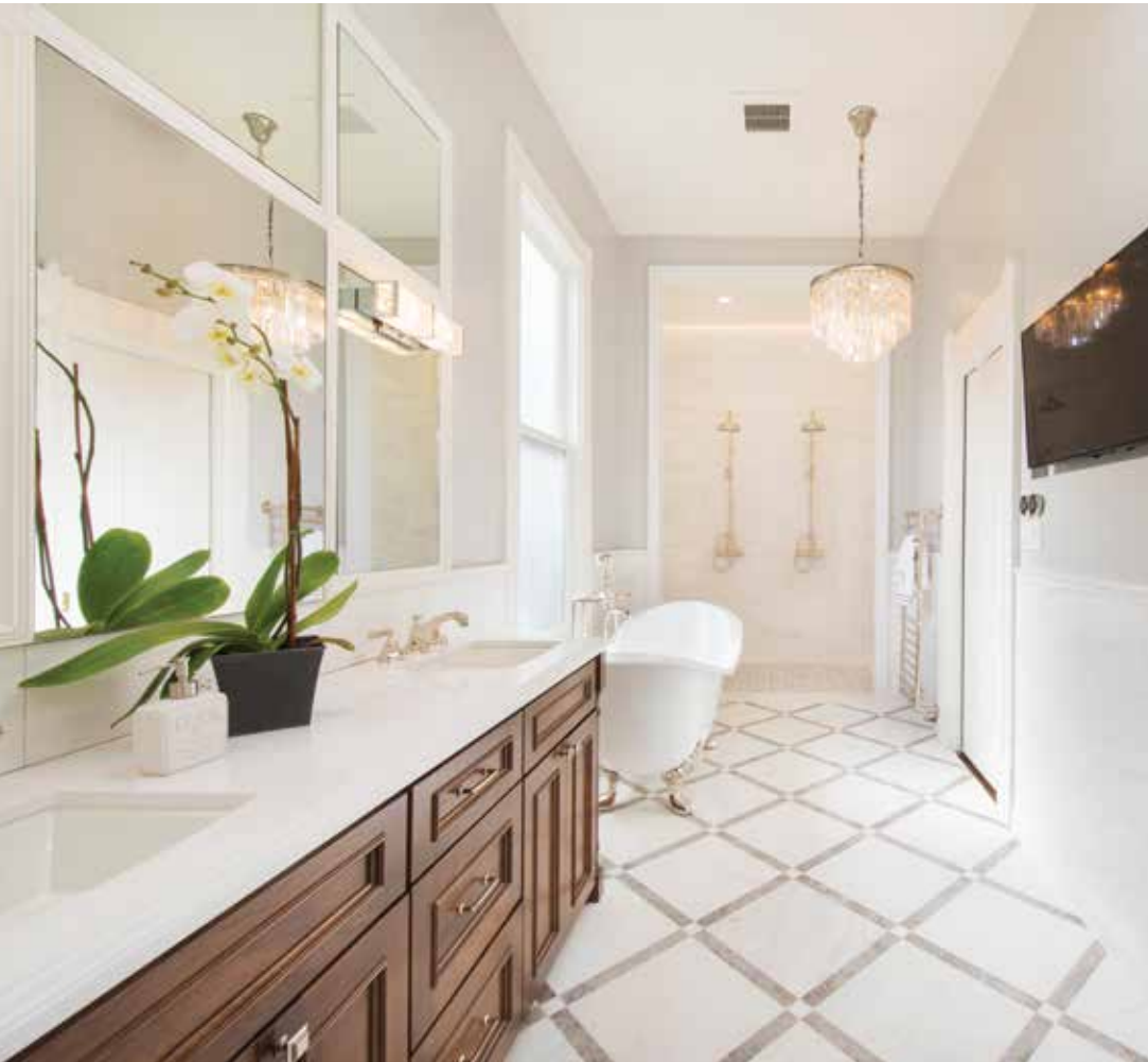
Crestwood Cabinetry shown in "Chapel Hill Panel" door style in Cherry with Mocha finish.