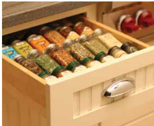
Drawer Spice Rack