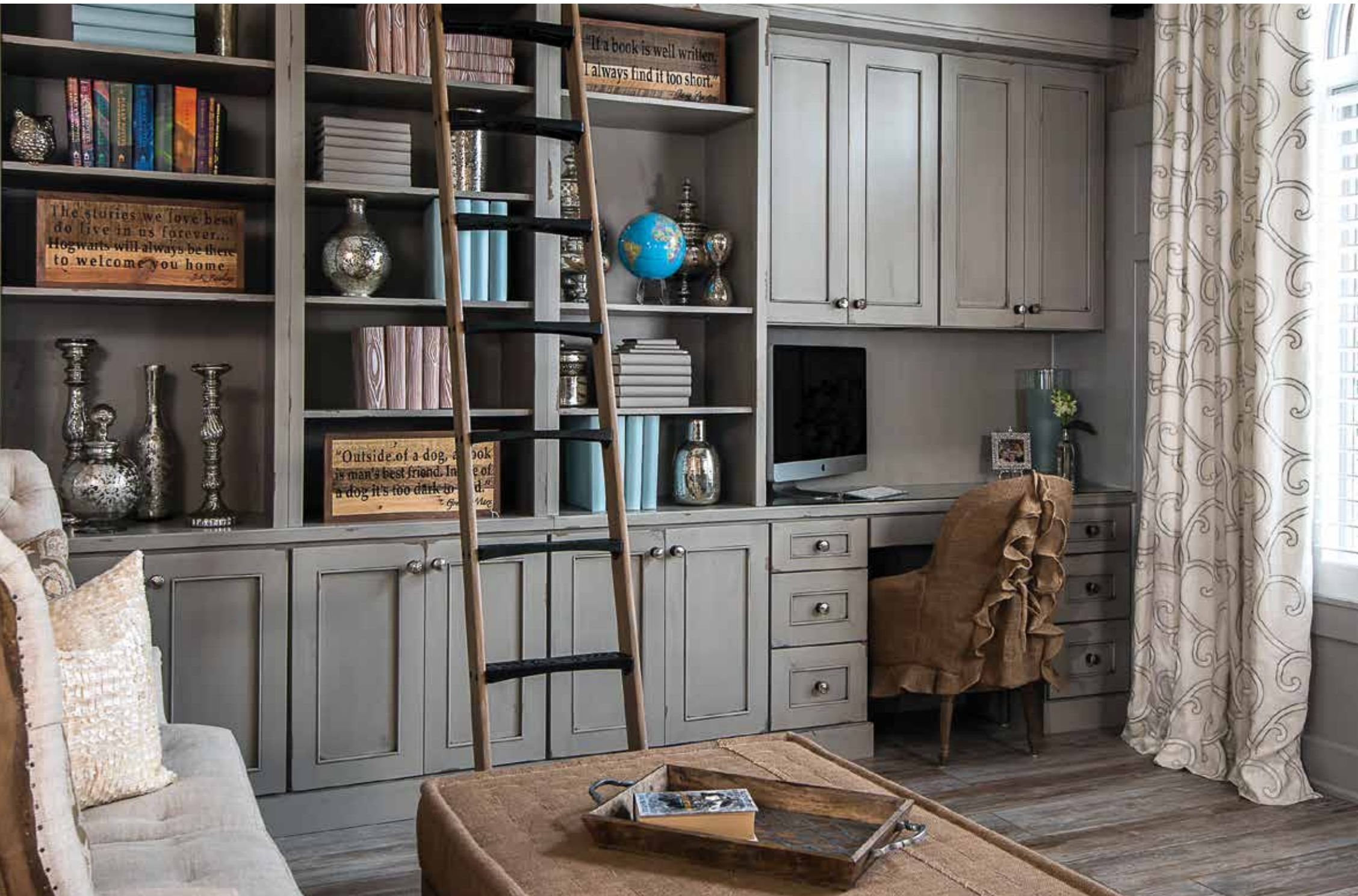
Library is Crestwood Cabinetry shown in "Silverton" door style in Maple with Heritage "H" paint finish.