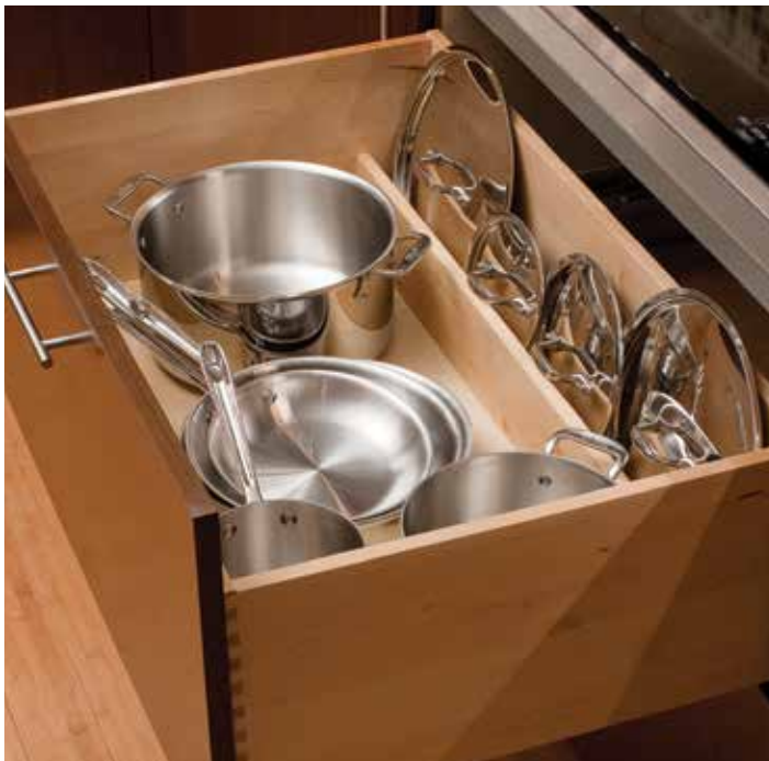
A lid partition at the back of a wide, deep drawer neatly stores pot and pan lids for easy access (LSP-B).