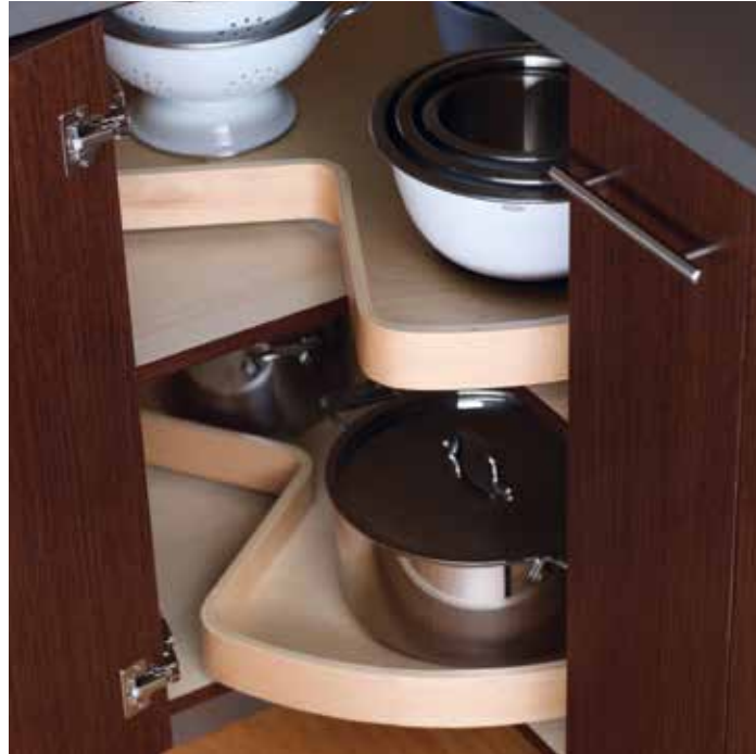
Our giant turntable shelves swivel inside the cabinet and utilize valuable storage space (GSSCB).