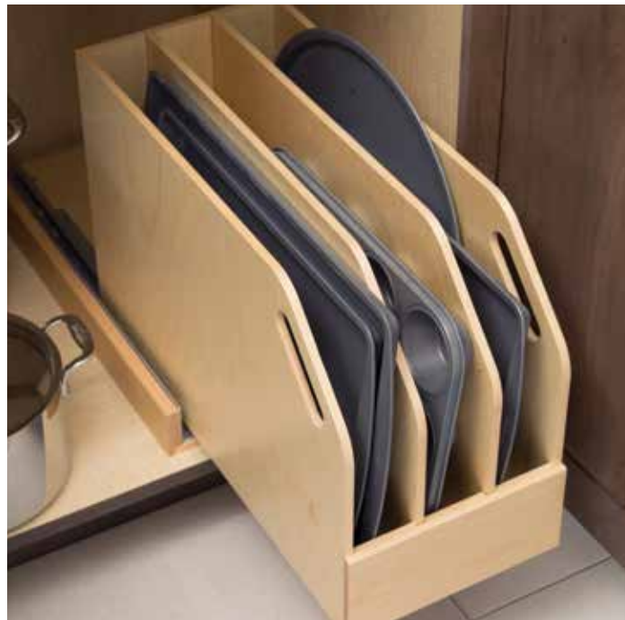
Cookie sheets and pizza pans occupy only a fraction of space when organized in this convenient Tray Divider Pull-Out (TDPO).