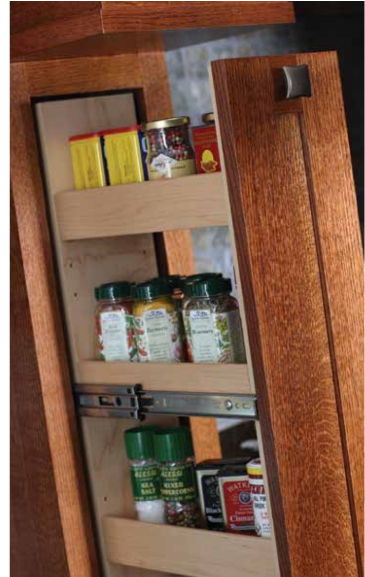
A pull-out spice rack next to the cooking surface is a popular accessory (PIL-G).