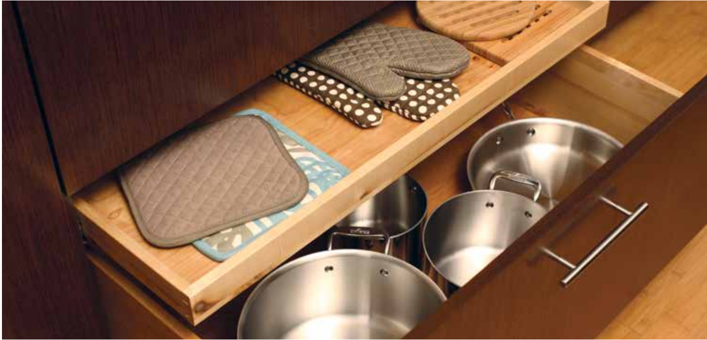
Conveniently store oven mitts and potholders in a shallow roll-out above a pot and pan drawer (ROSAD).