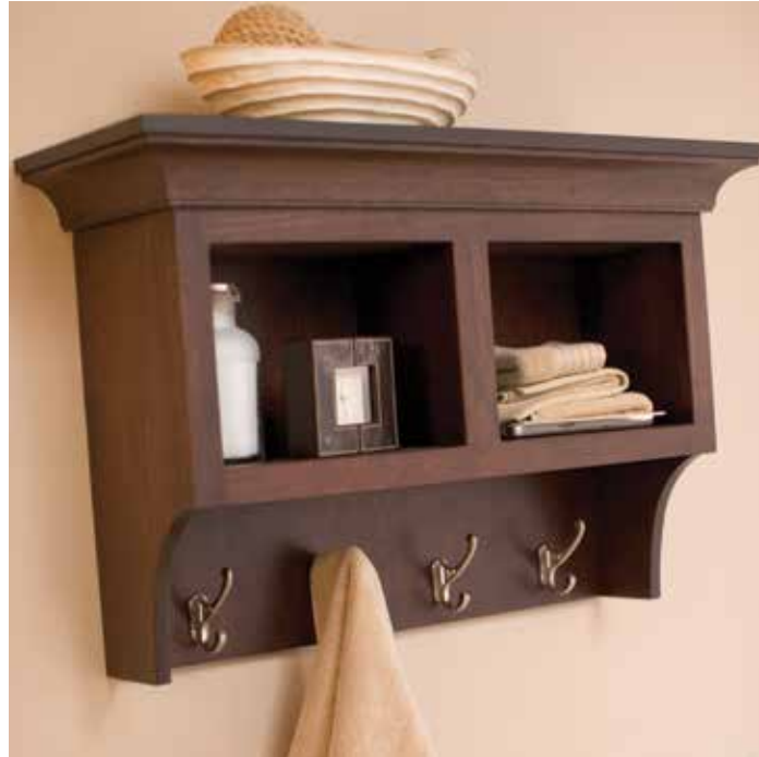
Our decorative organizer with hooks offers convenient storage for bathrooms and mudrooms alike (CRO).