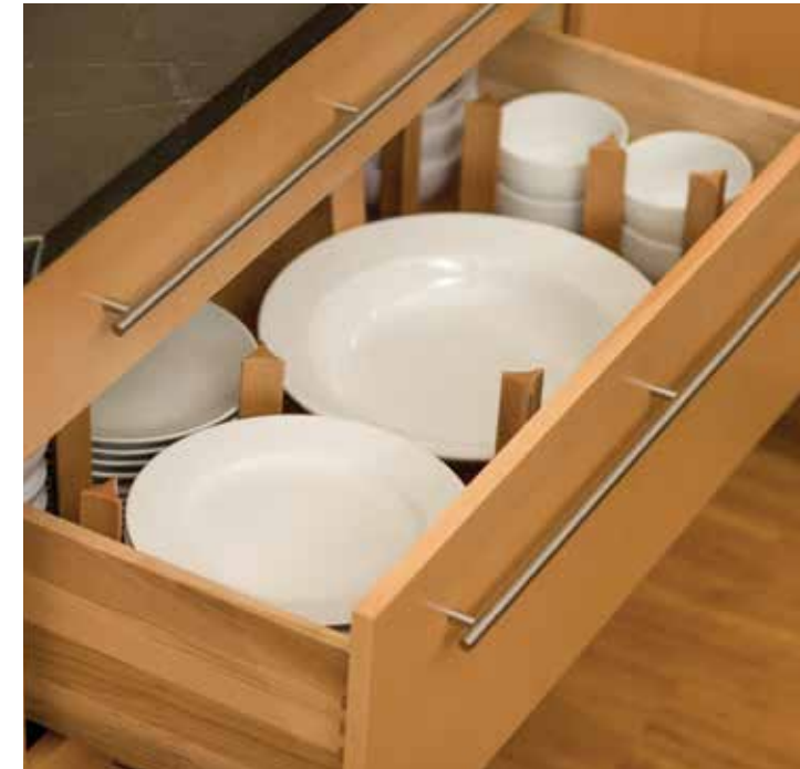
Dura Supreme's Dish Storage Drawer (DSD) offers a convenient location below the countertop for stacks of plates and bowls.