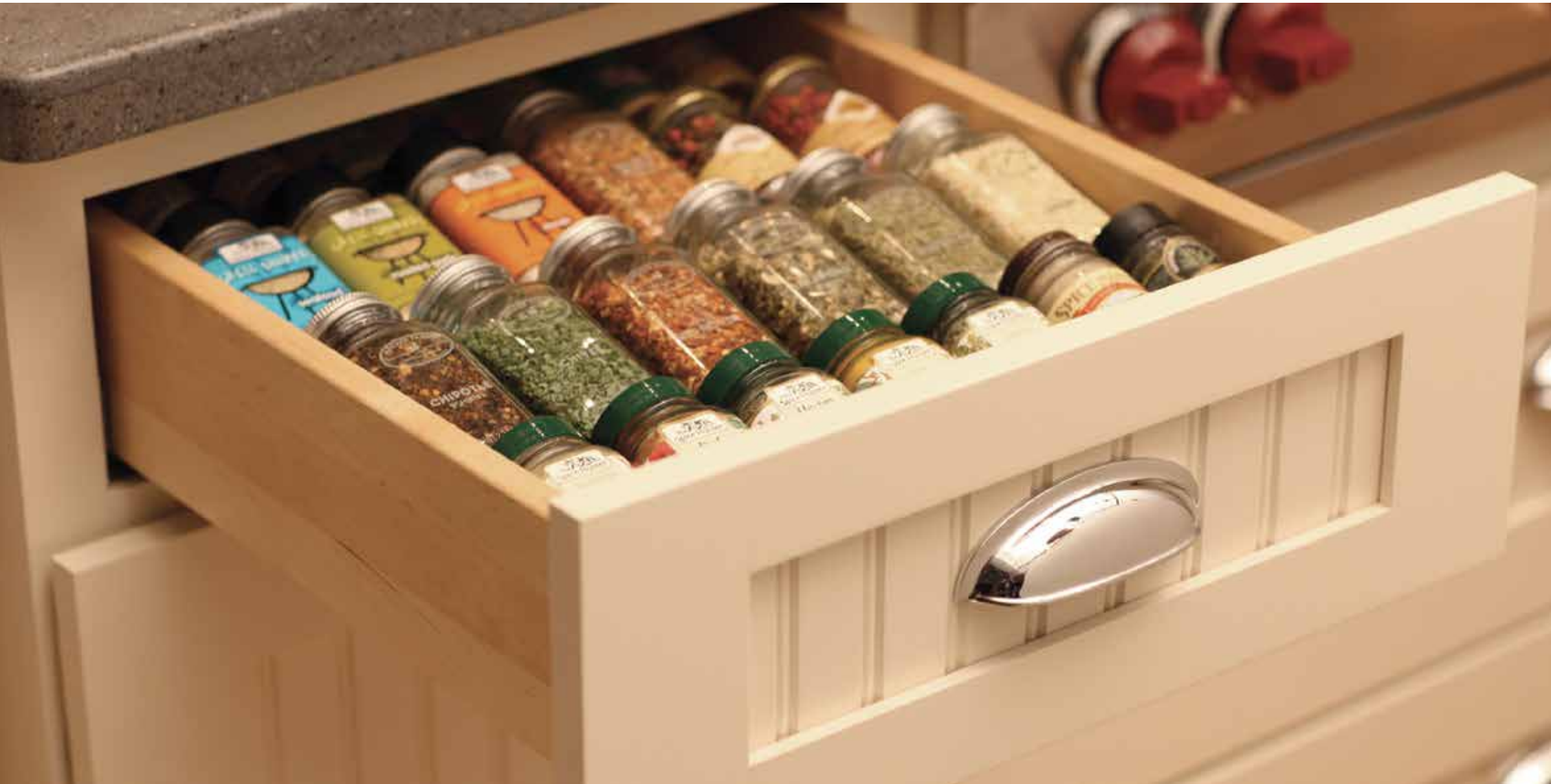
Keep your spices at your fingertips in this convenient, wood Drawer Spice Rack (DWSR) next to an oven or baking center.

A well-stocked collection of savory spices deserves an organized storage system that keeps labels in full view for easy identification. Dura Supreme offers an amazing array of storage accessories for your spices; flat storage within drawers, vertical racks that pull-out from thin spaces, door mounted racks, and specialized shallow cabinets. Choose the spice storage solution that works best for you and the way you use your kitchen.