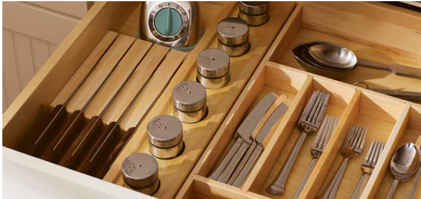
Wide drawers are ideal for our Deluxe Drawer Organizer (DDOA) which includes a cutlery divider, slotted knife holder and 6 stainless steel spice jars.