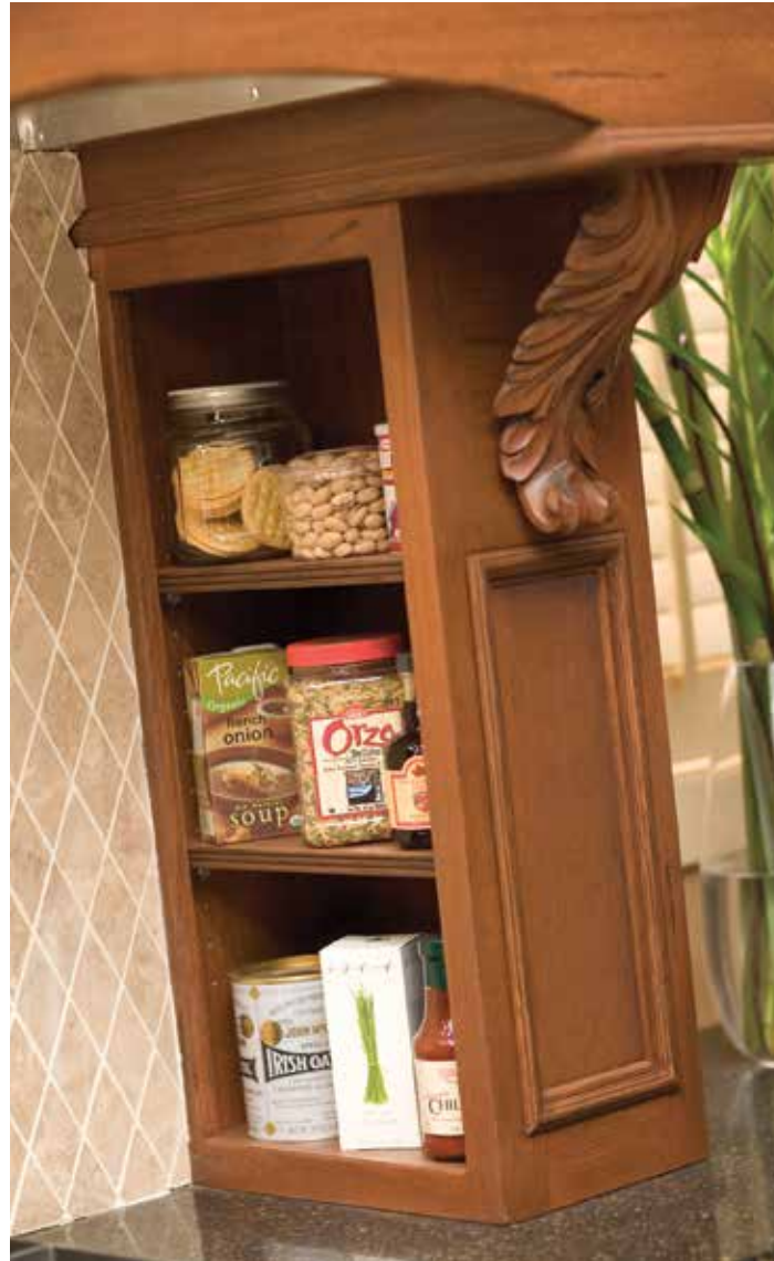
Open spice storage offers a decorative option below the hood (PIL-D).