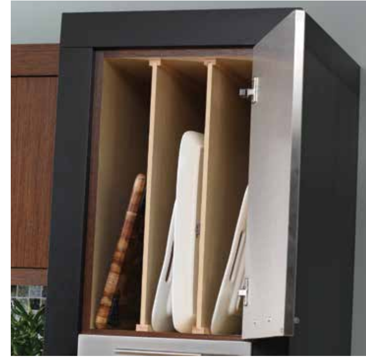
Tray dividers (TDB) are a convenient way to partition a cabinet for tray storage.