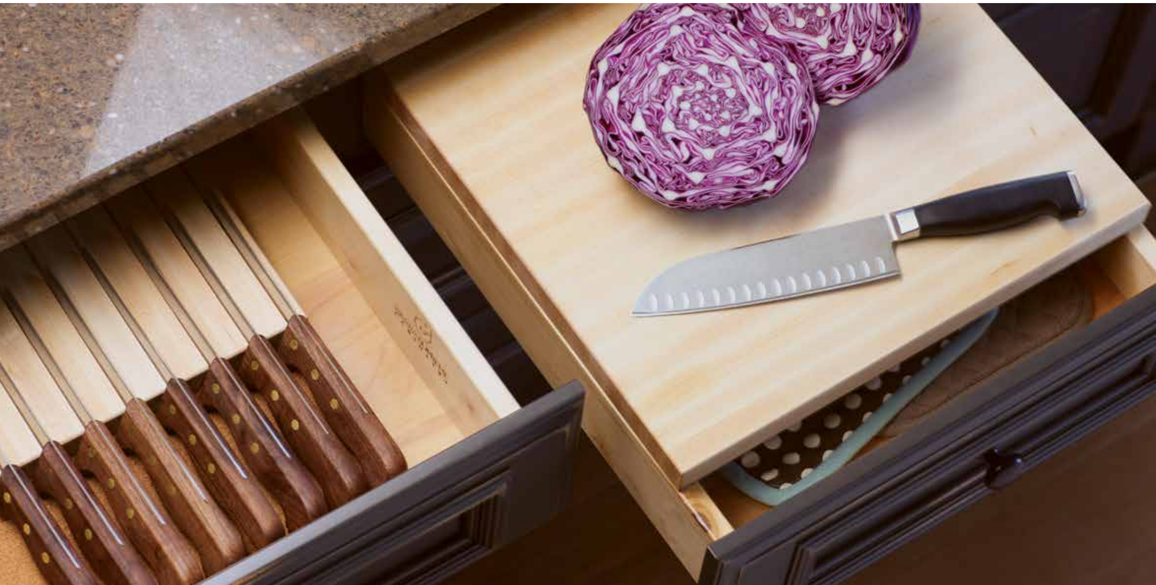
A slotted Drawer Knife Holder (DKH) keeps blades sharp, while a chop block (CBD) is conveniently located in the adjacent drawer. The chopping block has storage space below and is removable from the drawer for countertop use.

Cutlery should be stored in a safe place away from little fingers and organized in individual slots to keep blades sharp. Our pull-outs take advantage of small spaces and can be ideally located near the food prep area. Drawers can include a drawer knife holder and a chop block. Dura Supreme offers a variety of cutlery storage accessories in drawers and pull-outs for the method that best suits your needs.