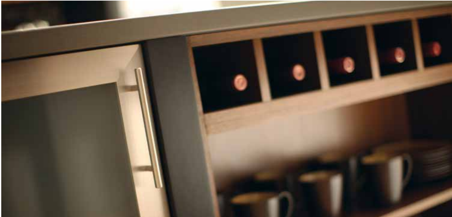
Our wine rack cabinets (vertical or horizontal) offer attractive storage and display of your favorite wines (WWR and BWR).