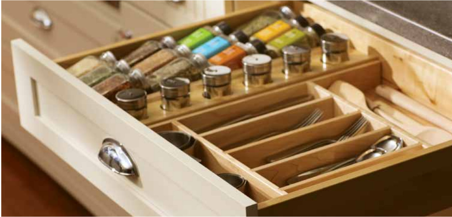
Wide drawers can multi-task with a Deluxe Drawer Organizer (DDOB) for silverware, utensils and spices.