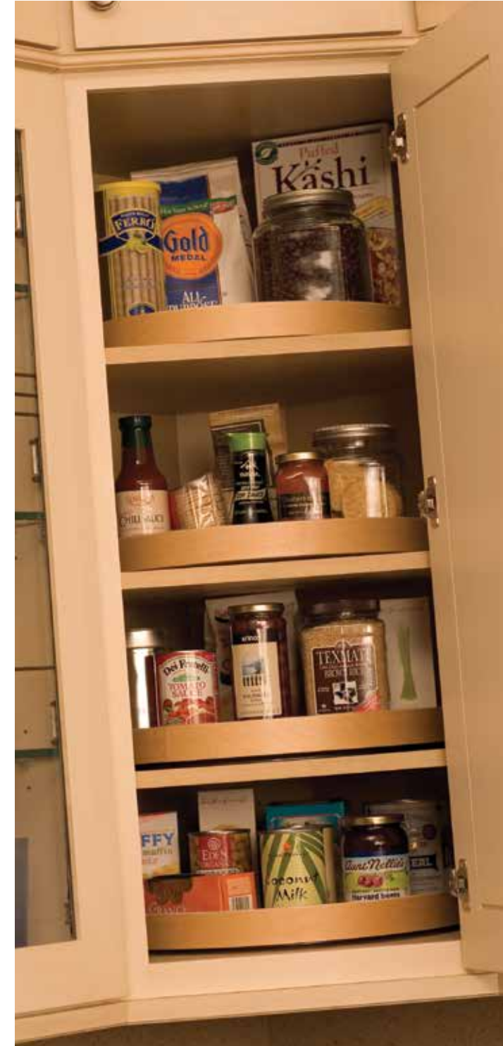
A corner wall cabinet is an ideal location for a stack of convenient turntables (DCWWS).