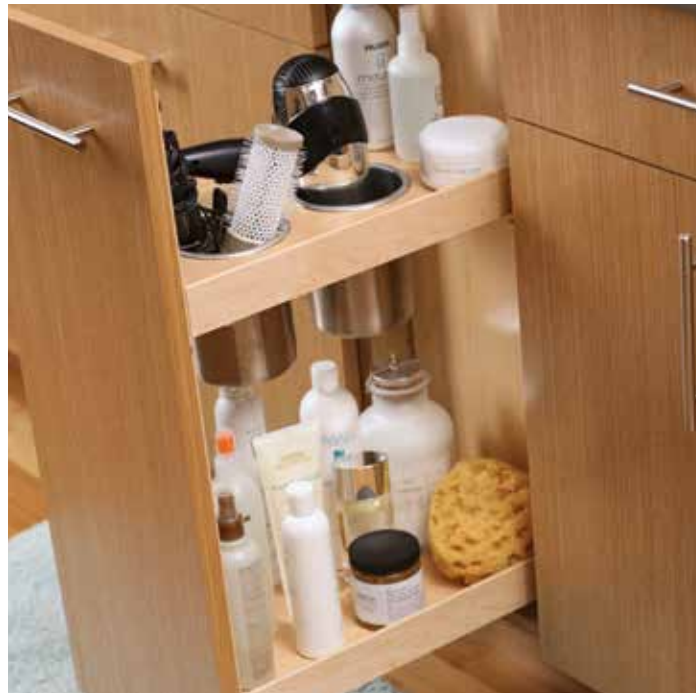
A vanity grooming rack (VGC) is a must-have for curling irons and blow-dryers.