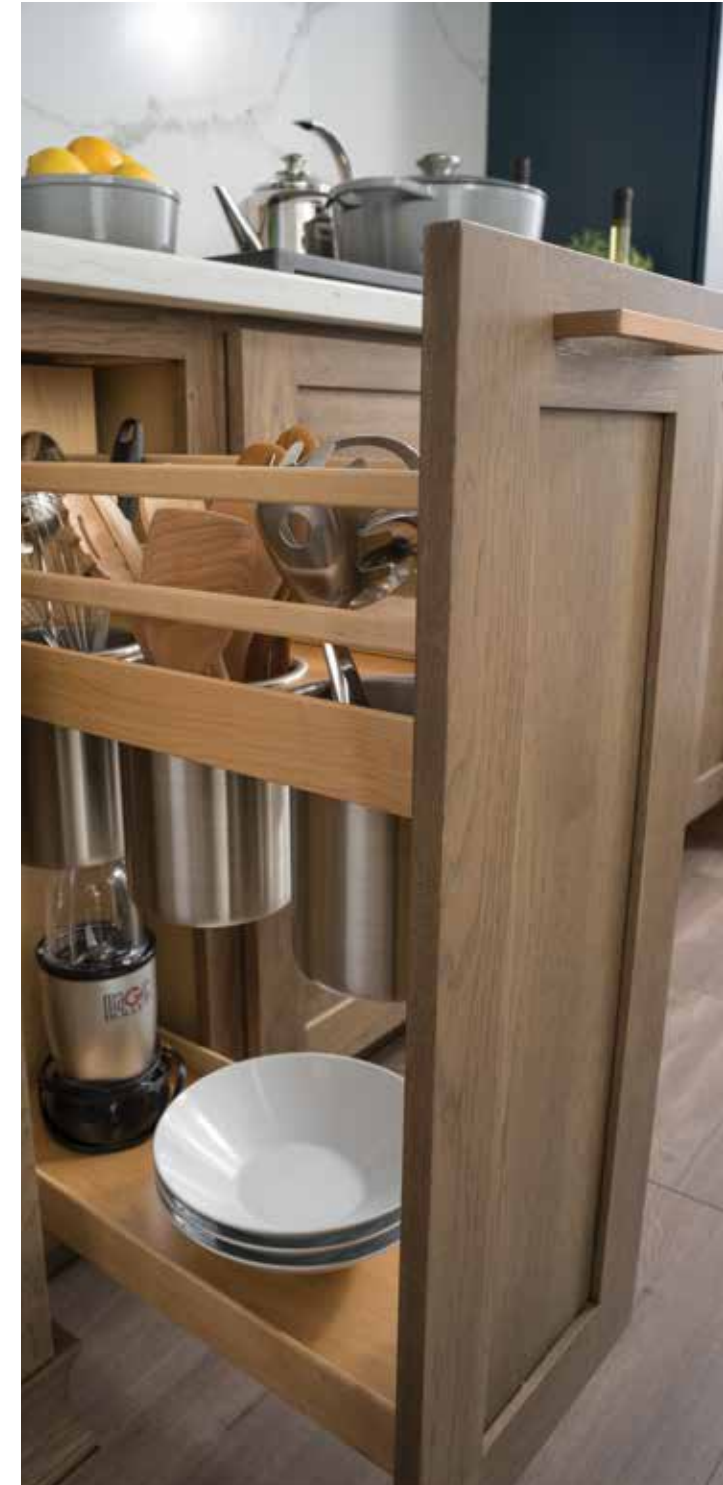
Base Utensil Pull Out keeps the frequently used utensils close at hand (BPOUC12).