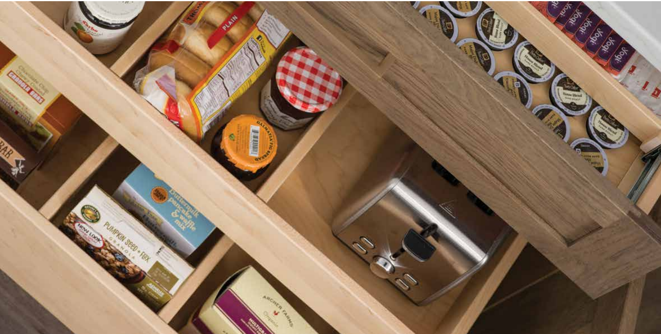
Adding drawer partitions to different depth roll outs allows for accessible storage in a base cabinet. 4” deep roll out (ROS) and 8” deep roll out (ROSD) customized with drawer partitions (DWRP).

Base cabinets are typically 24” deep, providing a lot of storage space. However, accessing the items stored in the back of the cabinet can be inconvenient and cumbersome. That problem is solved with our roll-out shelves, available in several depths, different configurations and customizable by adding various partitions. Our roll-out shelves glide out smoothly on full-extension slides and include a soft-close, self-closing feature for optimum convenience.