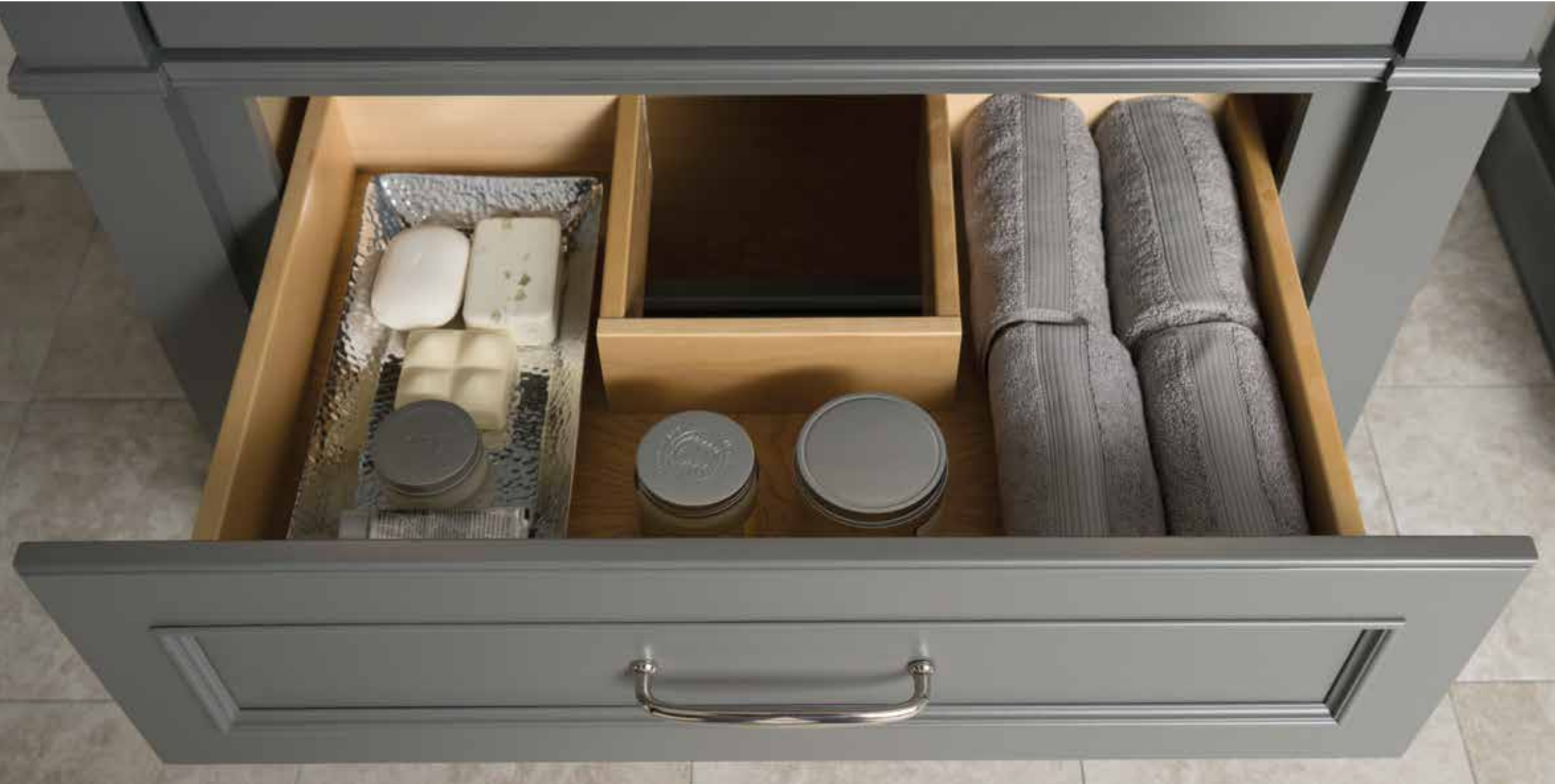
A plumbing drawer provides extra storage options in a frequently underutilized space (PLUMDWR).

Dura Supreme's unique storage solutions have applications in all areas of the home. The accessories shown in this section feature smart storage ideas for bathrooms, desk areas, entertainment centers and beyond. Don't limit the use of our storage solutions to cabinetry in the kitchen, but extend the organizational ingenuity and clutter-management to all areas of your home with Dura Supreme.