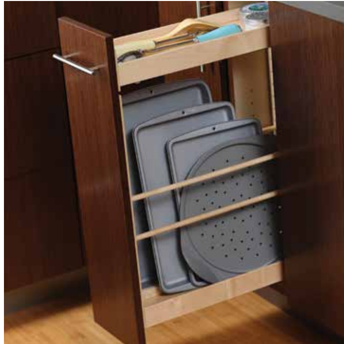
Tray storage in a pull-out offers a practical and convenient use of space (BPOC-TS or BPOF-TS).