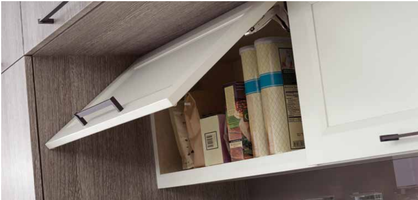
A stay-lift mechanism (WSLC) allows the door to lift-up and stay-up to conveniently access the cabinet.