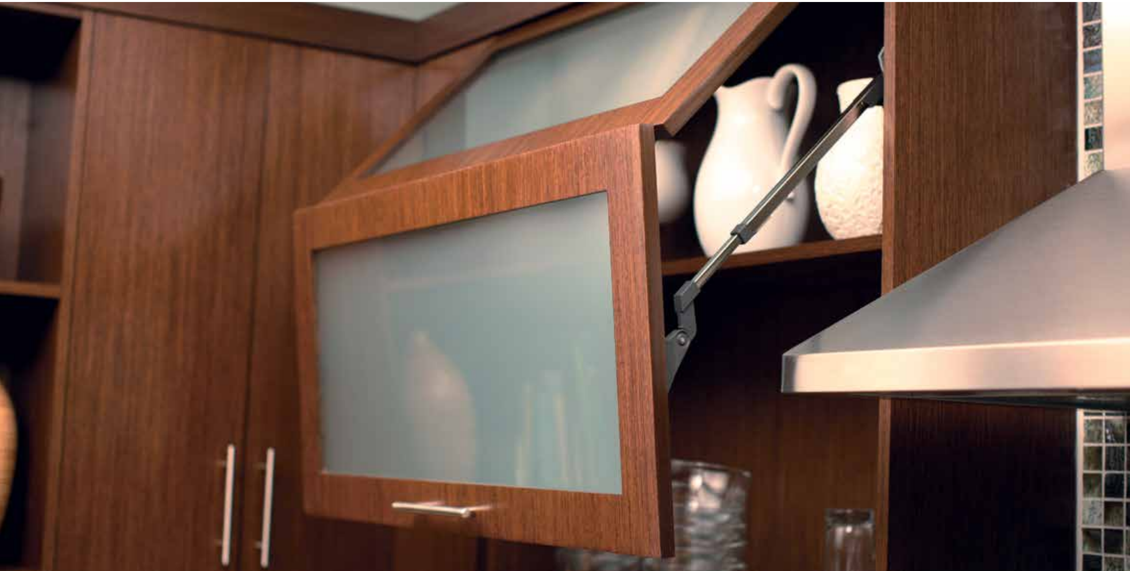
Dura Supreme's horizontal Bi-fold Door (WBFD) lifts up and out of the way for full access to the cabinet interior.

The items you store in your kitchen cabinetry are more accessible than ever before with every manner of door that lifts, folds or tilts up and away! Most of the time, traditional hinged cabinet doors work wonderfully. But for those occasions that call for a unique design or if the door swing could collide with a hood or another kitchen element, Dura Supreme offers a variety of ingenious door mechanisms that work as well as they look.