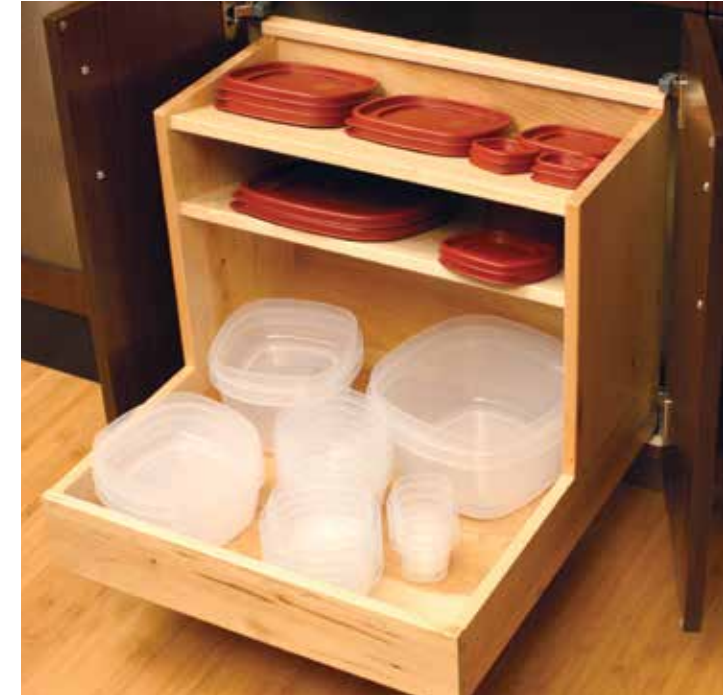
Neatly store your plastic storage containers and lids in this convenient roll-out (BPPRO).