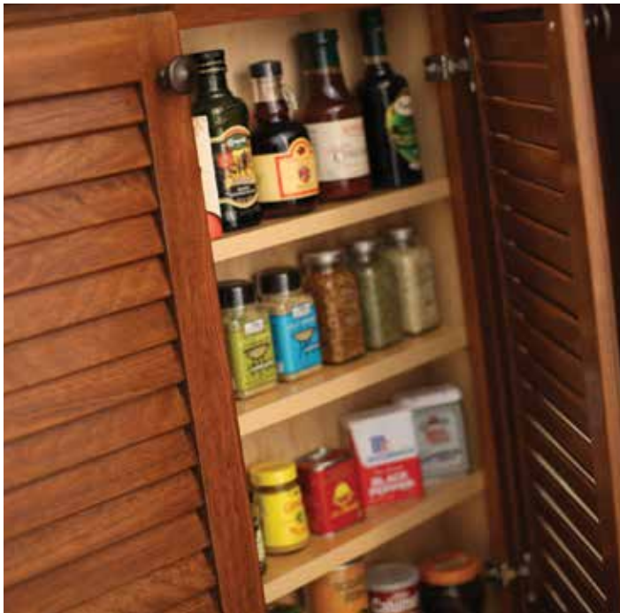
The end of an island is a great place to tuck a spice rack in a shallow cabinet (ISLTPA-DR or ISLTPA-OS).