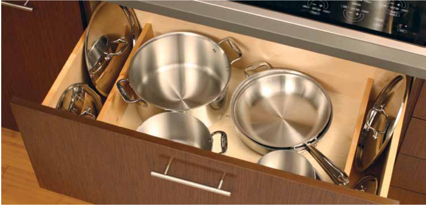
A deep drawer below a cooktop is an ideal location for pots and pans. Add the Lid Storage Partition (LSP-S) to stand lids on both sides of the drawer.