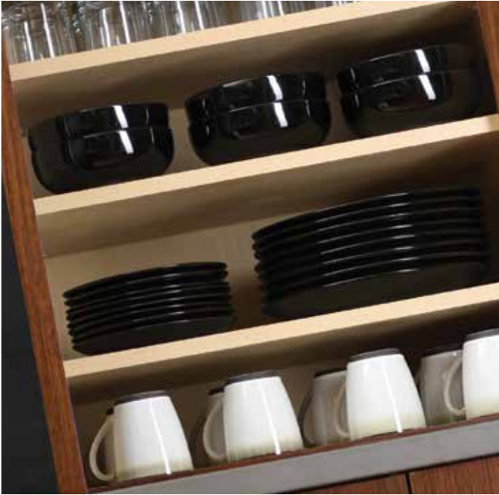
A counter cabinet provides ample storage with shelves positioned precisely to maximize organization.