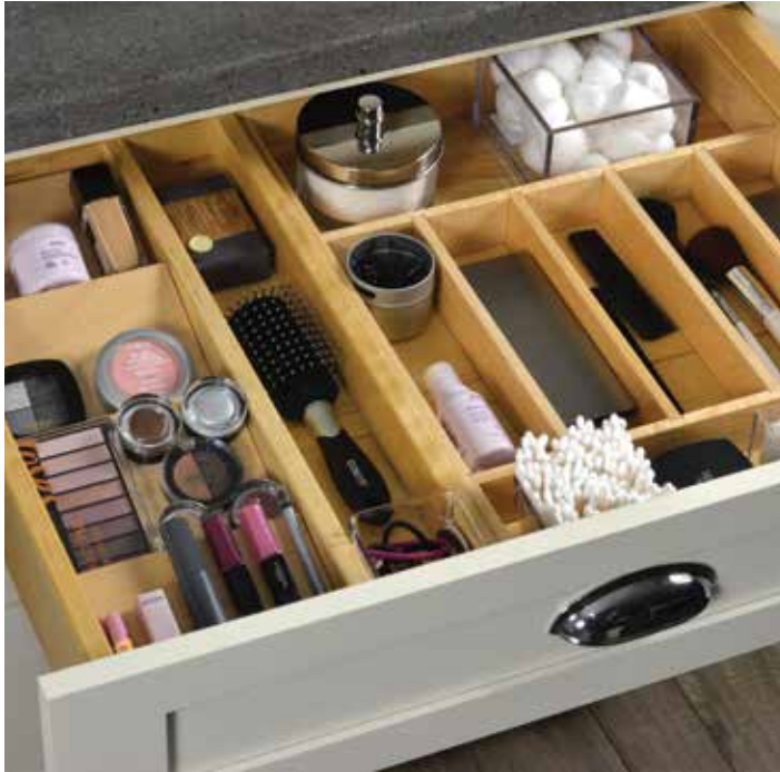
A vanity drawer can be organized with dividers, partitions and angled shelves to organize cosmetics for easy visibility (DWRP, CD, DWSR).