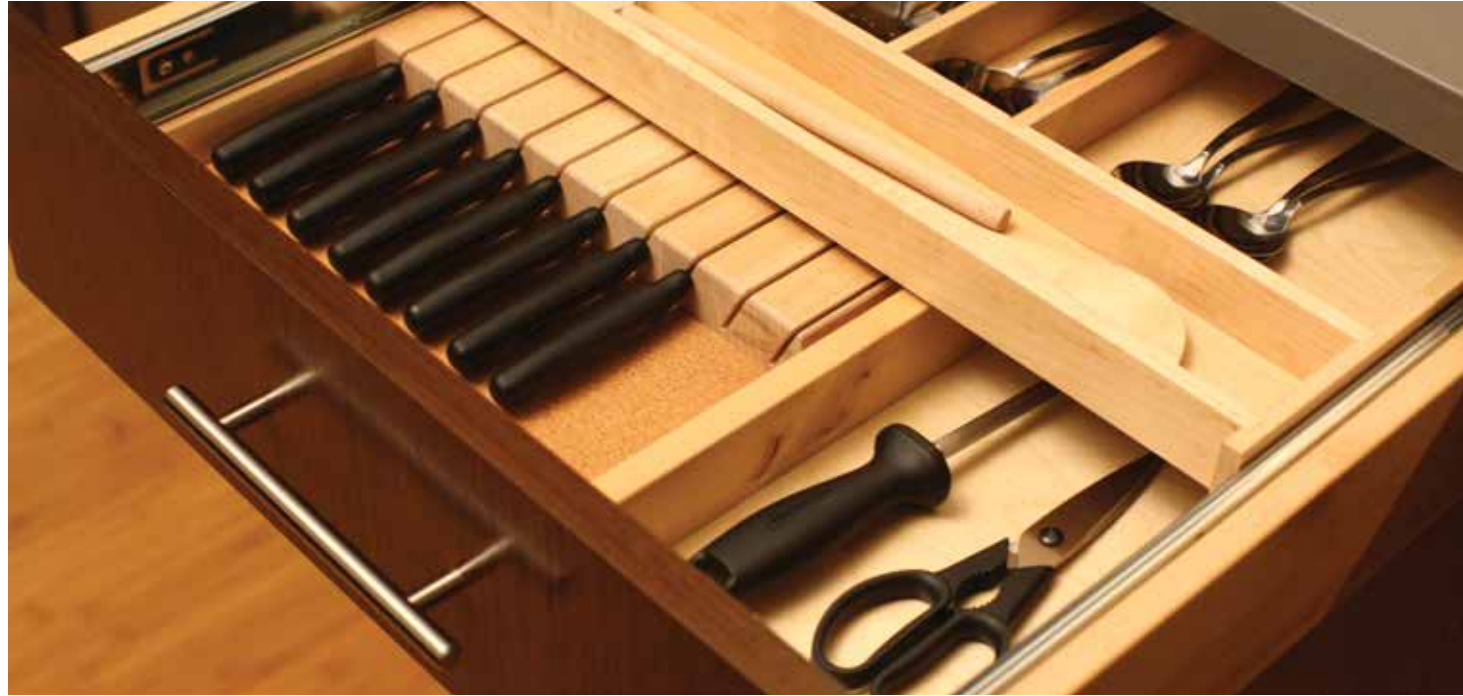
The slotted knife holder can be hidden below a two-tier cutlery tray for maximum drawer use (TTWCT-A with DKH below).