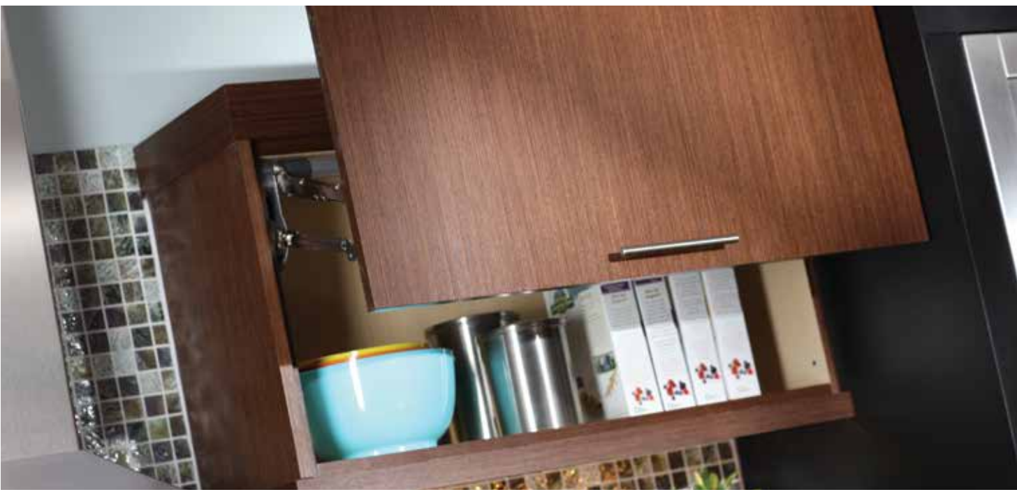
If space allows above the cabinet, a lift-door (WLD) provides full-access to upper cabinets that are hard to reach.