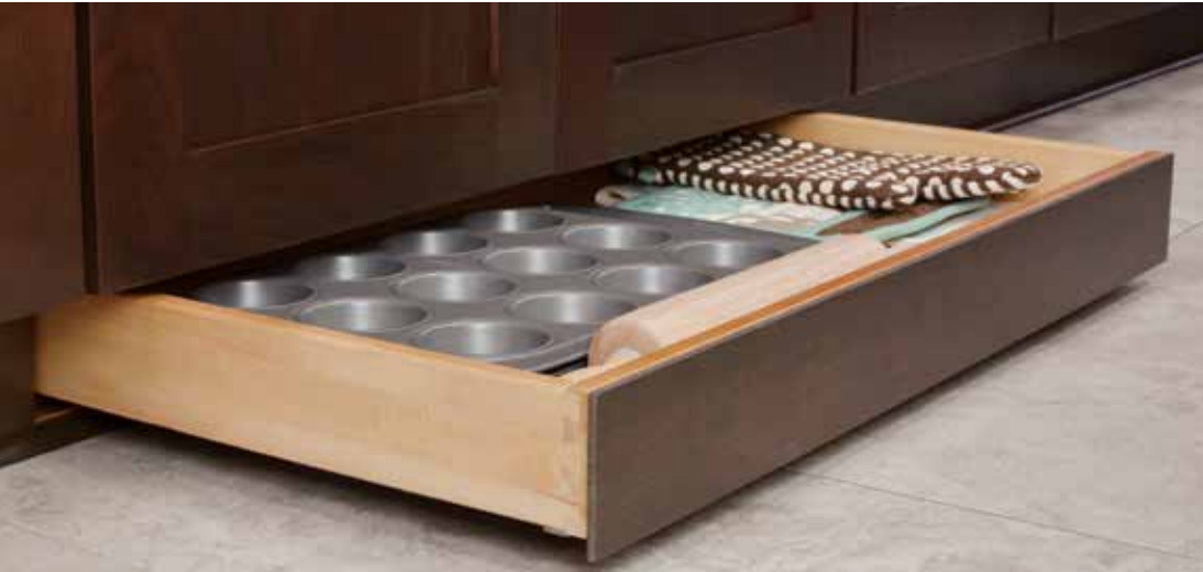
Take advantage of the space right under your feet with a toe space drawer (TSDWR).

Storage solutions abound with partitions and dividers to customize and organize your drawers. With thoughtful planning, every drawer can be configured to optimize space and keep everything at your fingertips. From a convenient charging station in the kitchen for electronics and smart-phones, to a craft drawer in the utility room and a hidden drawer in the toe space, there's no excuse for clutter with convenient drawer solutions from Dura Supreme.