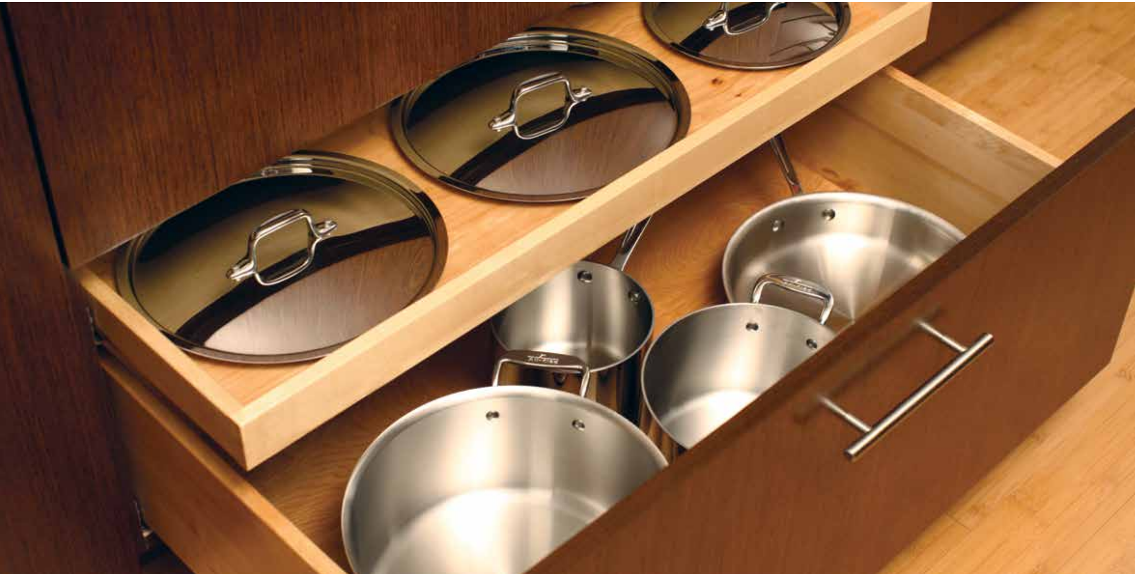
A shallow roll-out neatly stores the lids for the pots and pans stacked in the deep drawer below (ROSAD).

A well-stocked kitchen will undoubtedly have an assortment of cookware and bakeware ideally suited for a well-organized storage system. The usual method of stacking pots and pans together results in a clanking jumble of cookware, a tangle of handles and missing lids. Dura Supreme provides a multitude of specialized storage options for pots, pans and bakeware, from convenient deep drawers with integrated lid storage partitions, to specialized pull-outs for your entire cookware collection.