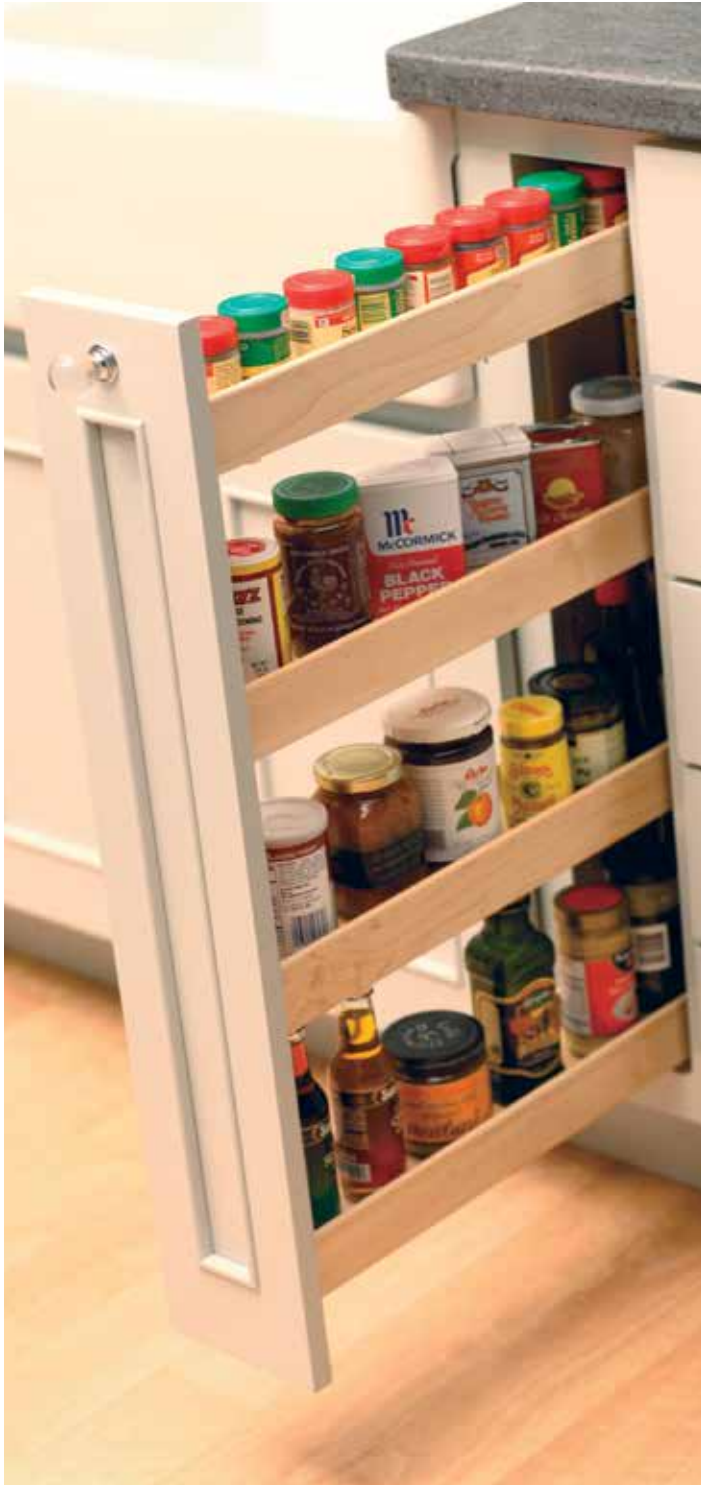
Organize an entire collection of spices in only a few inches of space with our pull-out spice rack (BPOC-SR or BPOF-SR).