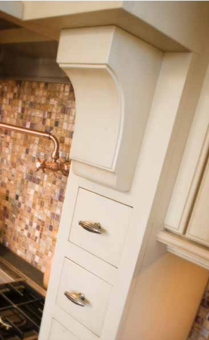
Apothecary drawers are a charming option for hoods and offer convenient storage for spices and recipe cards (PIL-K or TOWR-G).

Dura Supreme's beautiful hoods create an impressive architectural focal point within the kitchen. They also provide an ideal location for convenient and practical storage of essential cutlery, cooking ingredients and spices. Towers and pillars next to the cooking surface can be specified with your choice of doors, pull-outs for spices or cutlery, drawers or open shelves depending on your personal preferences.