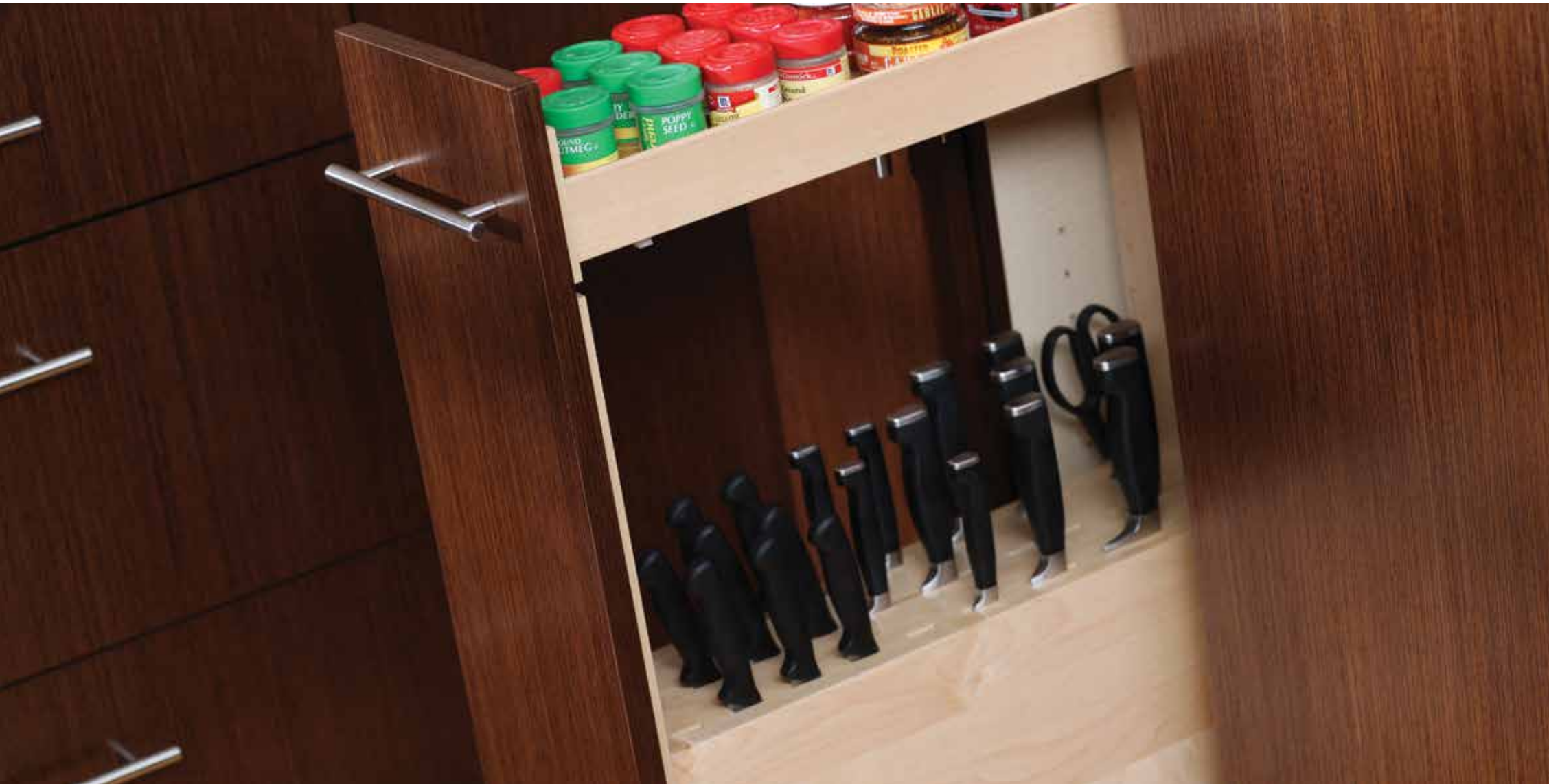
A shallow tray above the cutlery block offers convenient storage for small items and spices (BPOC-KB or BPOF-KB).

Small spaces offer a surprising amount of storage when you use Dura Supreme's pull-outs for spice storage, tray dividers, towel bar or cutlery. Oftentimes, these ingenious pull-outs can be tucked behind a decorative turned post or column for an exceptionally clever use of space. The full-extension slides are concealed for a sleek look and the soft-close, self-close feature is an added bonus.