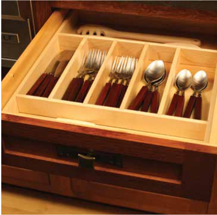
A simple Cutlery Divider keeps silverware and utensils separated and organized (CD).