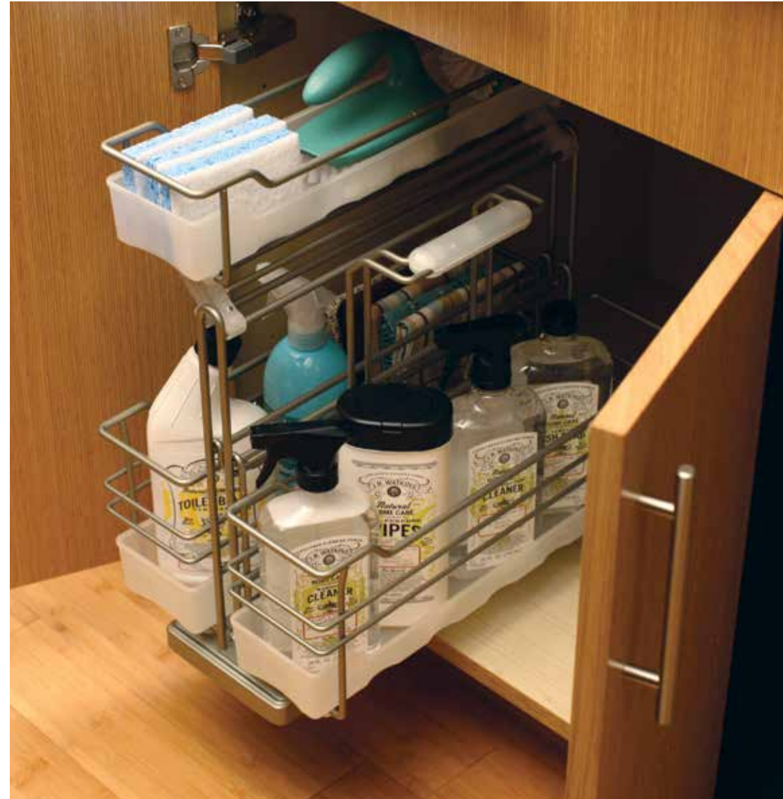
Organize cleaning supplies in our convenient pull-out caddy with a detachable, portable basket (SBPOC).