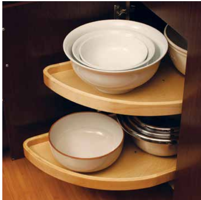
Two half-circle shelves pivot and pull-out for convenient access (BCSOSW).