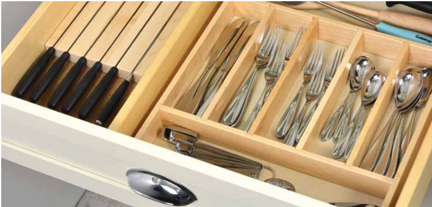
Multi-task and organize cutlery and silverware within the same drawer (DWRP, CD, DKH).