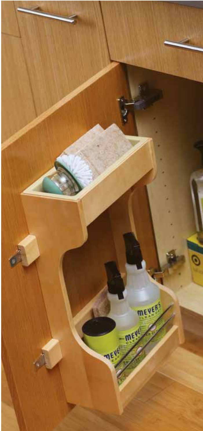
A convenient storage rack on the door organizes cleaning supplies (SBDR).