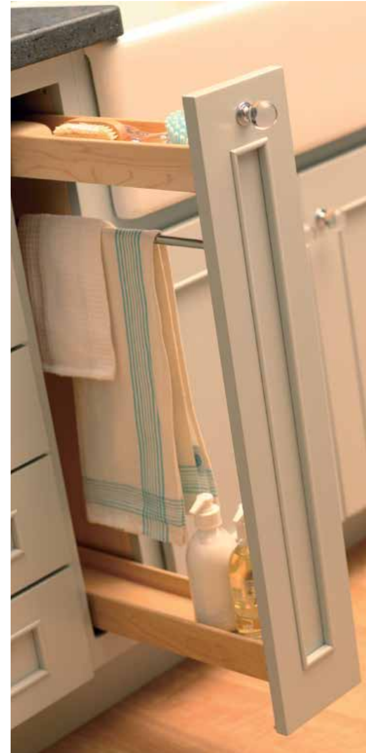
This thin pull-out next to the sink has a towel rod so dish towels can dry after use (BPOF-TB or BPOC-TB).