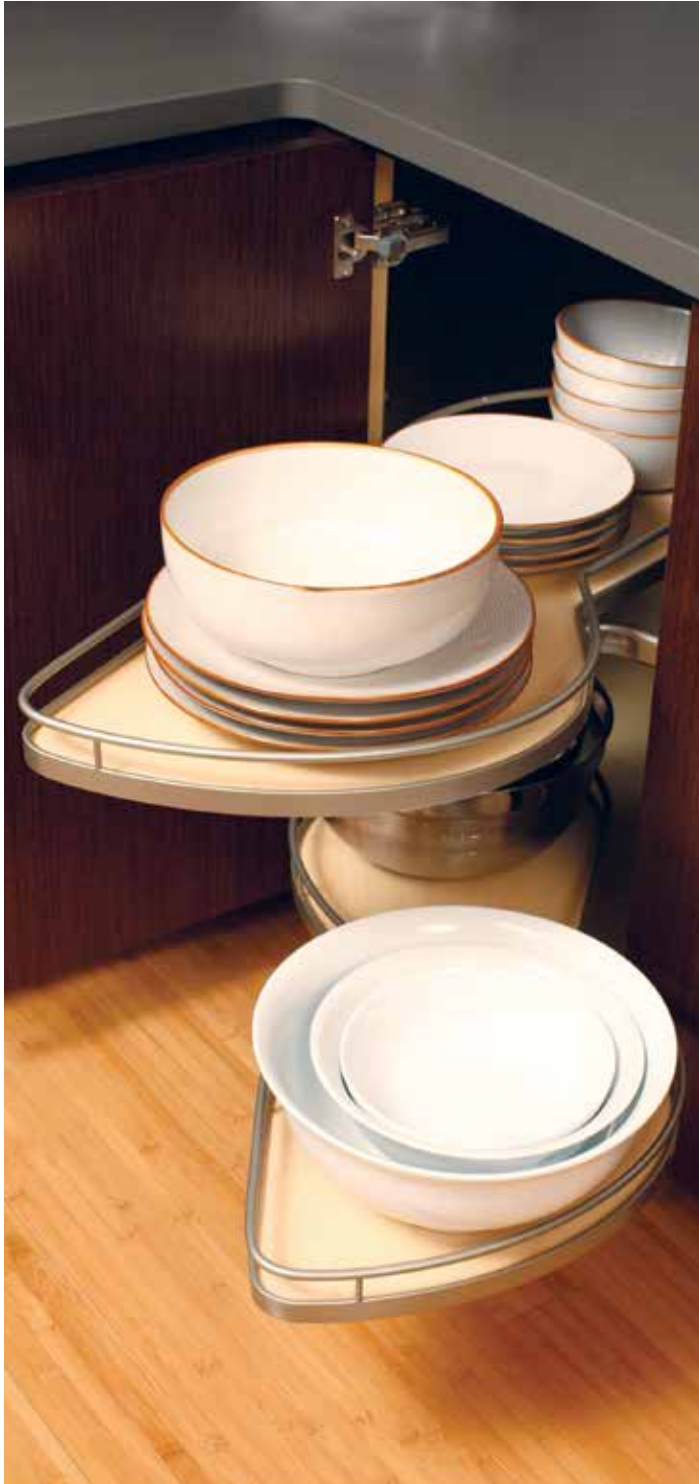
These uniquely-shaped shelves pivot and glide out of the cabinet for complete access to items stored in the farthest corners (BCSO).