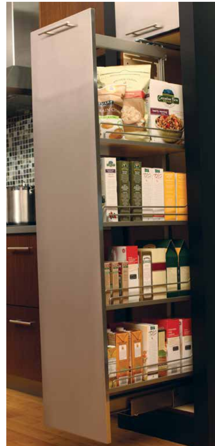
Our tall pantry (available with wood or wire shelves) provides an amazing amount of storage on full-extension glides (TPOP and TPOPW).