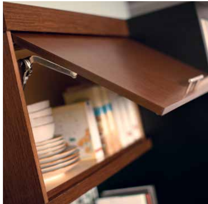
A stay-lift mechanism (WSLC) often works best for reaching upper storage areas.