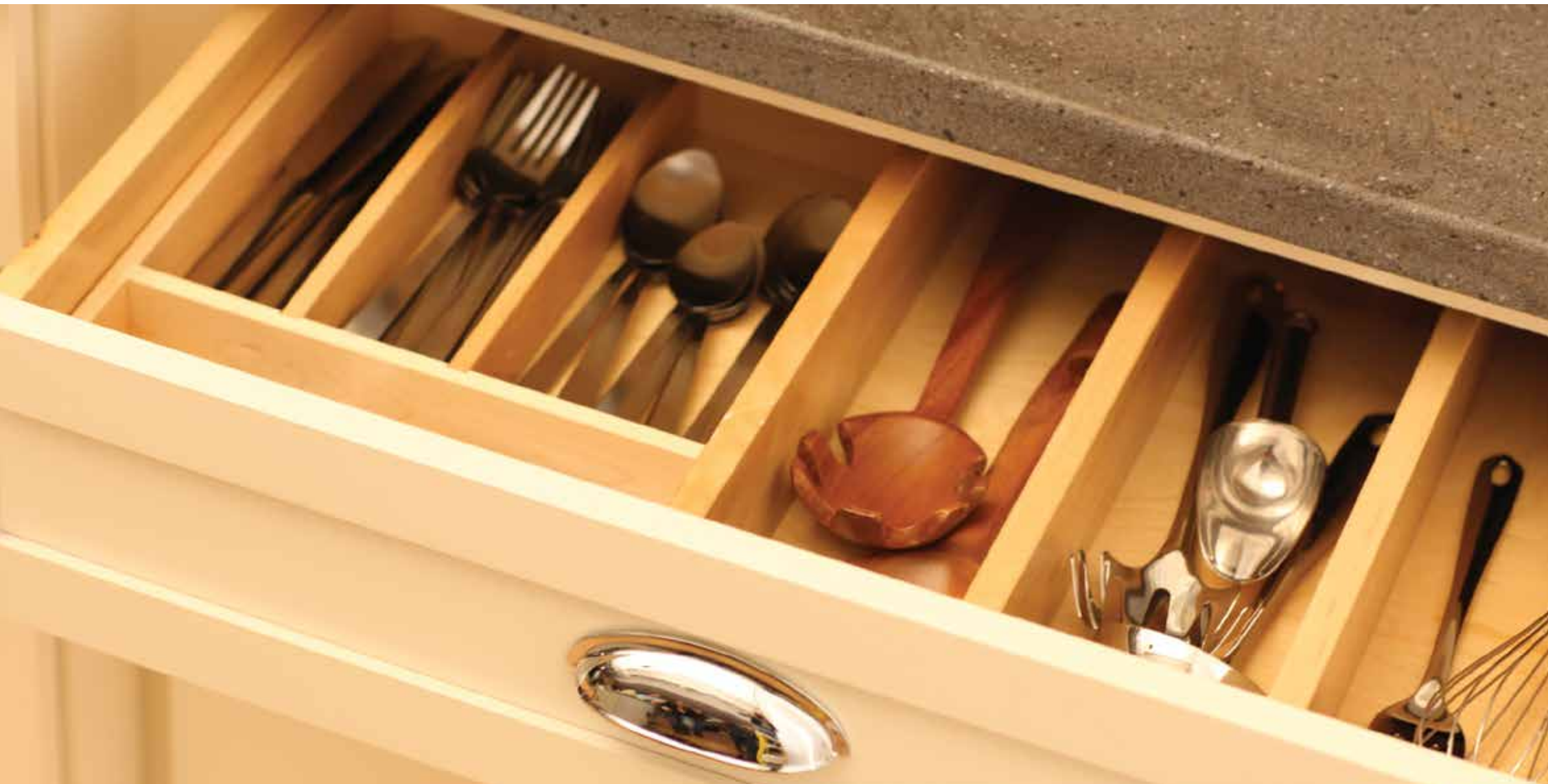
Wide drawers can be divided with a partition to accommodate two accessories; a cutlery tray on the left with partitioned utensil storage on the right (CD & 3 DWRP).

“A place for everything and everything in its place.” This popular saying perfectly sums up the convenient storage solutions available for your Dura Supreme cabinetry. Our divided trays, two-tier trays and drawer partitions allow you to segment a drawer for optimal organization and efficiency. Silverware and kitchen utensils are essential tools for every kitchen and when drawers are organized and neatly divided for each utensil, your entire kitchen will be more streamlined and functional.