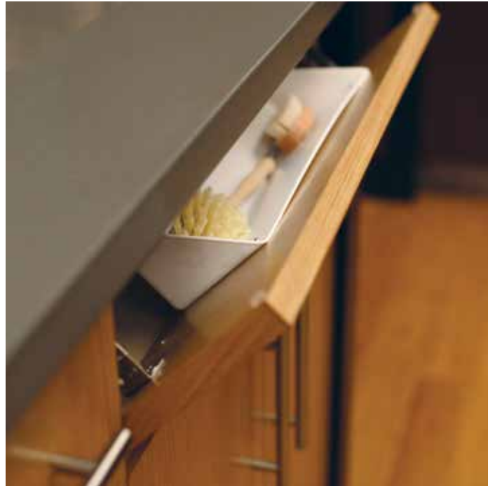
Sponges are tucked away neatly and can dry overnight in this tip-down sink tray (TDFS).