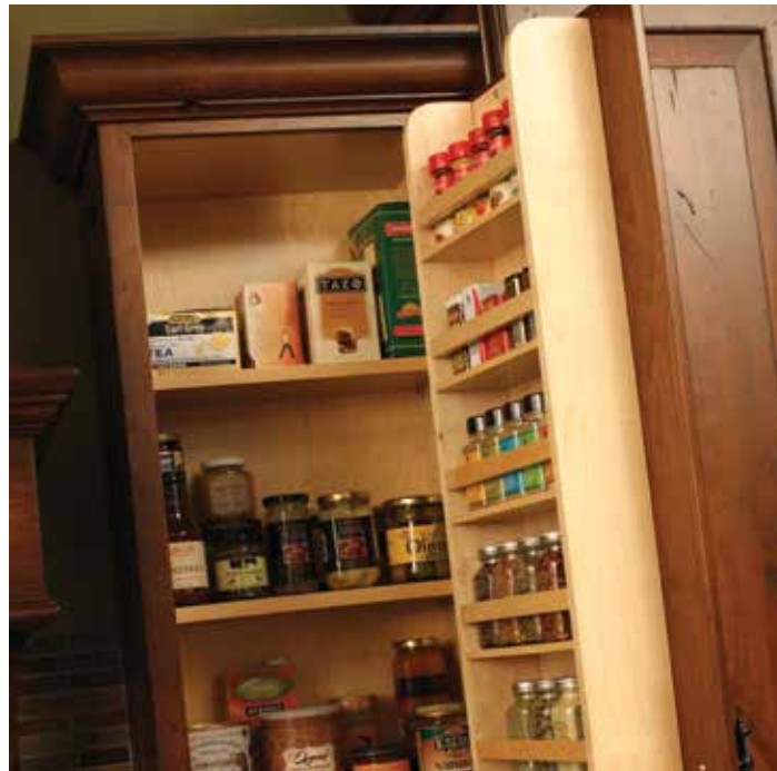
A traditional Door Spice Rack (DSR) offers convenient storage in a wall cabinet.