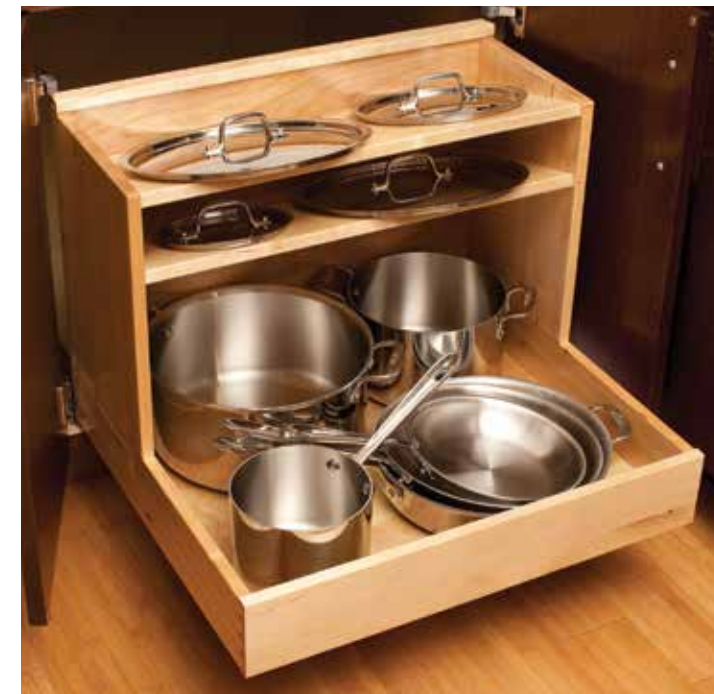
Your entire cookware collection can be organized neatly in this single pull-out that houses pots and pans in the lower section, and lids above (BPPRO).