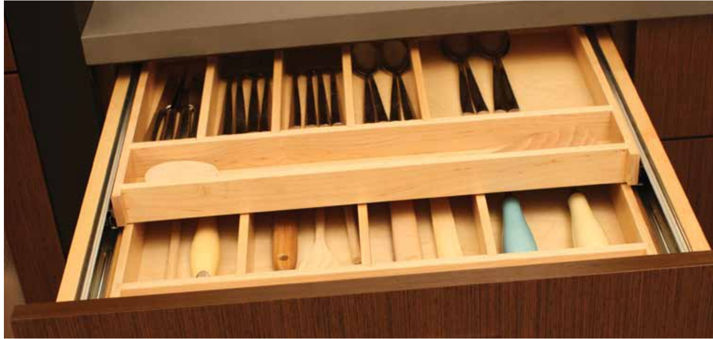
Maximize drawer space with a Two-Tier Wood Cutlery Tray (TTWCTA) to organize silverware and utensils on two levels within the drawer.