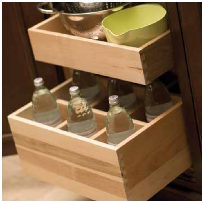
A roll-out bottle rack (ROSBR) is an ideal accessory near a beverage center.