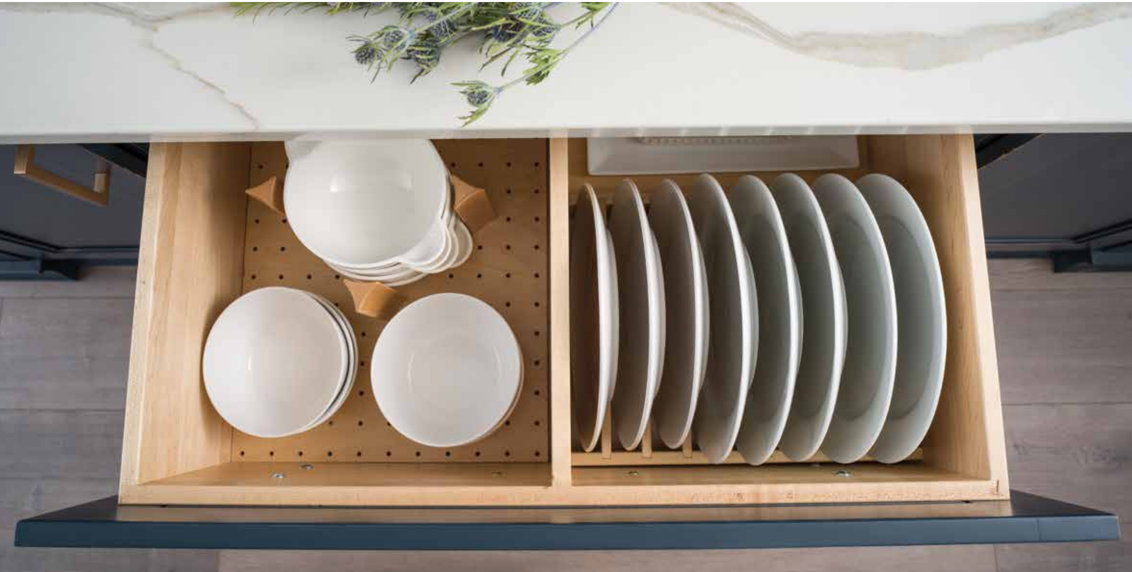
Our drawer plate rack (PRDWR) combined with the dish storage drawer (DSD) creates a convenient spot to store an entire set of dishware.

Or consider any of our popular drawer plate racks that store heavy dishware below the countertop instead of over your head.