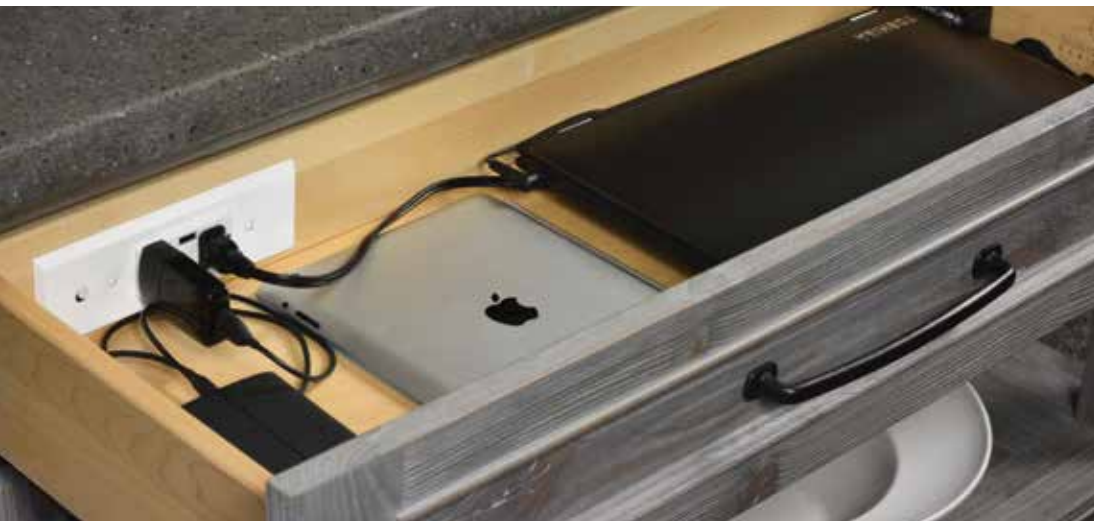
Drawers and roll-out shelves with a built-in charging station keep electronics neatly organized and always charged (DCHGS).