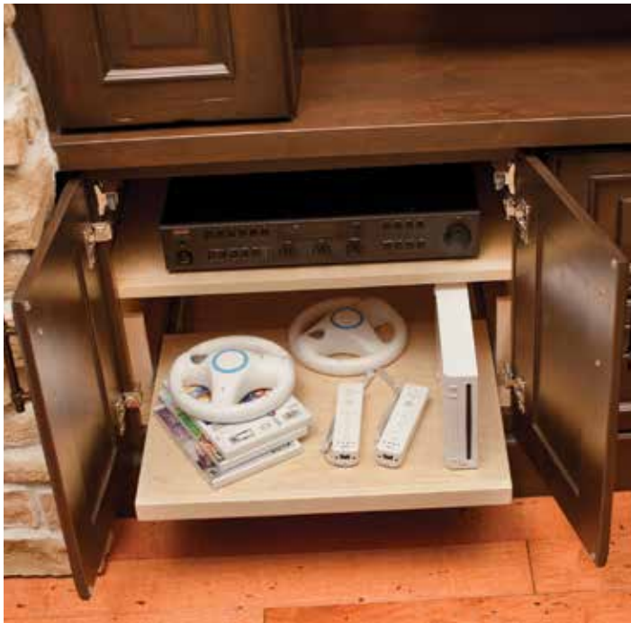
Our flat, roll-out media shelves work well for gaming systems and A/V equipment (ROSF).