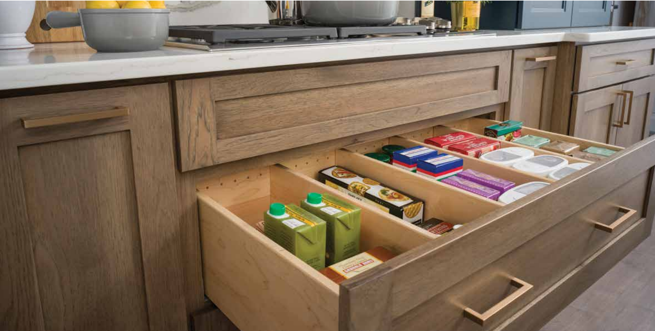
Deep drawers outfitted with adjustable drawer partitions (ADWRP) create customizable pantry storage.

An efficient household often has a pantry full of basic canned and dry goods that form the foundation of a good meal. Having a convenient location or two within the kitchen to organize your pantry goods, where everything is easily visible, can help minimize those last-minute trips to the grocery store. Dura Supreme offers a variety of pantry solutions, with wood or wire racks that pull out of small spaces and keep a stockpile of foods readily available.