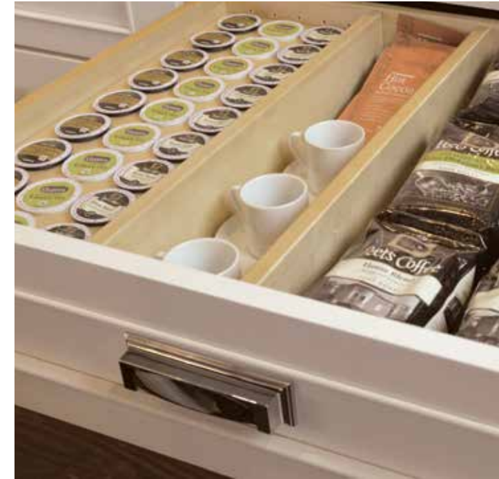
Design a coffee or tea pullout with adjustable drawer partitions and a K-Cup organizer (ADWRP and DKCUP).