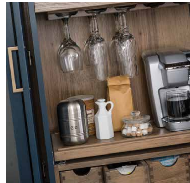
Conceal a beverage station behind pocket doors. Wine glass holder (WGH), rollout shelf flat (ROSF) and wall apothecary drawers (WED).