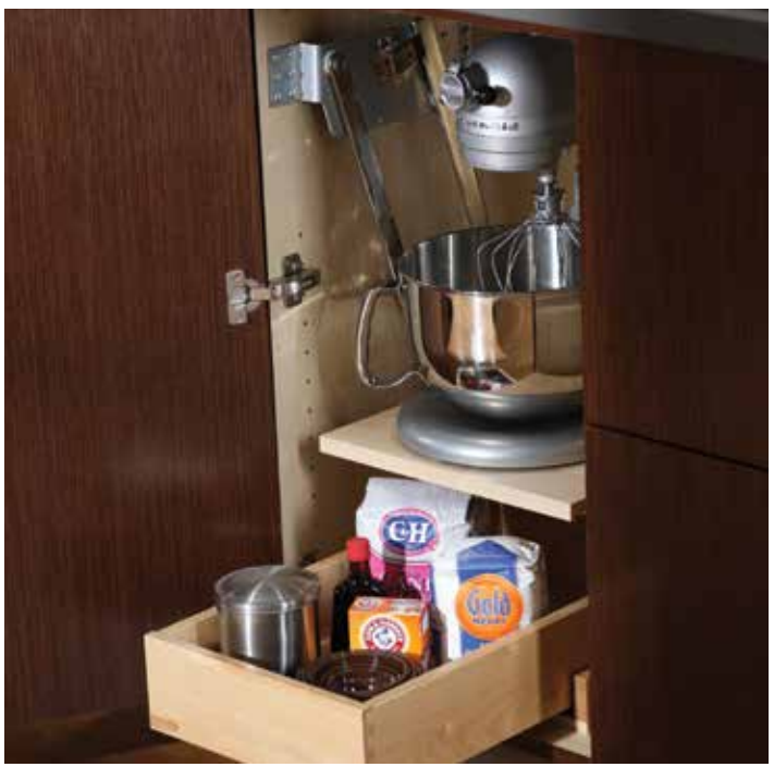
A heavy mixer can be lifted with ease to countertop level and conveniently stored in its own cabinet (BMSC).