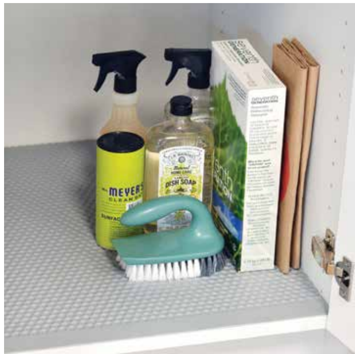
Protect your sink base from drips and spills by adding a sink base mat (SBFM).