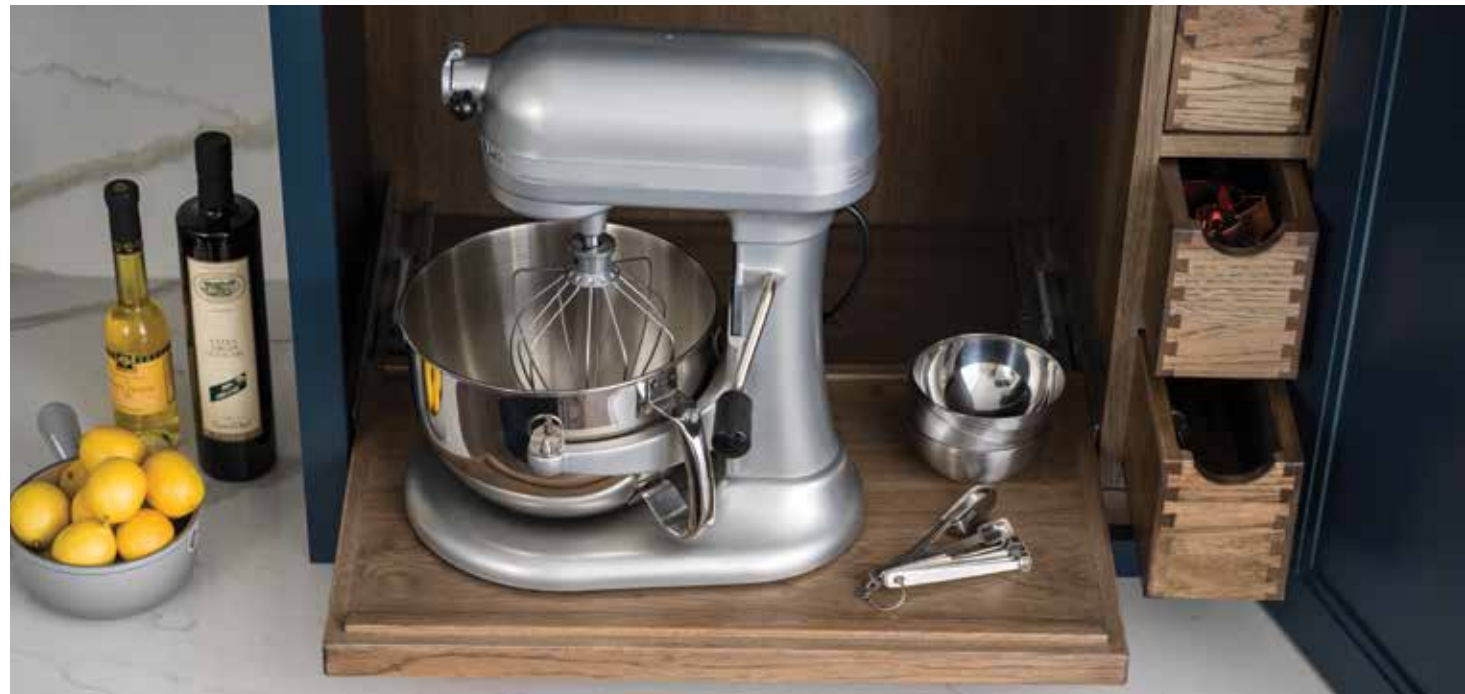
A flat roll out shelf makes accessing those larger appliances a breeze. (ROSF) shown with a component lip (COMPLIP).