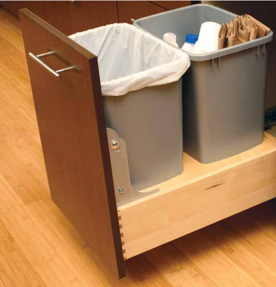
A convenient pull-out with double bins for trash and recycling is one of Dura Supreme's most popular cabinets (BRC).

The highest traffic zone in the entire house, especially around dinner time, is the kitchen sink. Dura Supreme provides a tantalizing array of accessories to streamline, organize and maximize this area so that every square inch is fully utilized. Our pull-out caddy for cleaning supplies detaches for portable use around the house. That cavernous area under the sink can be outfitted with tiered shelves and racks, while the cabinet next to the sink can be specified with a double pull-out for trash and recycling bins.