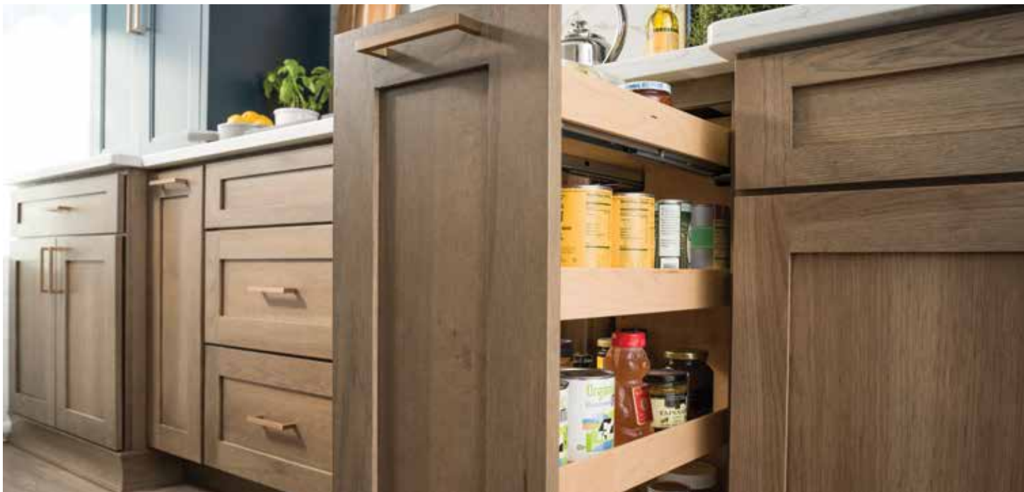
A functional pantry can be created in a narrow space.