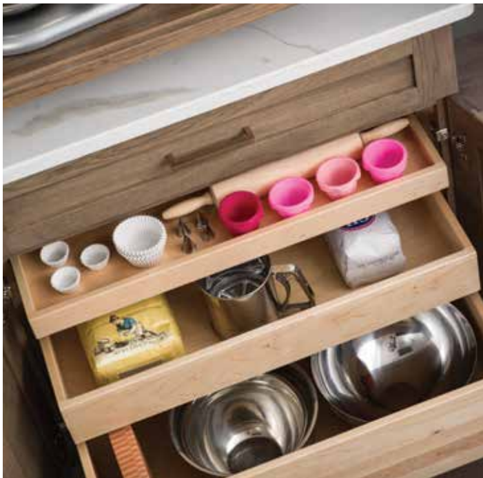
Roll-out shelves are available in three depths (shallow, standard and deep) to fit your particular application (ROS2, ROS and ROSD).