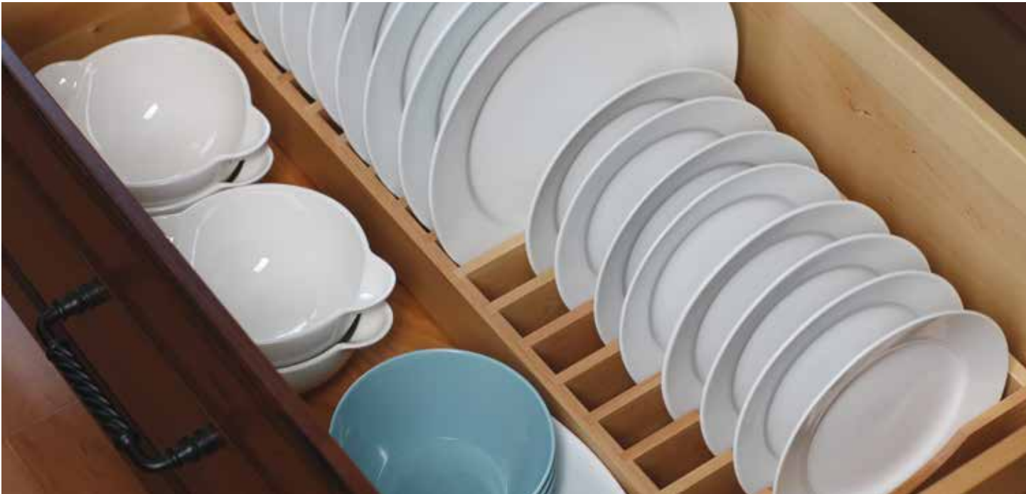
Our drawer plate rack (PRDWR) is a convenient location to store an entire set of dishware.