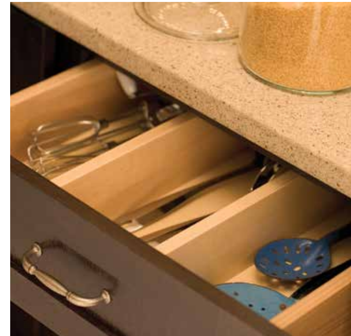
Drawer partitions can be specified to divide a drawer based on your personal preferences (DWRP).