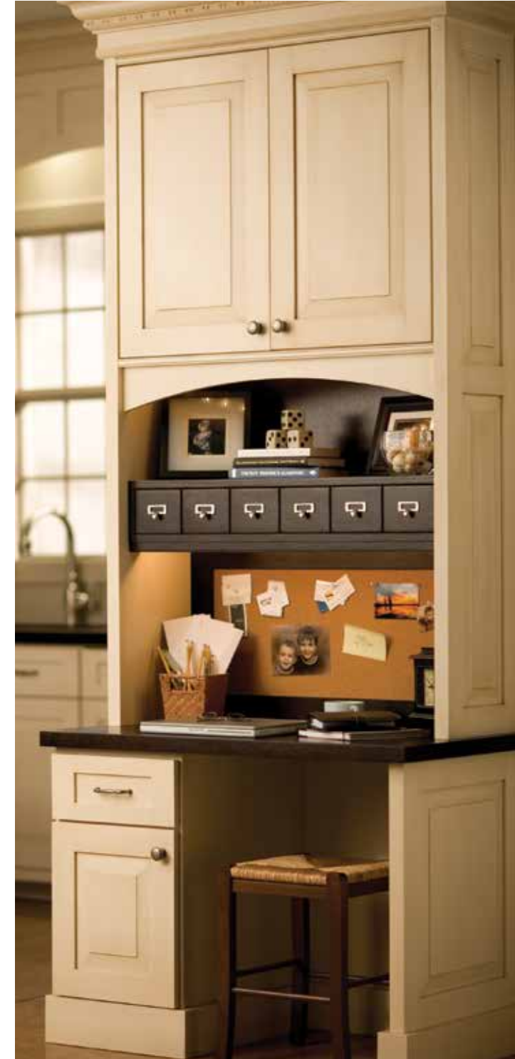
A desk area is ideal for our small apothecary drawers (WE_D).