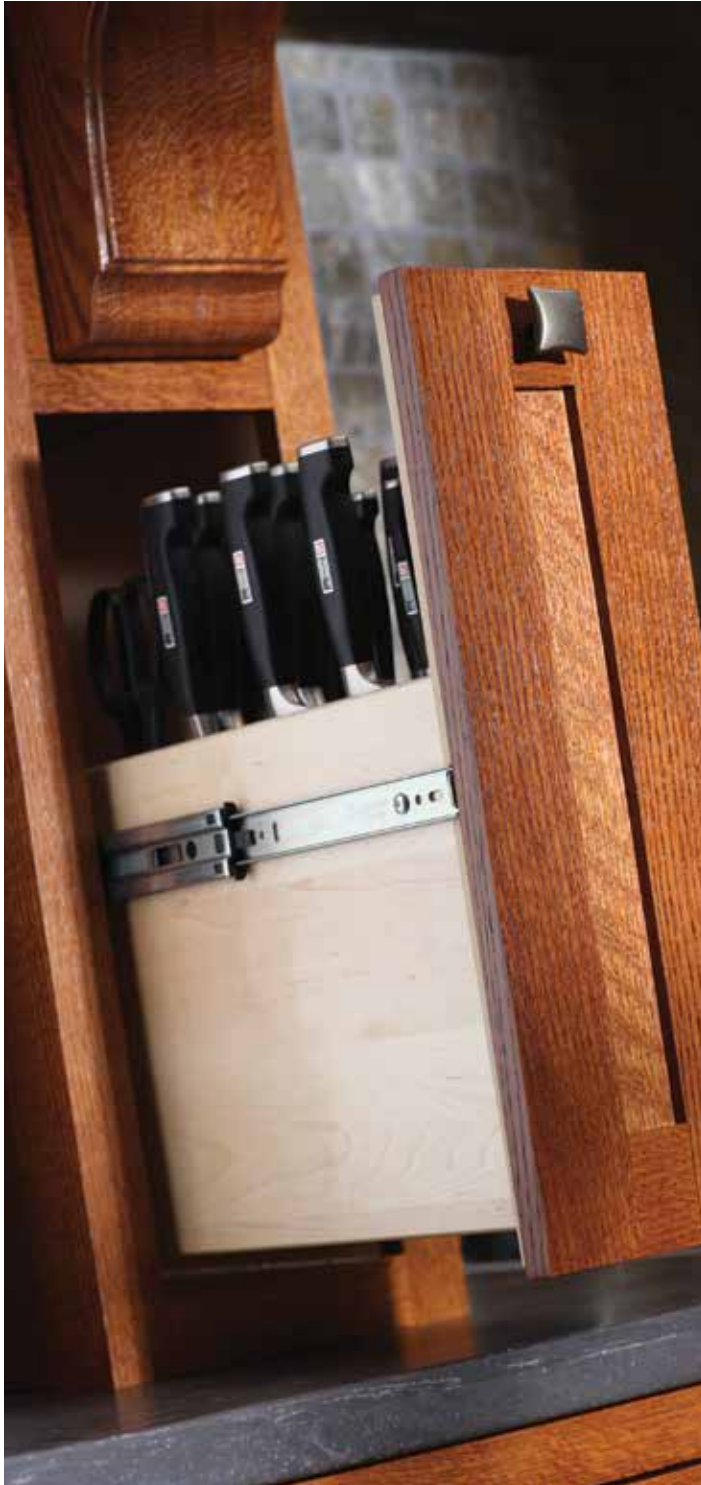
A pull-out knife block next to the hood is a convenient place to organize a cutlery set (PIL-M with Dura Supreme hood).