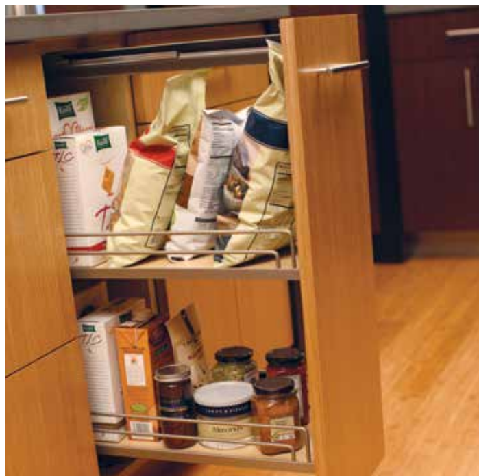
Dura Supreme's wire pantry (BPOPW) offers slim-line storage for pantry goods.