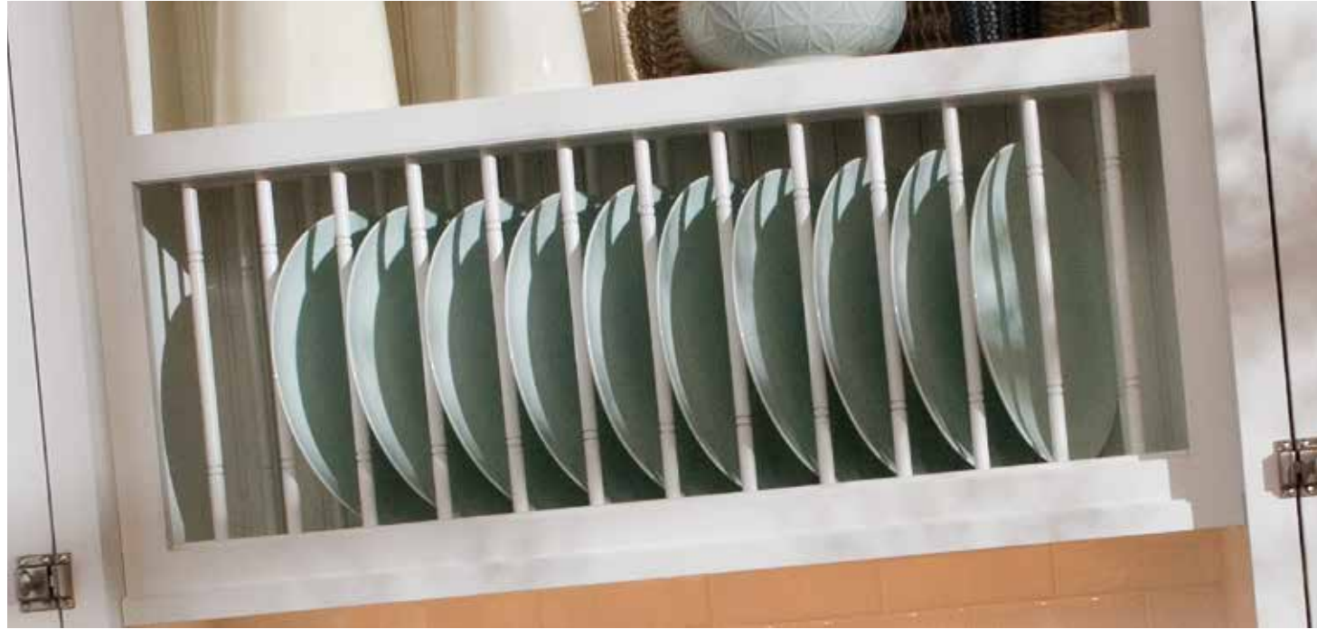
A decorative plate rack cabinet displays your beautiful dishware (WOPDC).