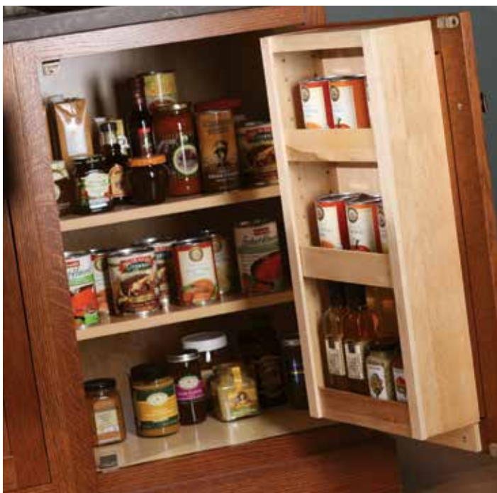
A can rack (BCP) on the door keeps pantry goods easily accessible.