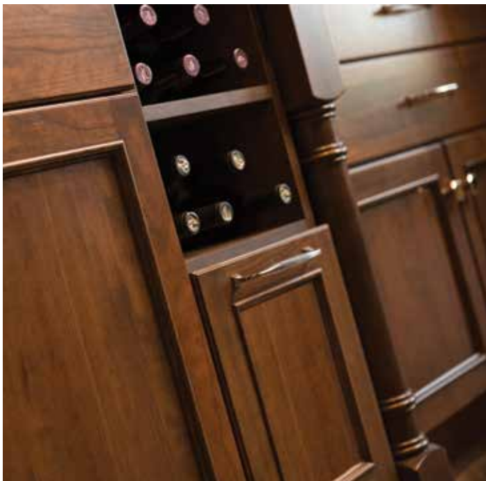
Open wine bins are convenient near a beverage center.