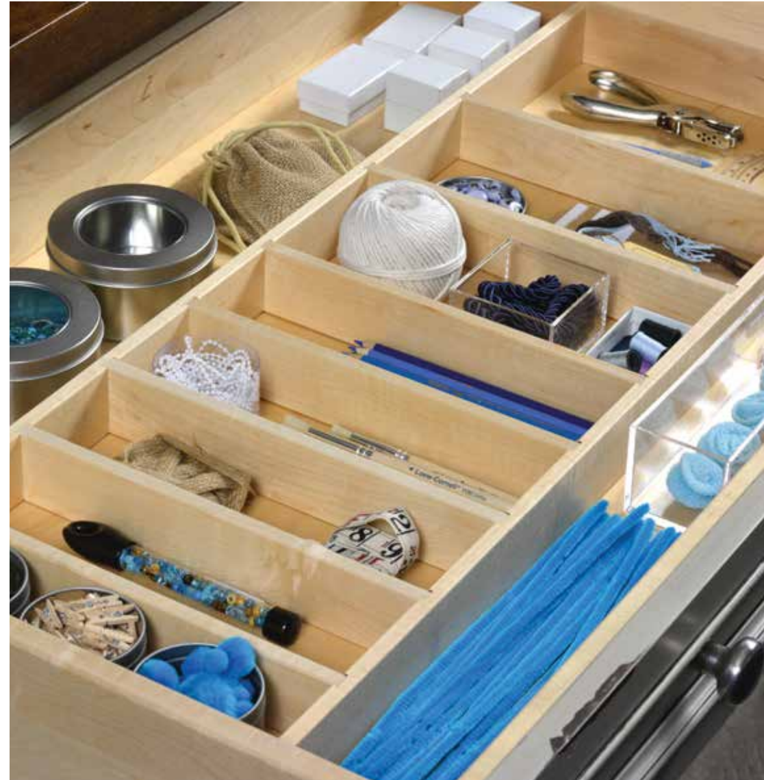
Wide drawers with dividers are perfect for organizing crafts and art supplies (CD30).