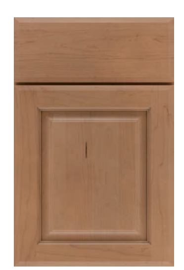
Ellerby Profiled Slab Drawer Front ©®®©