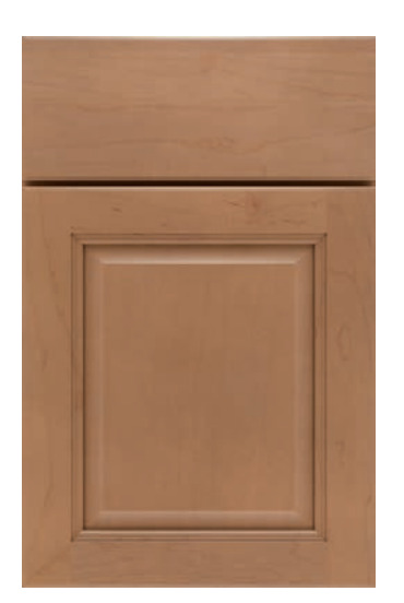
Rennie • Profiled Slab Drawer Front ©®