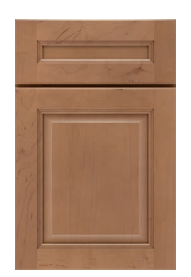
Rennie • 5-Piece Drawer Front