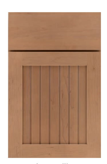
Lynnville Slab Drawer Front ©@