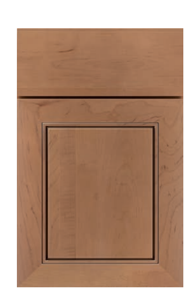
Darby Slab Drawer Front