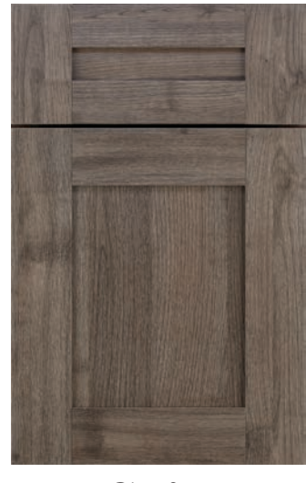
Shafer 5-Piece Drawer Front