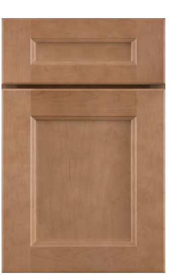
Justin 5-Piece Drawer Front ©®