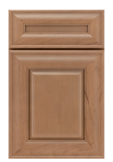
Bellmont 5-Piece Drawer Front ©@