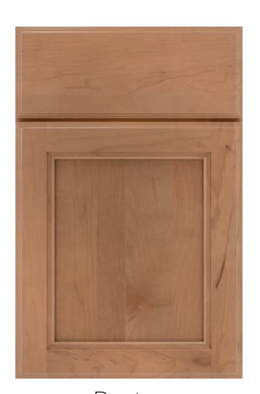
Baxter Profiled Slab Drawer Front ©®