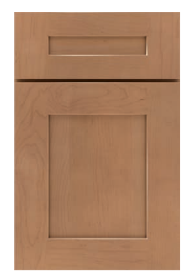
Larsen 5-Piece Drawer Front (©) (©) (©) (A)