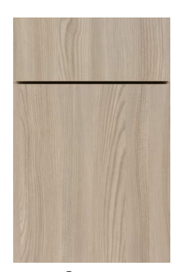
Genova Slab Drawer Front ©®