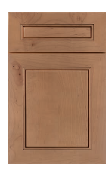
Darby 5-Piece Drawer Front