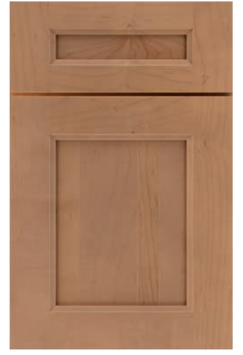
Amstead 5-Piece Drawer Front ©®®