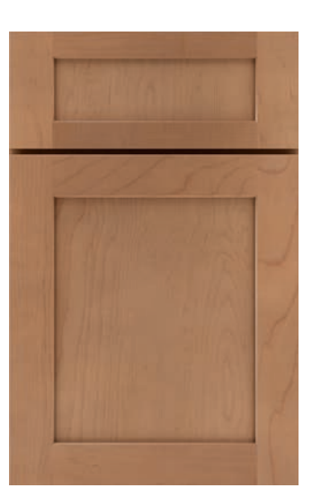
Whitman 5-Piece Drawer Front @©®® A