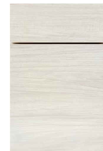
Troxel Slab Drawer Front