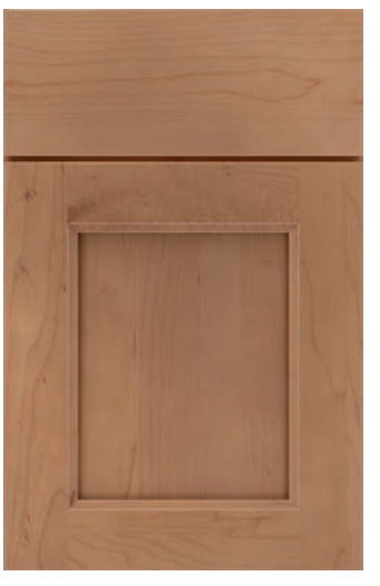
Amstead Slab Drawer Front ©®®