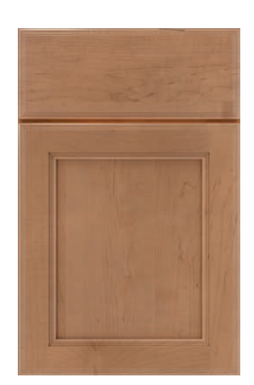
Dutton Profiled Slab Drawer Front ©®