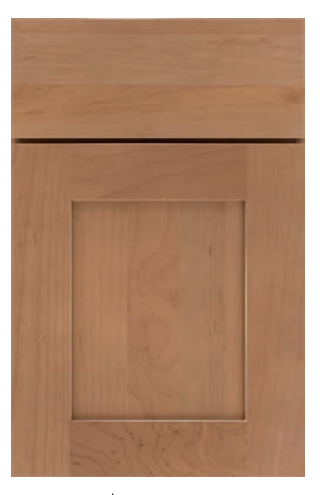
Larsen Slab Drawer Front ©©®®