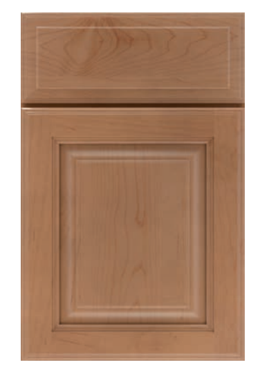
Herrington • Raised Slab Drawer Front ©®