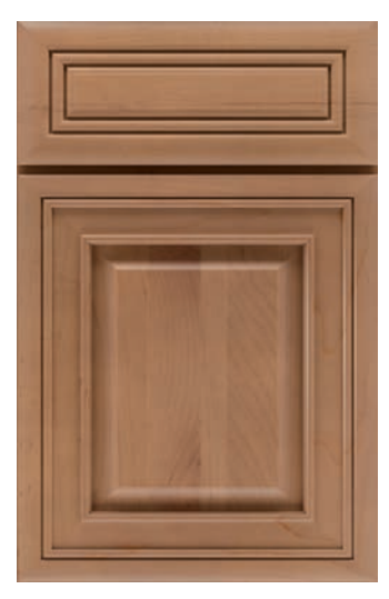
Kingston Routed Drawer Front ©©®