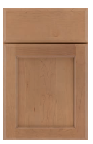
Painter Profiled Slab Drawer Front ©®®©