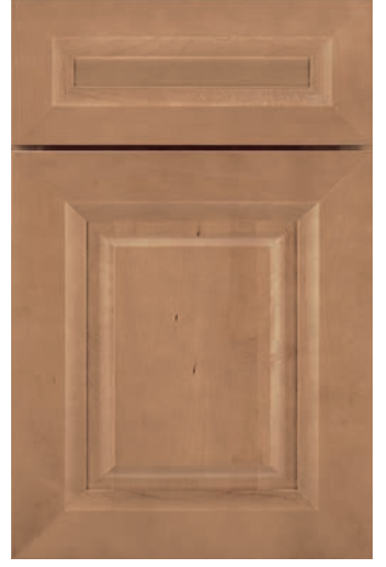
Hardin 5-Piece Drawer Front ©®