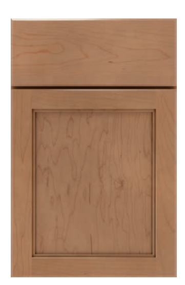
Lawton Profiled Slab Drawer Front ©© A