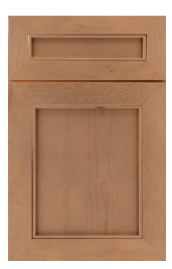
Cotter 5-Piece Drawer Front ©®