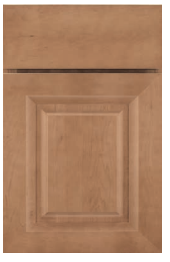
Hardin Slab Drawer Front © ®