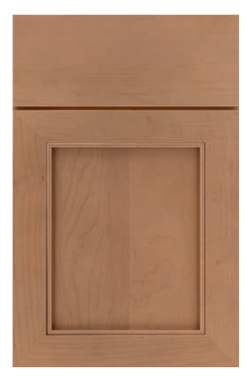
Cotter Slab Drawer Front ©®