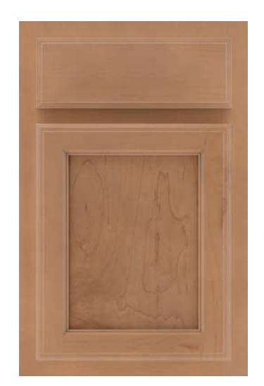
Manchester Profiled Slab Drawer Front ©®©