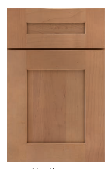
Northrope 5-Piece Drawer Front @@@@ A