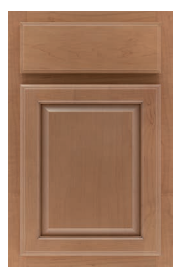
Fairbrook • Profiled Slab Drawer Front ©®©