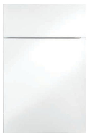
Taro Slab Drawer Front ©©