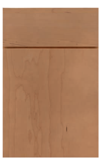
Caprice Slab Drawer Front ©®®