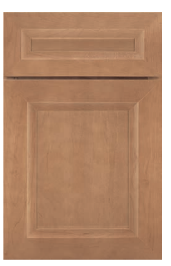
Butler 5-Piece Drawer Front ©®