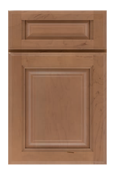
Herrington • 5-Piece Drawer Front © ®