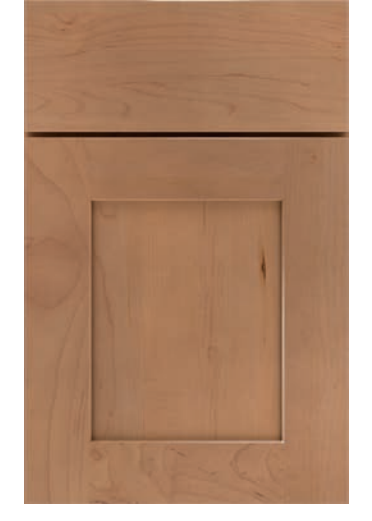
Northrope Slab Drawer Front ©©© A