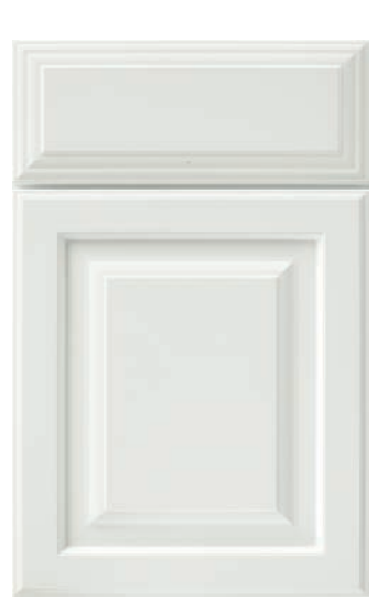
Vaille Raised Slab Drawer Front ①