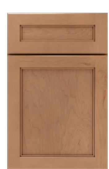
Lawton 5-Piece Drawer Front ©©