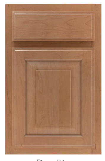
Dewitt • Profiled Slab Drawer Front ©©®®® 🖪