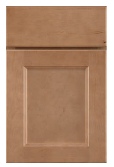
Justin Profiled Slab Drawer Front ©®