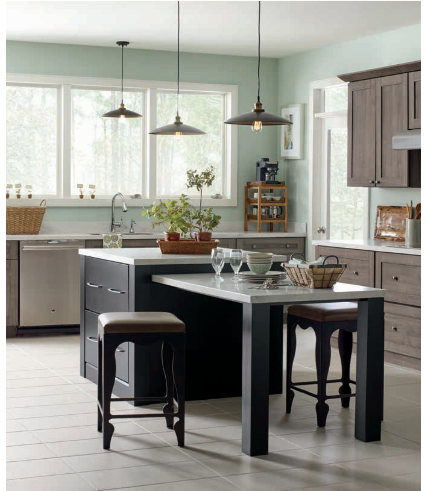
style SHAFER CAPRICE material PURESTYLE™ MAPLE finish ELK BLACK PAINT