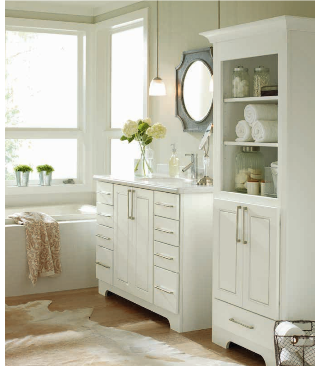
style DARBY material MAPLE finish WHITE PAINT