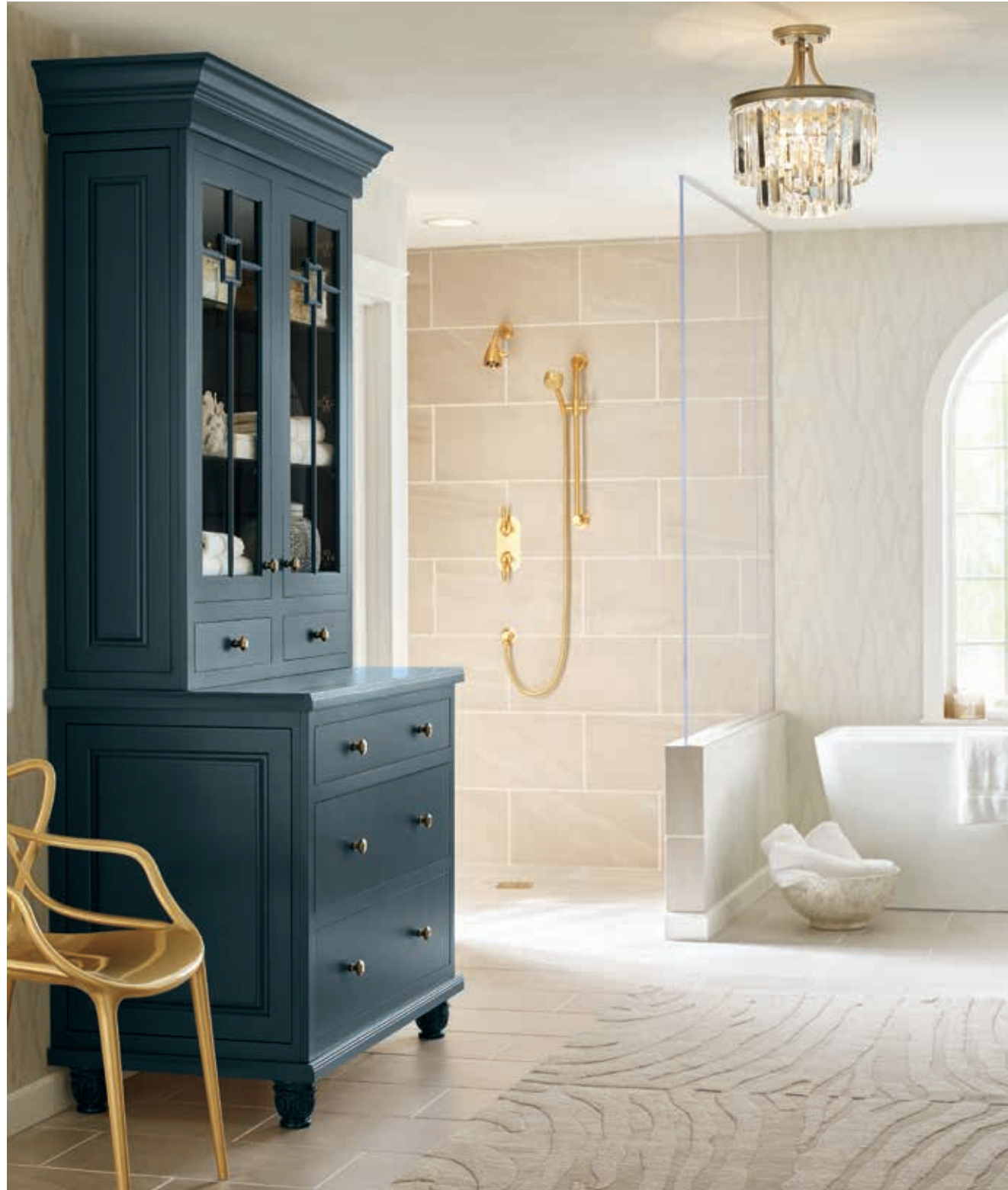
style SHANLEY INSET material MAPLE finish MARITIME PAINT