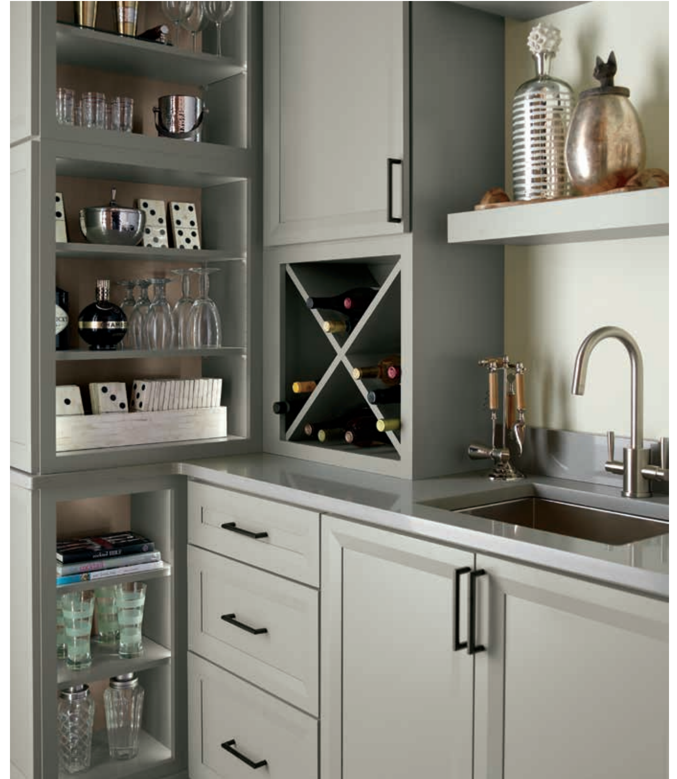
style BURKE material MAPLE finish STONE TRAIL PAINT