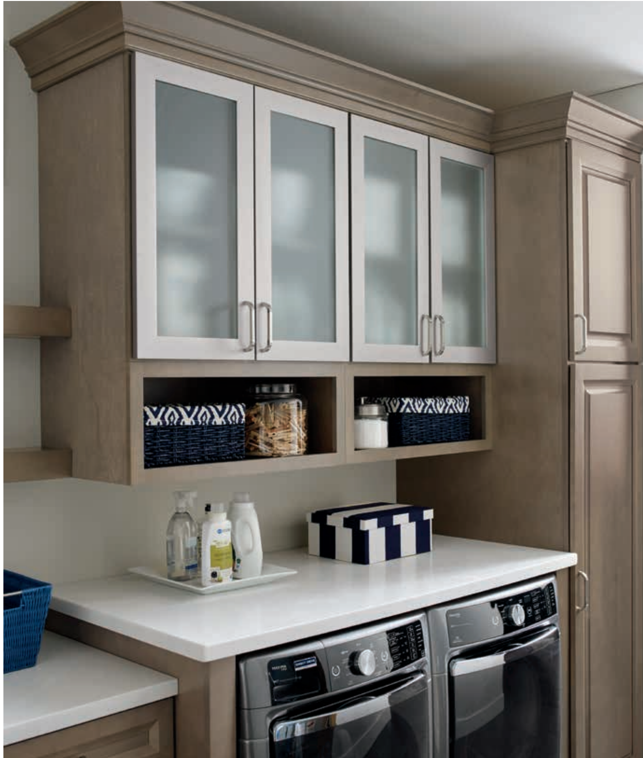
style HARDIN material MAPLE finish SEAL STAIN