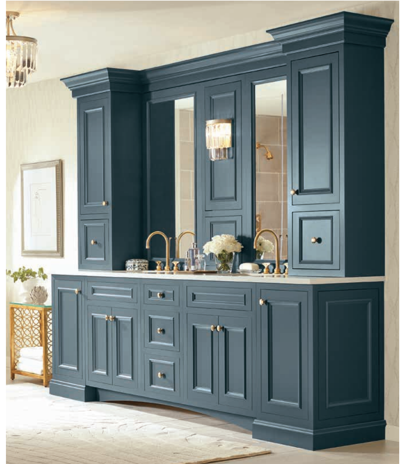
style LANDRY INSET material MAPLE finish MARITIME PAINT