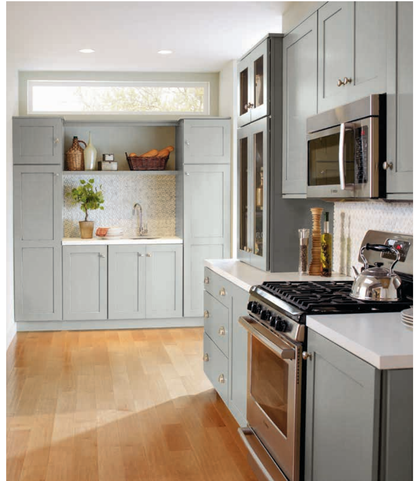
style NORTHROPE material MAPLE finish JUNIPER BERRY PAINT