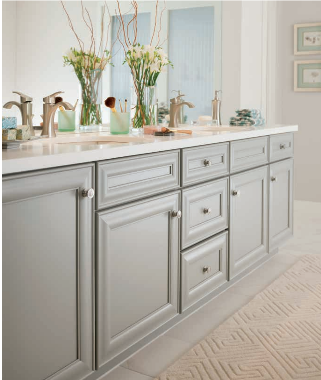
style ASHRIDGE material MAPLE finish CLOUD PAINT