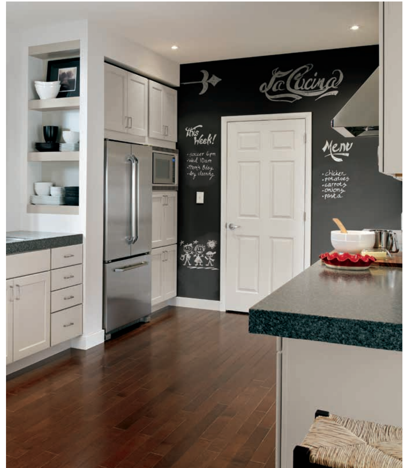
style WILLOWBY finish PAINTED LIMESTONE