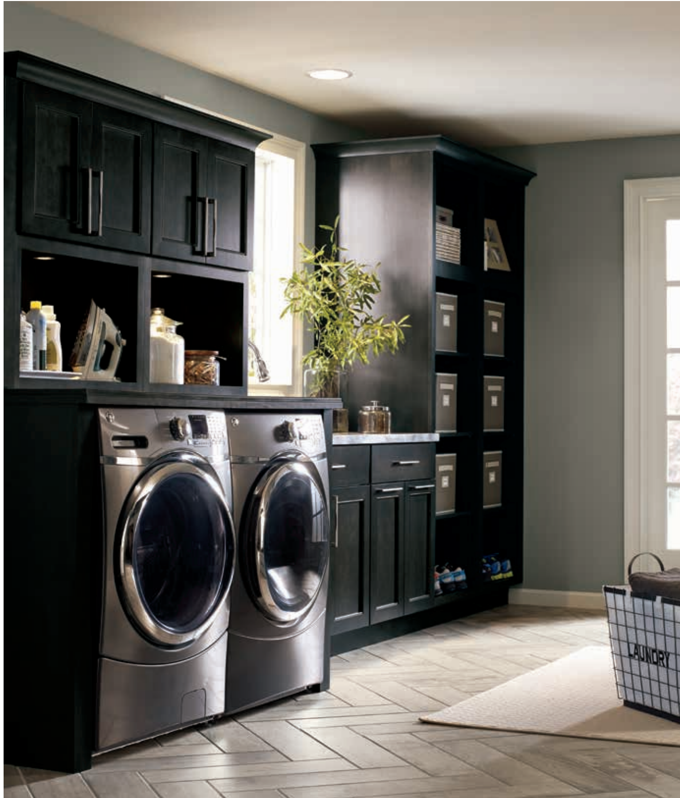
style COTTER material CHERRY finish STORM STAIN