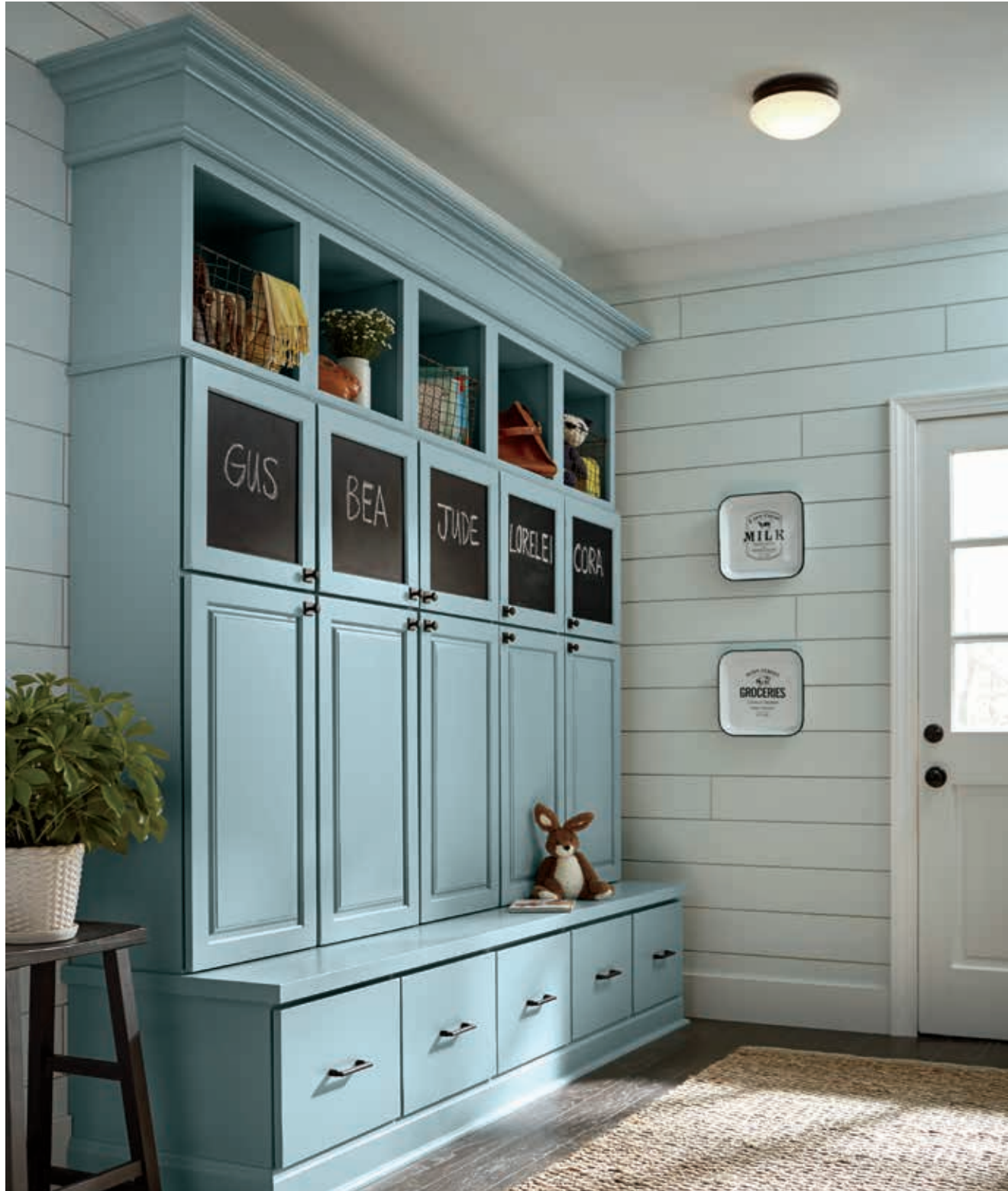
style SHANLEY material MAPLE finish INTERESTING AQUA PAINT Extra Hewn Technique