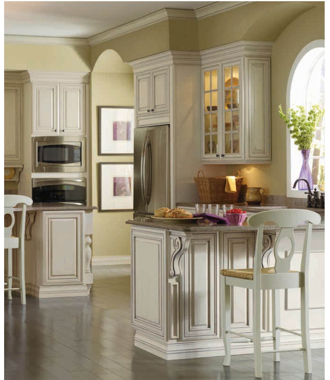
style KINGSTON material MAPLE finish COCONUT PAINT with GREY STONE FLOODED GLAZE