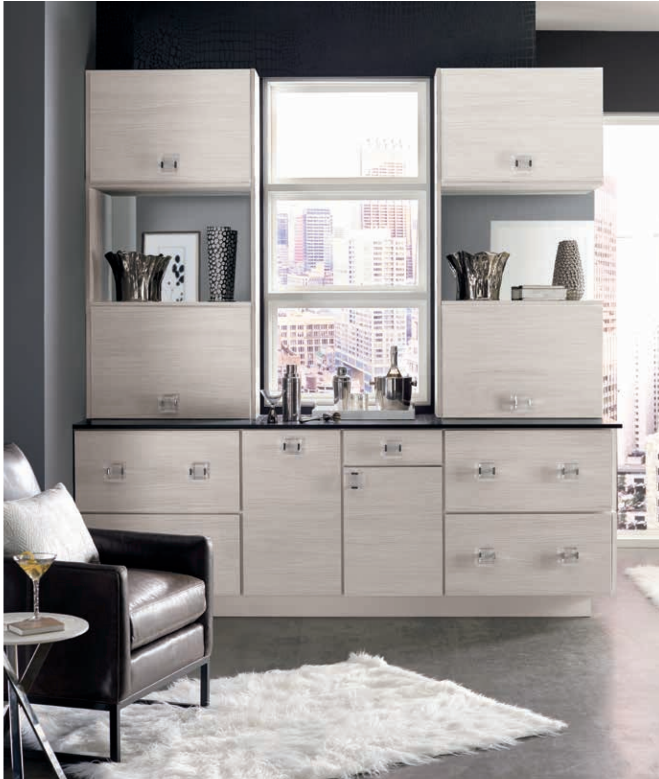
style TROXEL material LAMINATE finish ARCTIC