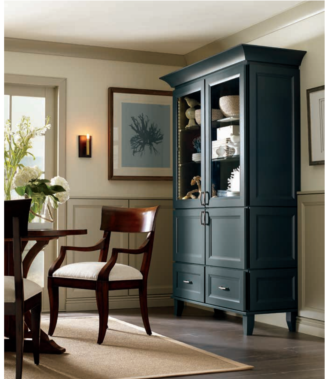
style BUTLER material MAPLE finish MARITIME PAINT