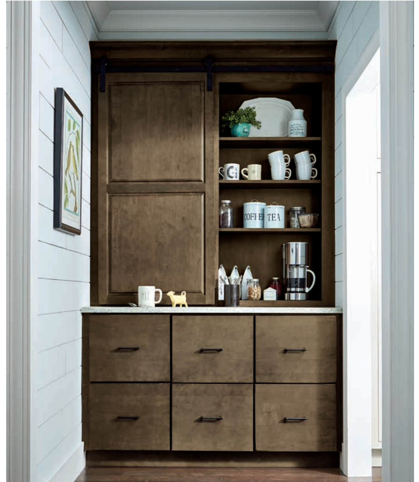
style SHANLEY material MAPLE finish MOREL STAIN Extra Hewn Technique