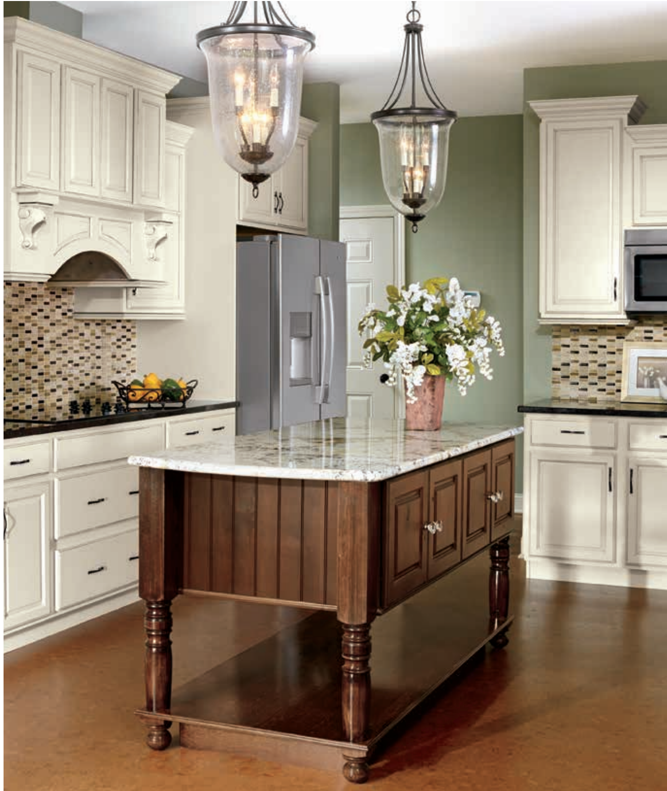
style GALLATIN FAIRBROOK material RUSTIC ALDER MAPLE finish TUNDRA STAIN COCONUT PAINT with AMARETTO CRÈME FLOODED GLAZE