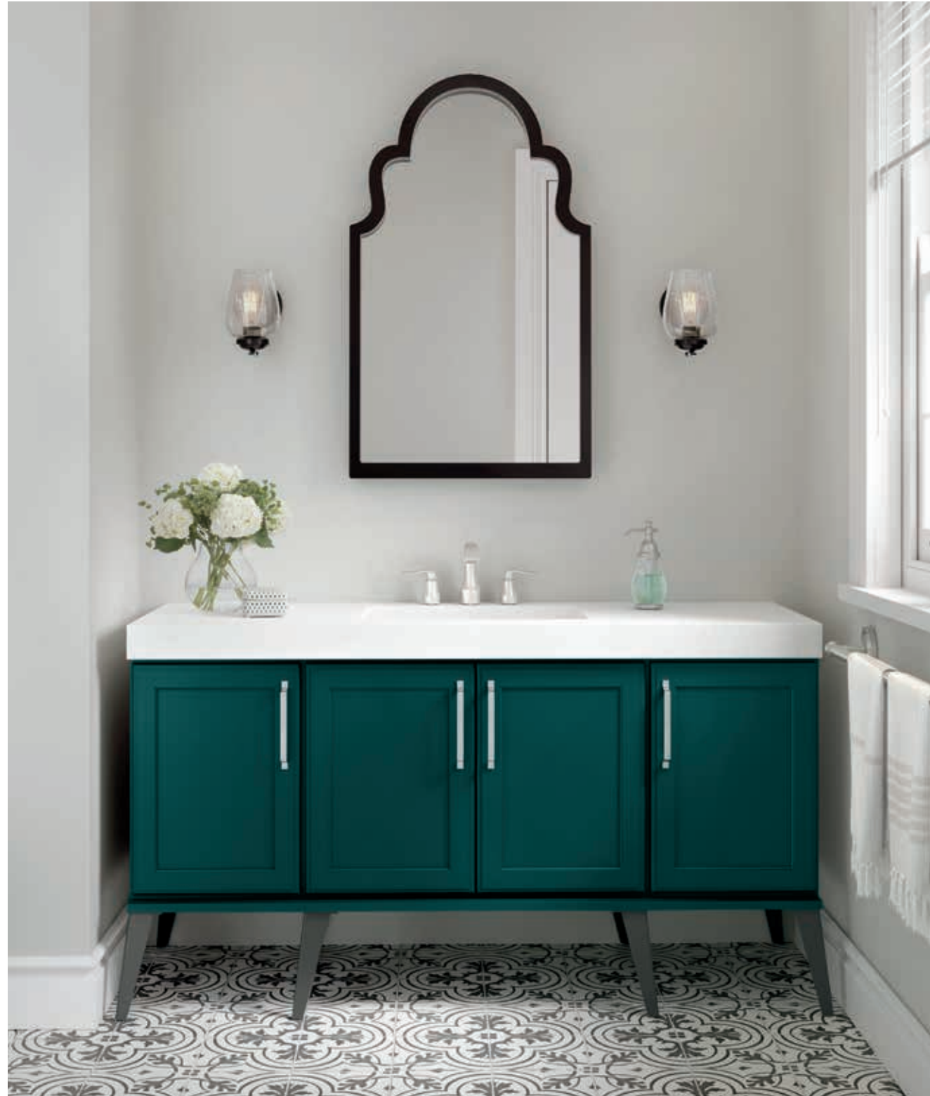
style GORDON material MAPLE finish ABYSS PAINT