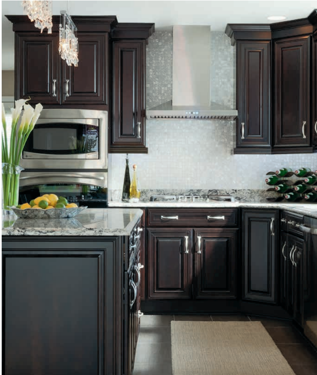
style KINGSTON material CHERRY finish CHOCOLATE STAIN