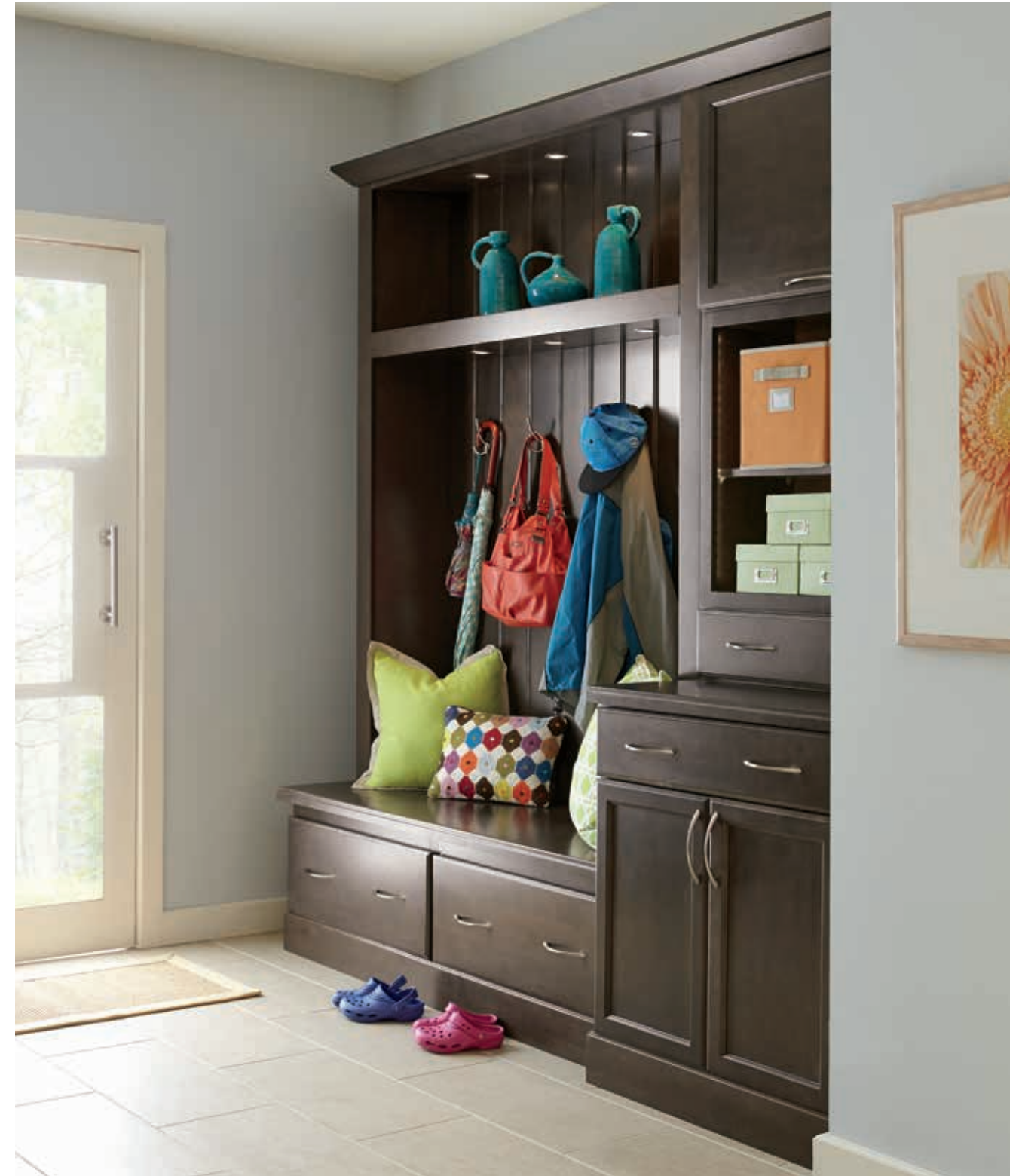
style BAXTER material MAPLE finish THATCH STAIN