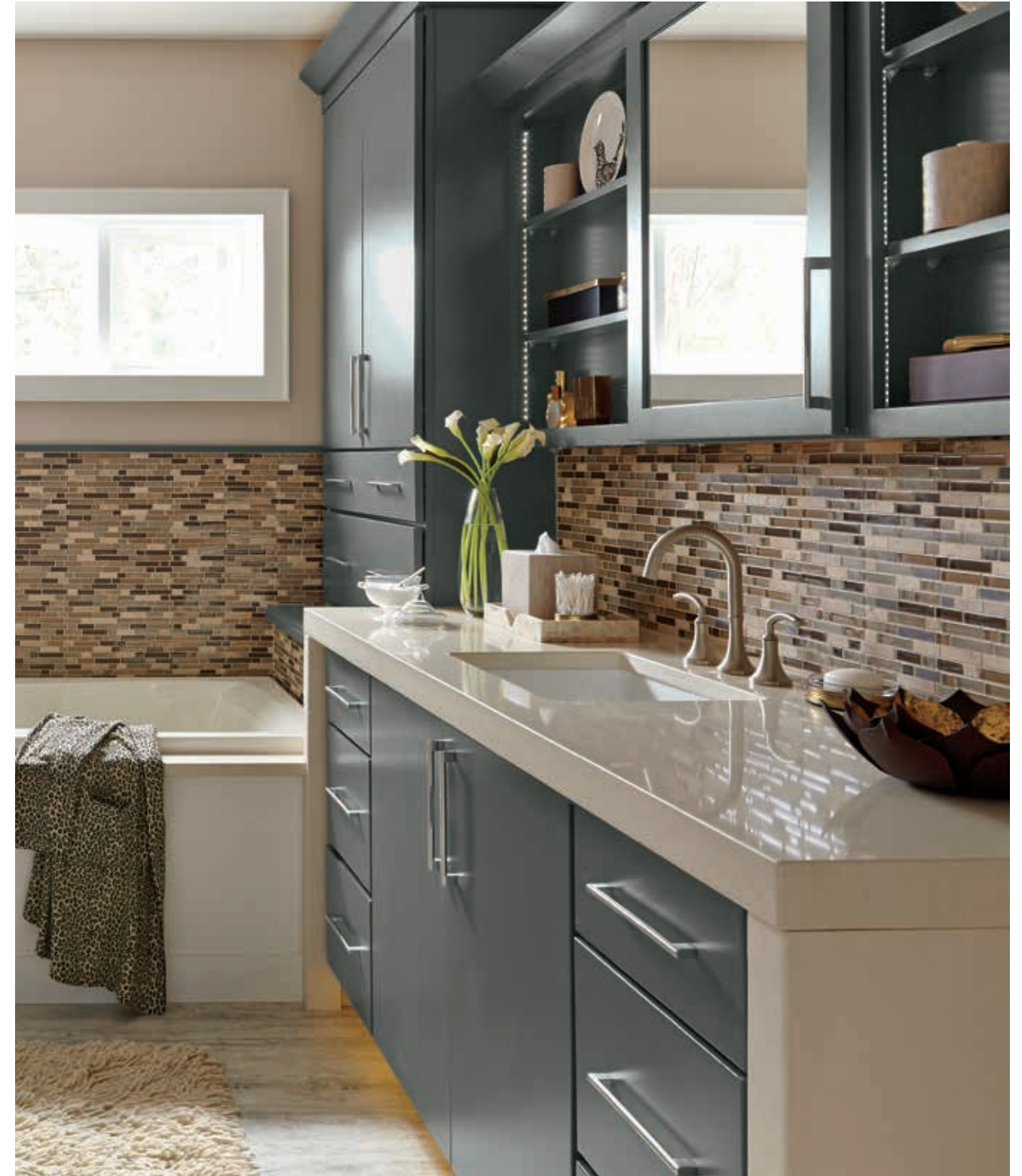
style CAPRICE material MAPLE finish MOONSTONE PAINT