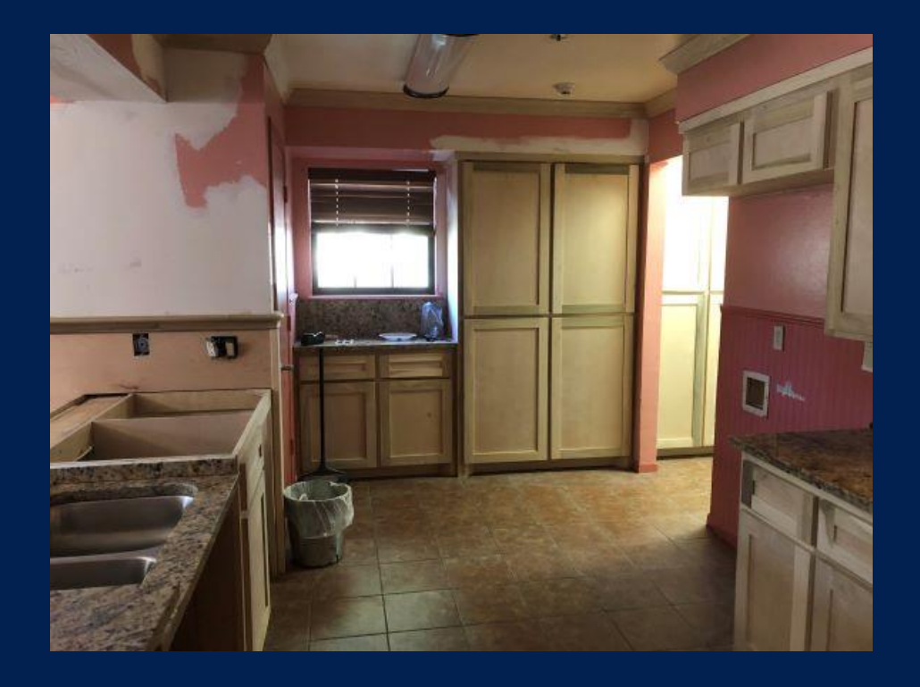
Pics of kitchen space in one home. Other home has same floorplan.