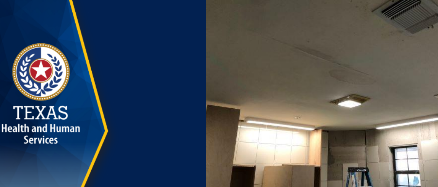
Pic of large restroom in one home. Other home has same floorplan.