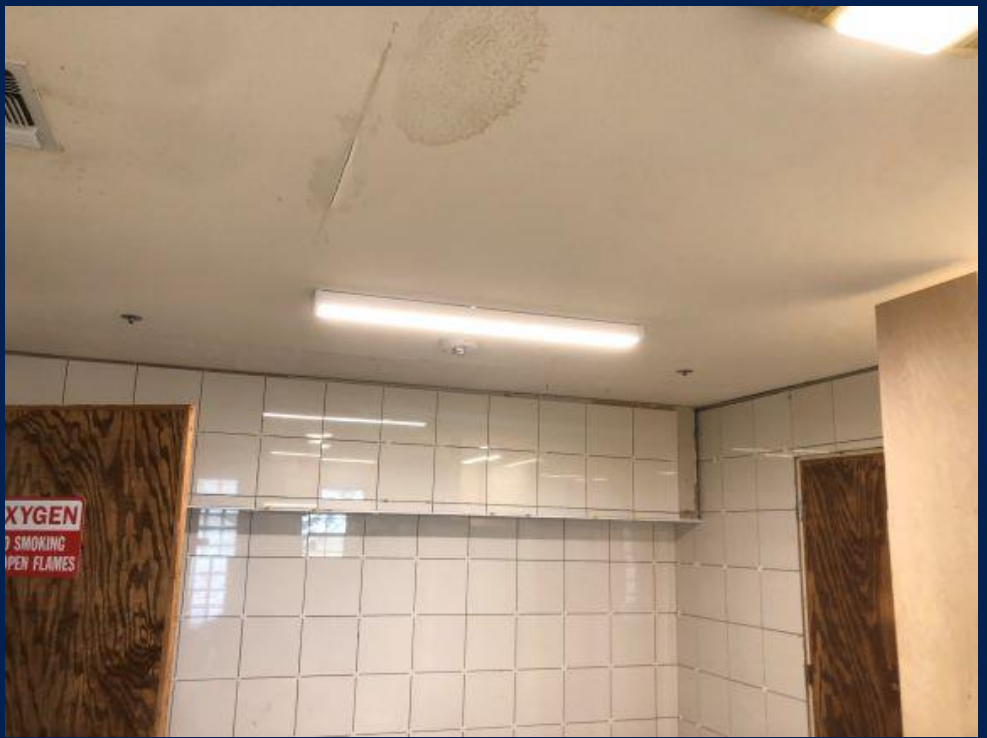
Pics of large restroom in one home. Other home has same floorplan.