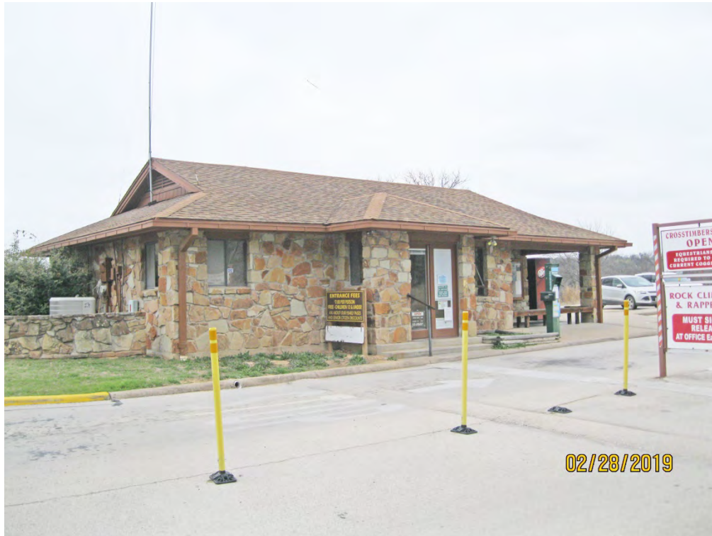
E. View at Headwall Flashing at Headquarters