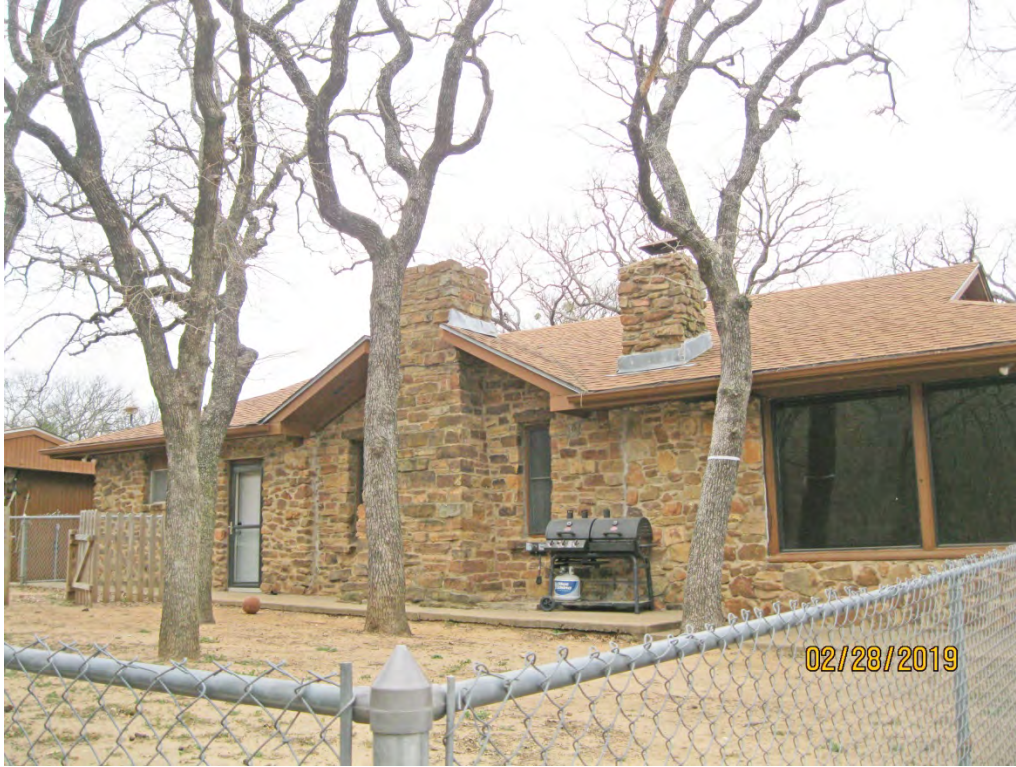
E. View at Fascia at Residence