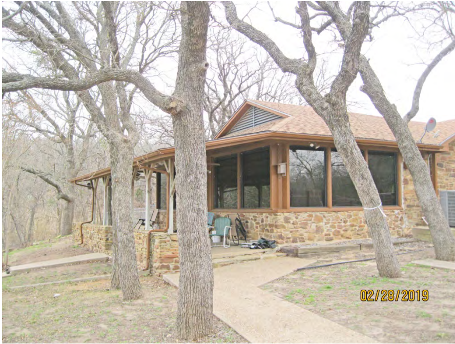
D. East View of Residence