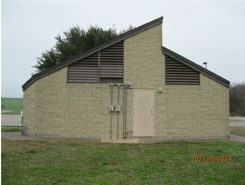
E. View at Headwall Flashing at Greenbelt East Comfort Station