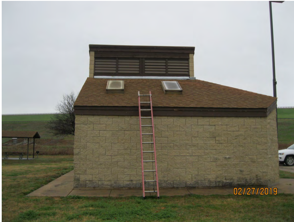
D. East View of Greenbelt West Comfort Station