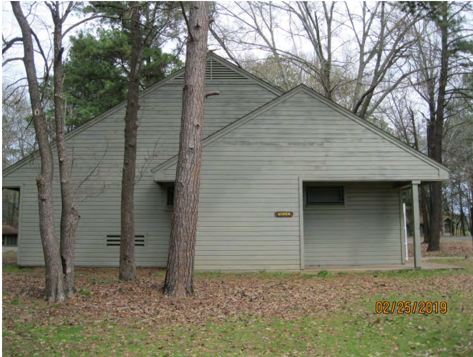
C. Northwest View of Broken Bowl Restroom