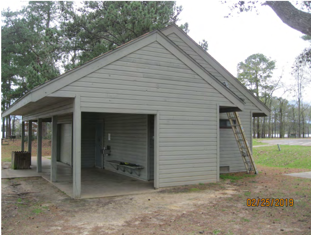
E. View at Sidewall Flashing at Boat Ramp Comfort Station