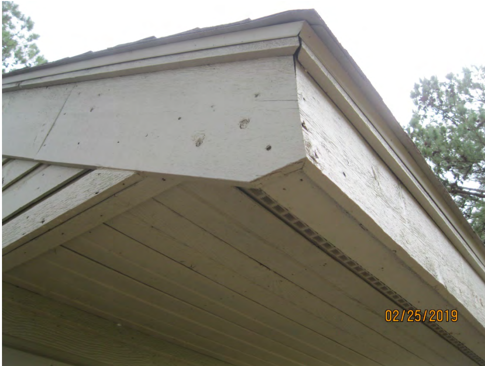
G. View at Ridge Vent at Boat Ramp Comfort Station