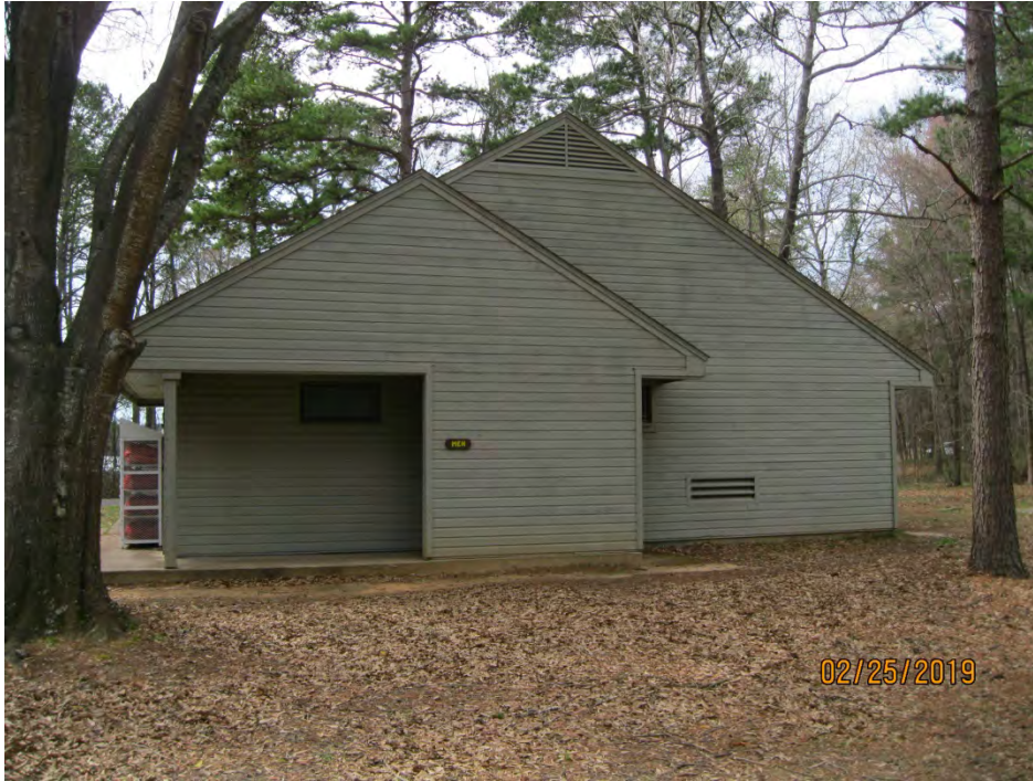
E. View at Sidewall Flashing at Broken Bowl Restroom