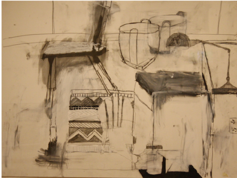
Winner from 2018 – Lily Cummins 'Into the Studio'