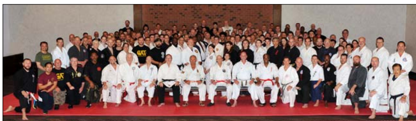
Shuri-Te Martial Arts International Conference April 2018