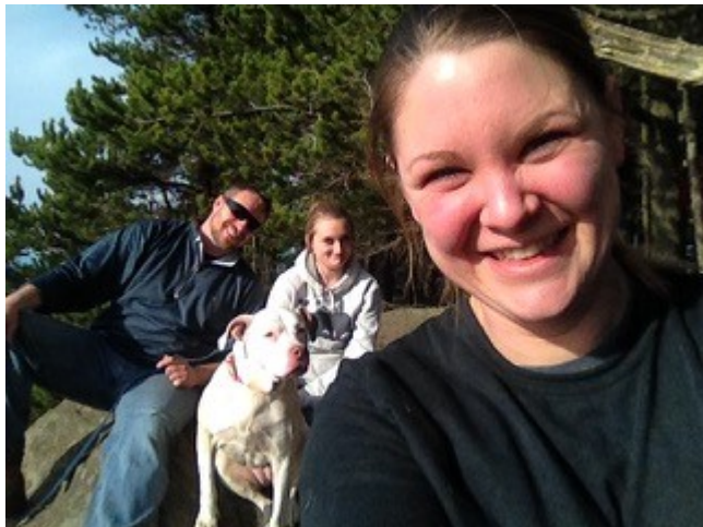
I chose this picture because without the support of my family I would not be where I am today :)