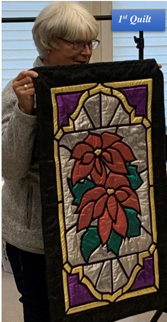
1 st Quilt