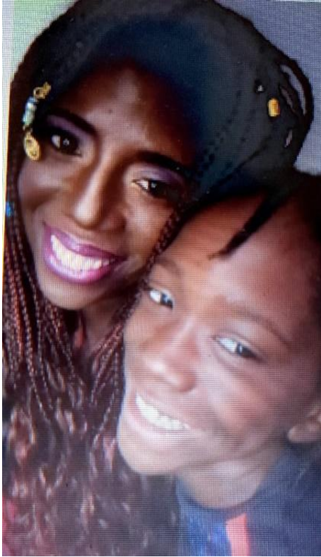
Figure 2a Mom and 7-year-old scholar