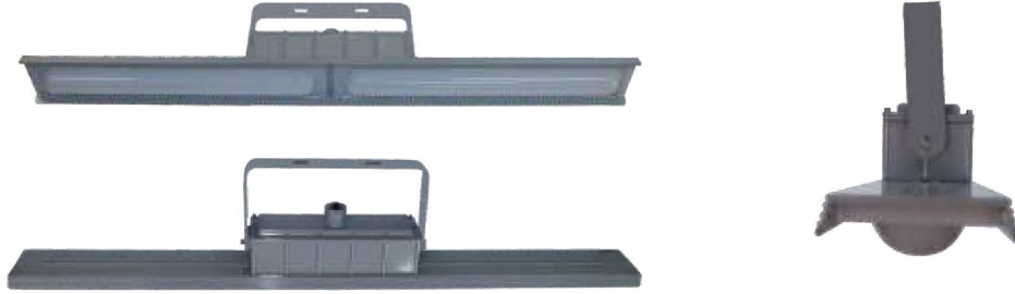
2FT/4FT Linear High Bay