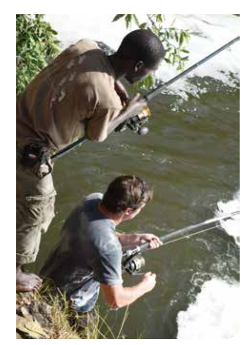
with it, to some degree, so too has gone the need to continuously catch great fish.

It was at that stage in my life that fishing changed its character and meaning for me. As a boy it was all about catching fish and when I lived in Runda, on the outskirts of Nairobi, I used to catch sardine-sized fish in a little trickle of river with insects and grubs on tiny hooks. I would long for weekend breaks back to Naivasha and, generally, just wanted bigger waterways with bigger fish in them. With every frustration of impatience characteristic of youth I longed to see the great fishes of the world. As time passed, and some of these great waterways have been found on my travels, the frustration has gone, but